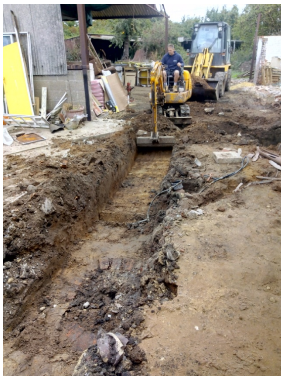
Plate 1 Foundation trench mid-excavation. View north-east