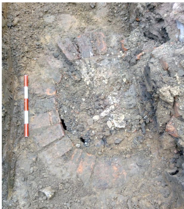
Plate 2 Brick lined well, view north-east