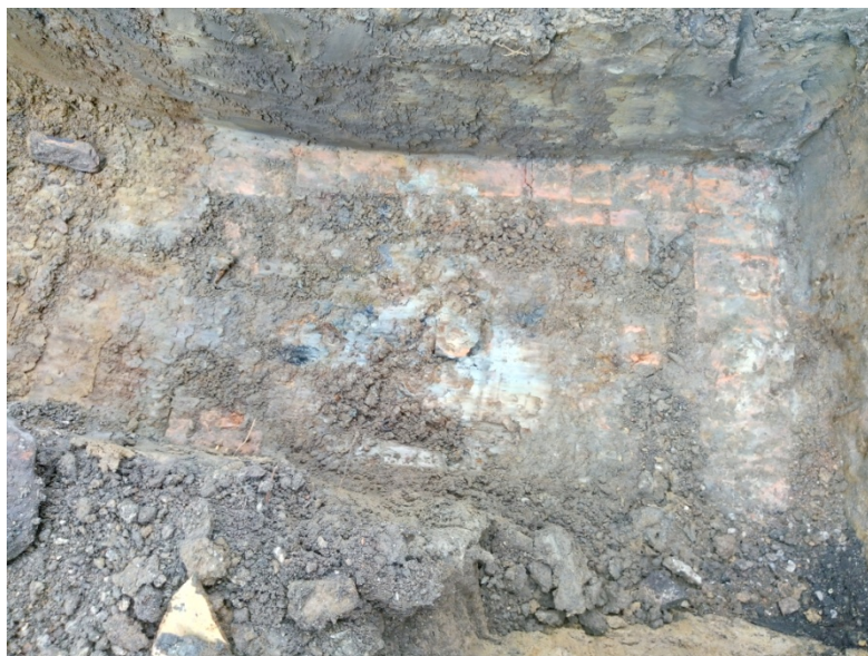
Plate 3 Brick structure, view north-east