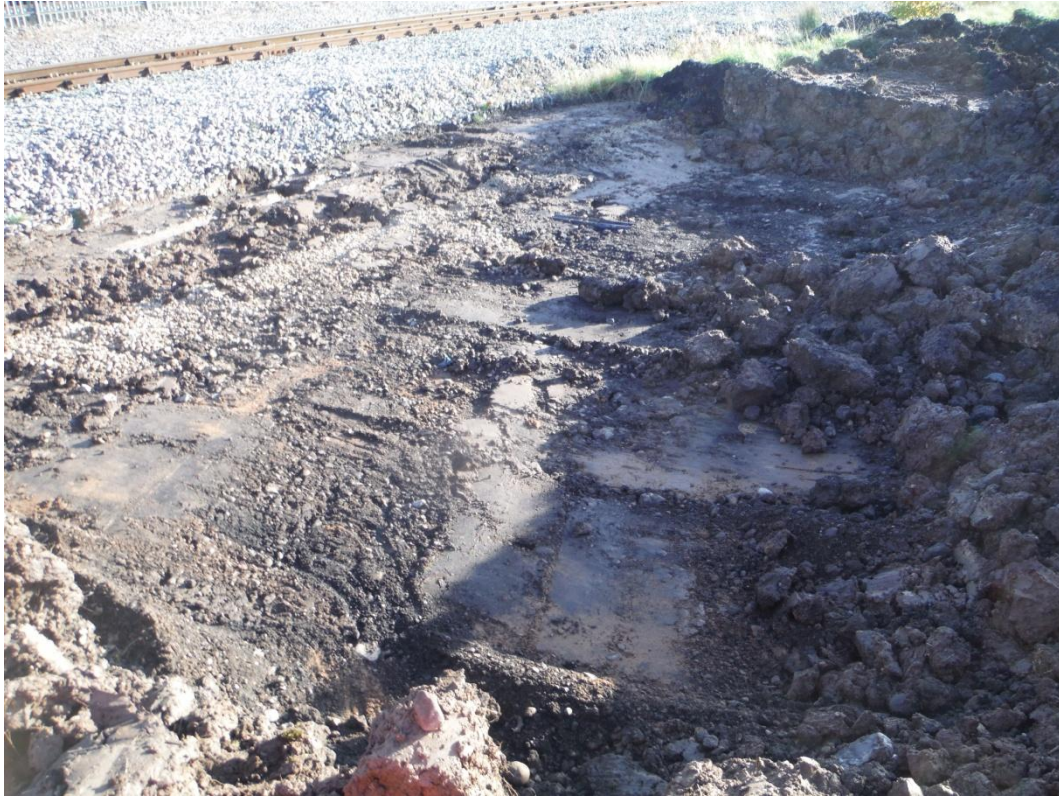
Plate 2 View of ground reduction at the north of development looking east

This Report has been prepared solely for the person/party which commissioned it and for the specifically titled project or named part thereof referred to in the Report. The Report should not be relied upon or used for any other project by the commissioning person/party without first obtaining independent verification as to its suitability for such other project, and obtaining the prior written approval of York Archaeological Trust for Excavation & Research Limited ("YAT"). YAT accepts no responsibility or liability for the consequences of this Report being relied upon or used for any purpose other than the purpose for which it was specifically commissioned. Nobody is entitled to rely upon this Report other than the person/party which commissioned it. YAT accepts no responsibility or liability for any use of or reliance upon this Report by anybody other than the commissioning person/party.