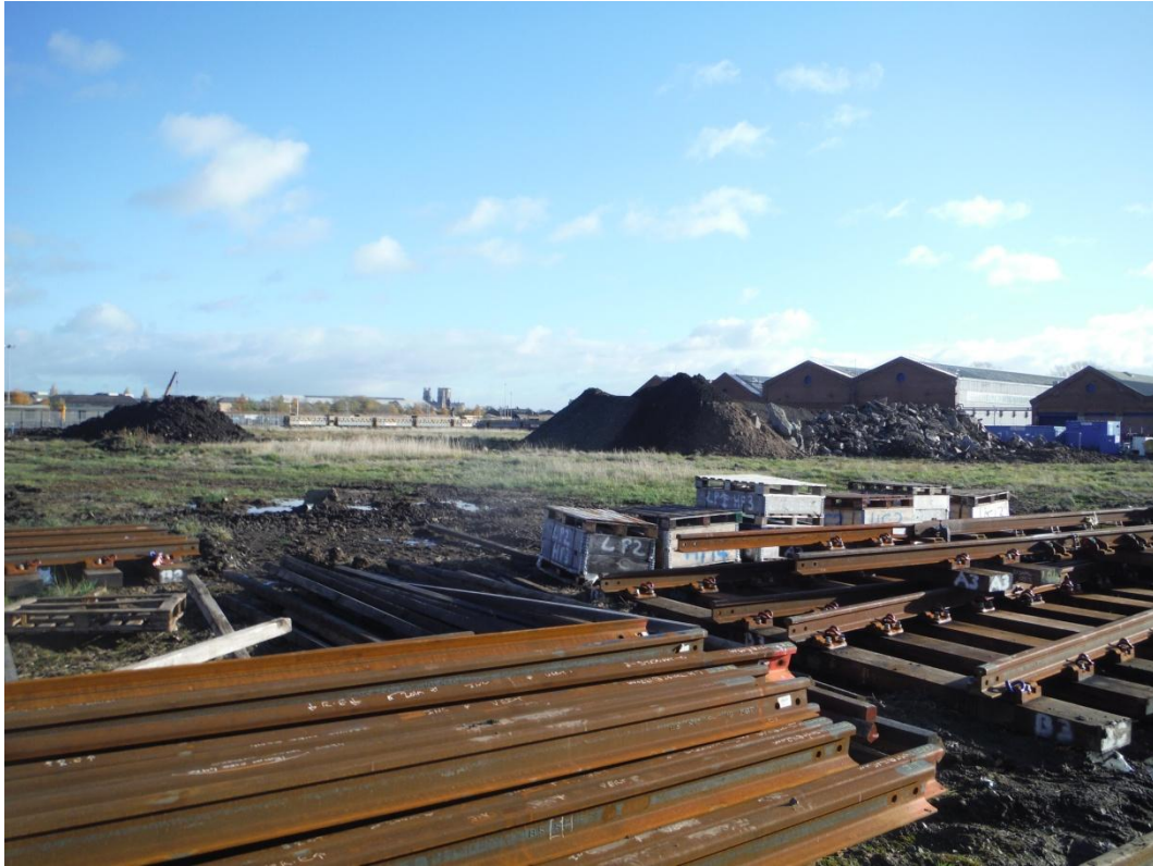
Plate 1 View of site looking east-north-east