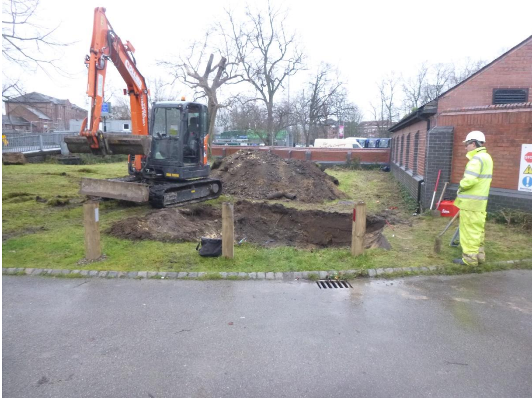
Plate 2 Exploratory trench under excavation. Looking south.