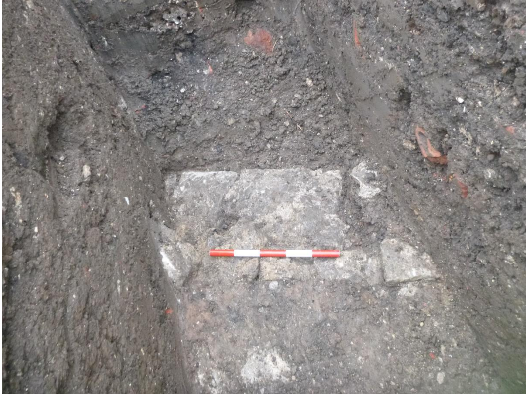
Plate 4 South-west wall of St. George's Chapel exposed for survey. Looking south-west.