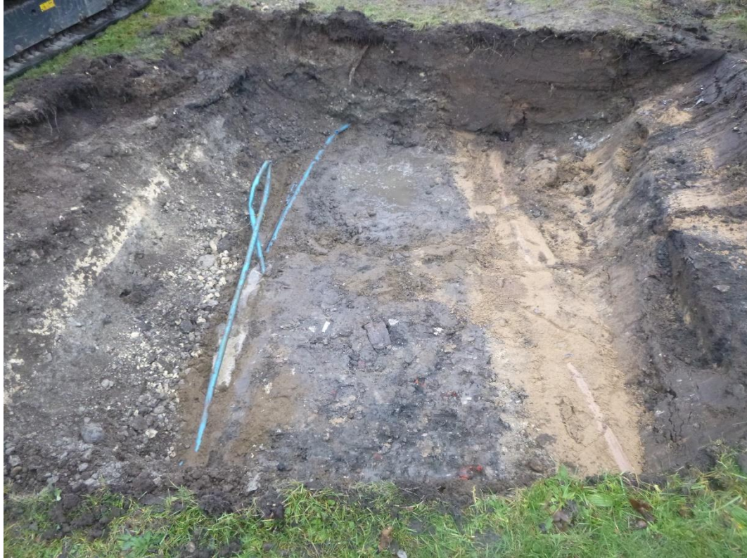
Plate 3 Fresh and foul water mains running across the line of 1990.17 Trench 3. Looking south-west.