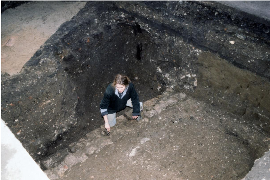
Plate 1 Trench 3 1990.17. The south-west wall of St. George's Chapel as exposed in the 1990 excavation. Looking west.