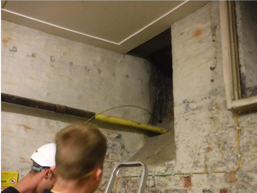
Plate 12 Phase 2 works, Openreach cable fed through into the Treasurer's House cellar