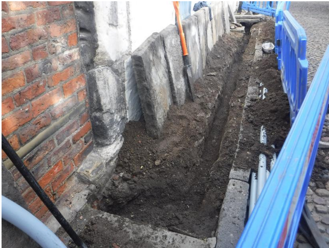
Plate 9 Phase 2 works, excavated to external wall of Treasurer’s House wall, looking north-east