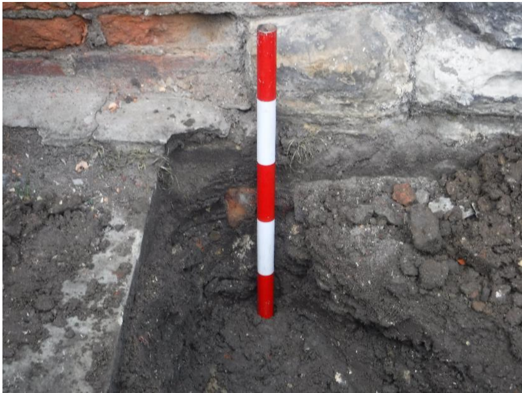
Plate 10 Phase 2 works, pre-drilling view of Treasurer's House wall, looking west