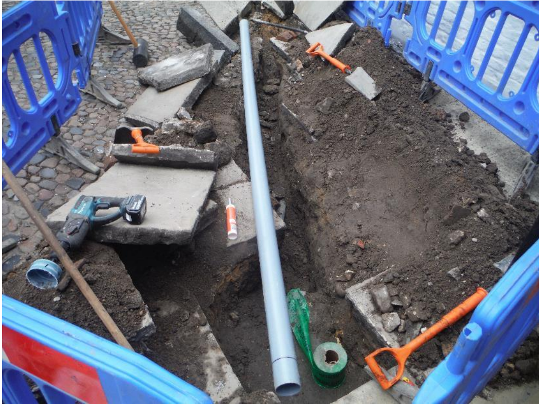
Plate 4 Phase 1 works, view of excavated cable trench, looking south-west