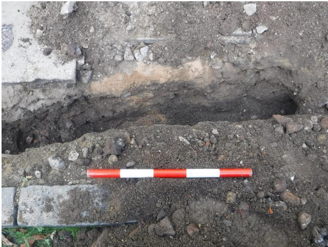
Plate 7 Phase 2 works, view of trench, looking west