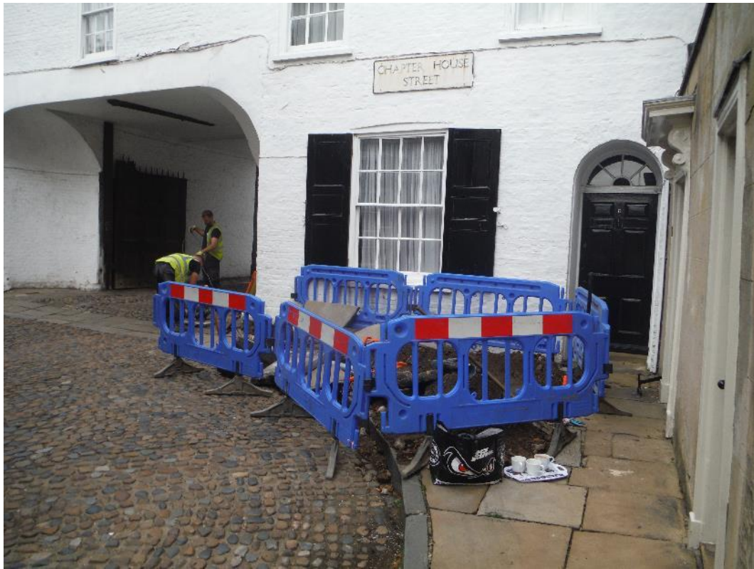
Plate 2 Phase 1 works, looking west