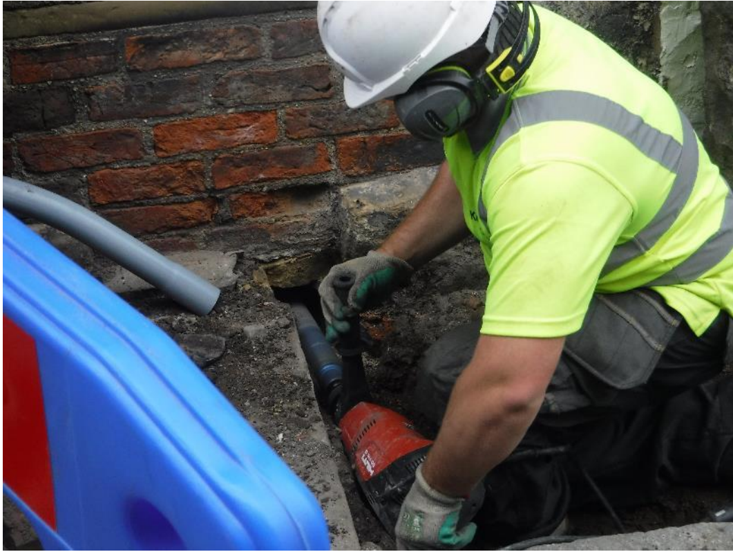
Plate 11 Phase 2 works, drilling into the Treasurer's House cellar, looking west