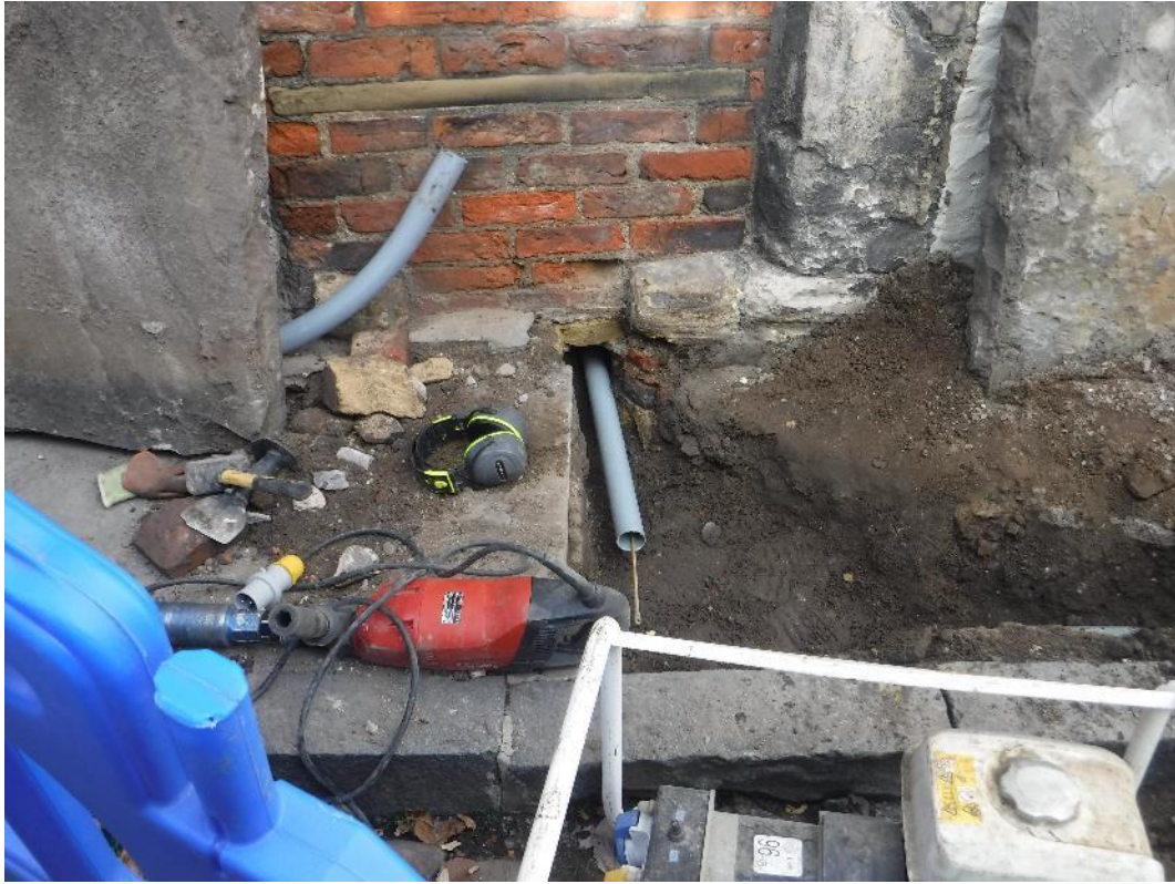
Plate 13 Phase 2 works, Openreach cable installed through Treasurer's House wall, looking west