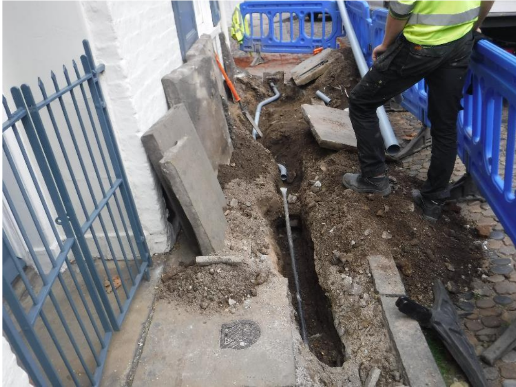
Plate 6 Phase 2 works, continuing from previous cable run, looking north-east