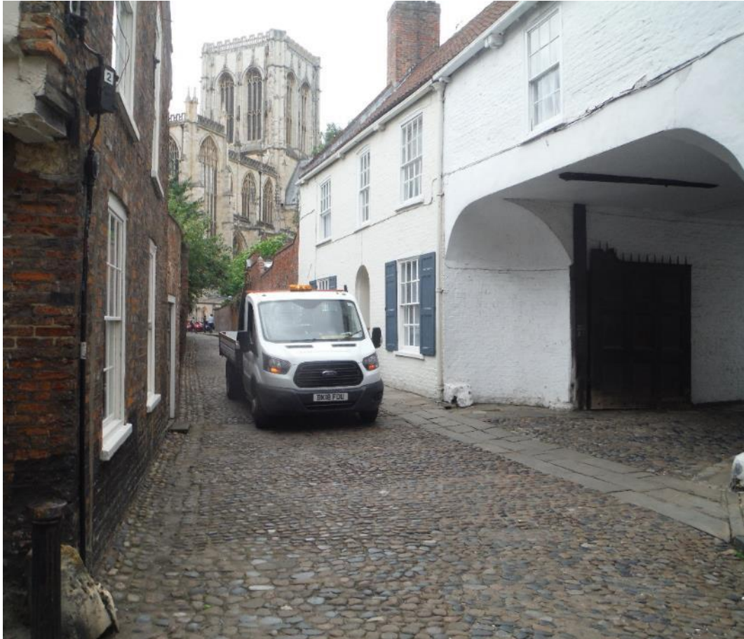
Plate 1 Chapter House Street, looking south-west