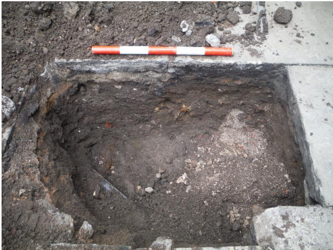
Plate 3 Phase 1 works, looking north-east