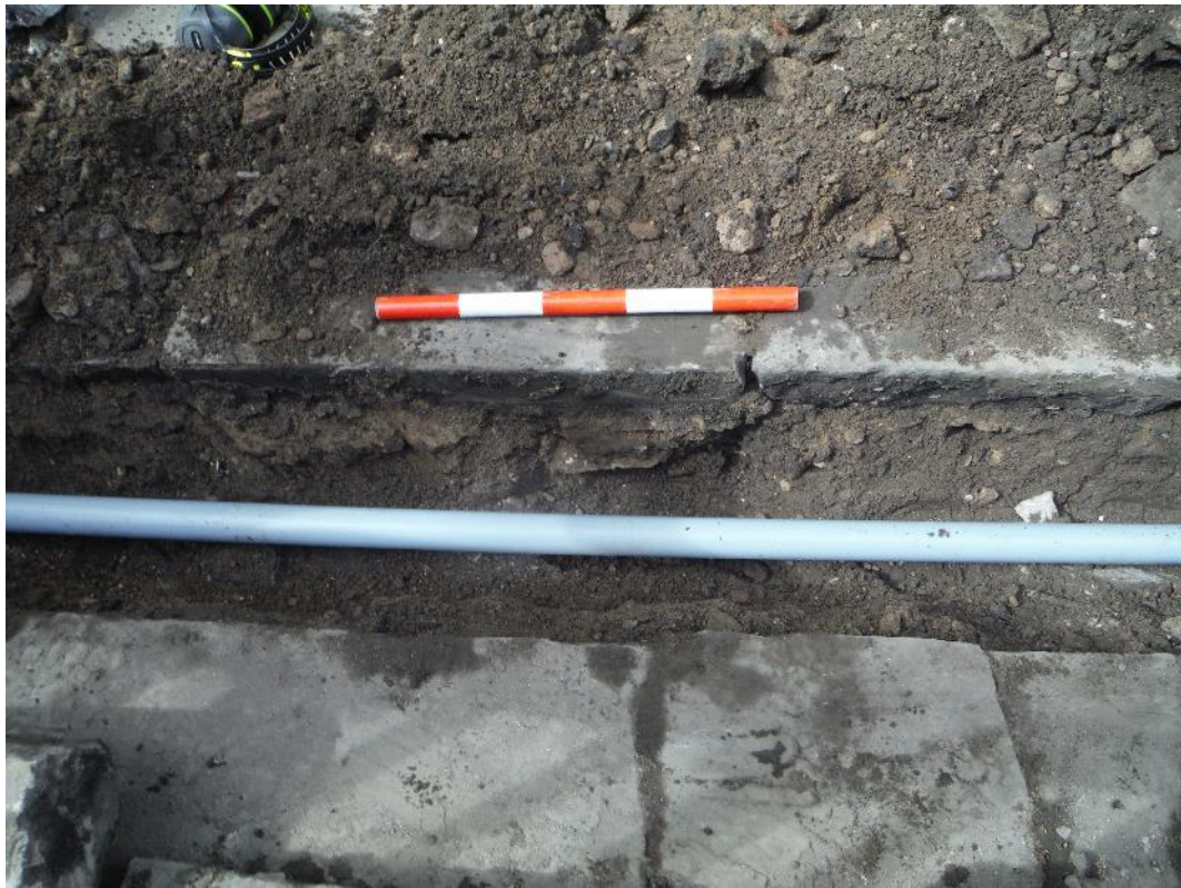
Plate 5 Phase 1 works, view of trench across entrance to Greys Hotel, looking west