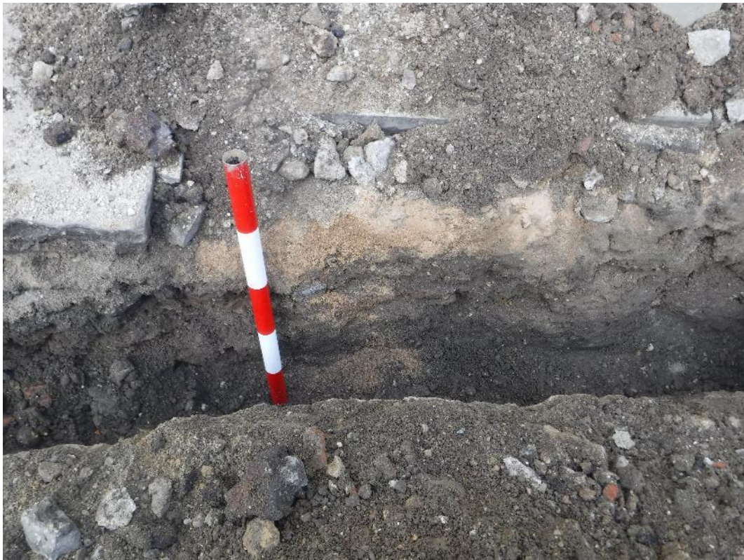
Plate 8 Phase 2 works, view showing depth of excavations, looking west