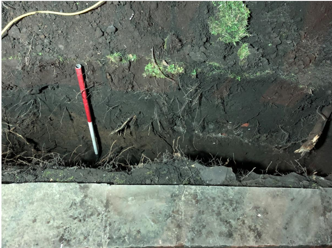
Plate 1 East facing view of trial hole S1 (1.00m scale)

Trial hole S6 was aligned north-east/south-west, 3.00m x 0.50m in plan and excavated to 1.20m below present ground level. The trial hole was dug several metres south-east of the entrance to Memorial Gardens where it intersected both the garden and the footpath (Figure 2). In the garden area, a heavily rooted topsoil deposit overlaid the fills of at least two modern service trenches including a live electricity cable (Plate 2). The sequence below the footpath was comprised of service trench backfills. No significant archaeological features, deposits or finds were observed.