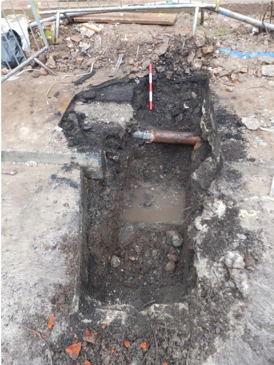
Plate 6 Trial pit 3 looking south. Scale Unit 0.5m.