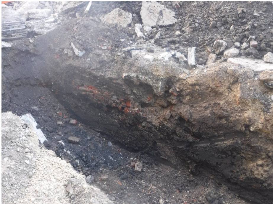
Plate 1 Brick structure and horticultural soil, looking north-west.