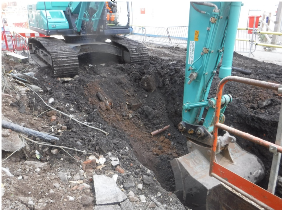
Plate 3 Working shot looking west.