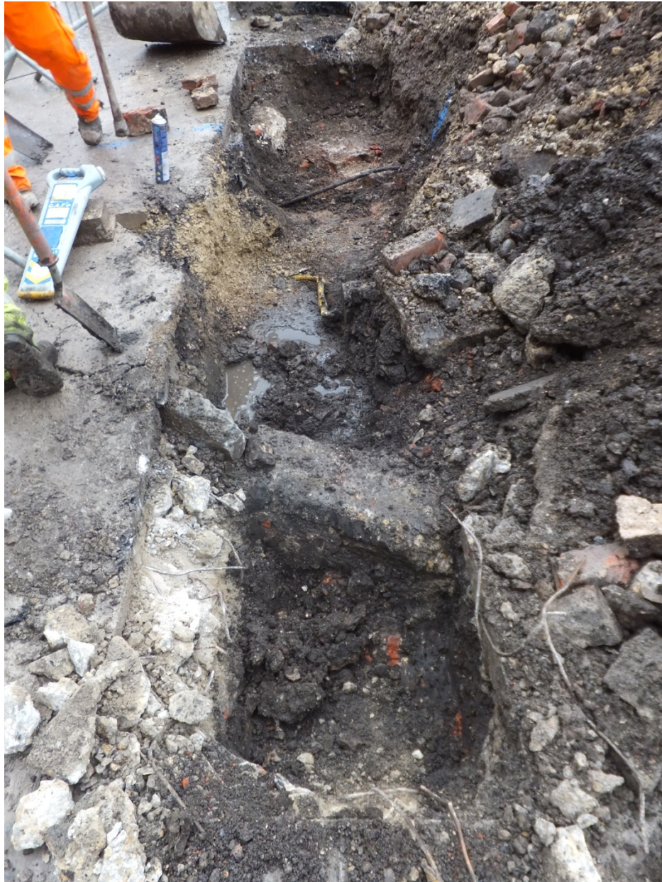
Plate 5 Trial pit 2 looking south east.