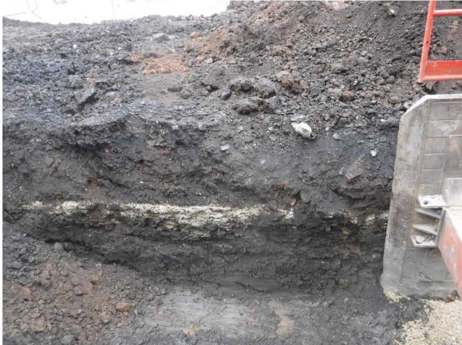
Plate 2 South facing section of attenuation drain trench