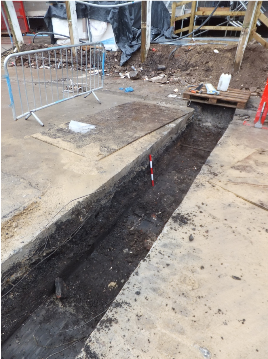
Plate 4 Trial pit 1 looking south-east. Scale unit 0.5m.