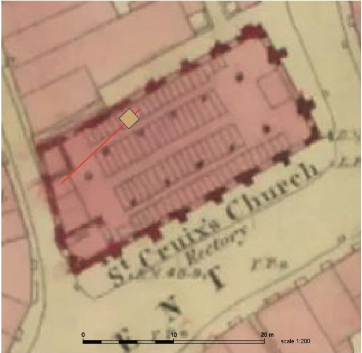
Figure 2 Works location overlaid on 1852 OS map.