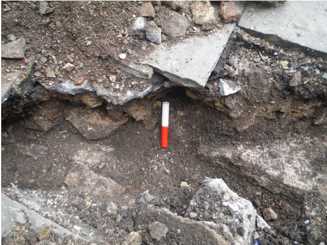
Plate 3 North-west facing trench section showing flagstones, demolition deposit and stone wall. Scale 20cm.

This Report has been prepared solely for the person/party which commissioned it and for the specifically titled project or named part thereof referred to in the Report. The Report should not be relied upon or used for any other project by the commissioning person/party without first obtaining independent verification as to its suitability for such other project, and obtaining the prior written approval of York Archaeological Trust for Excavation & Research Limited ("YAT"). YAT accepts no responsibility or liability for the consequences of this Report being relied upon or used for any purpose other than the purpose for which it was specifically commissioned. Nobody is entitled to rely upon this Report other than the person/party which commissioned it. YAT accepts no responsibility or liability for any use of or reliance upon this Report by anybody other than the commissioning person/party.