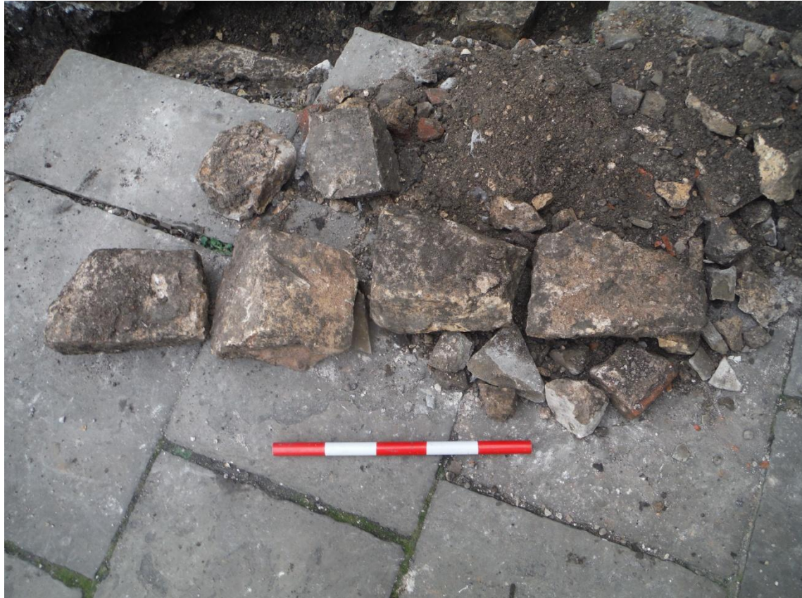
Plate 2 View of roughly shaped stone blocks from spoil heap. Scale 50cm