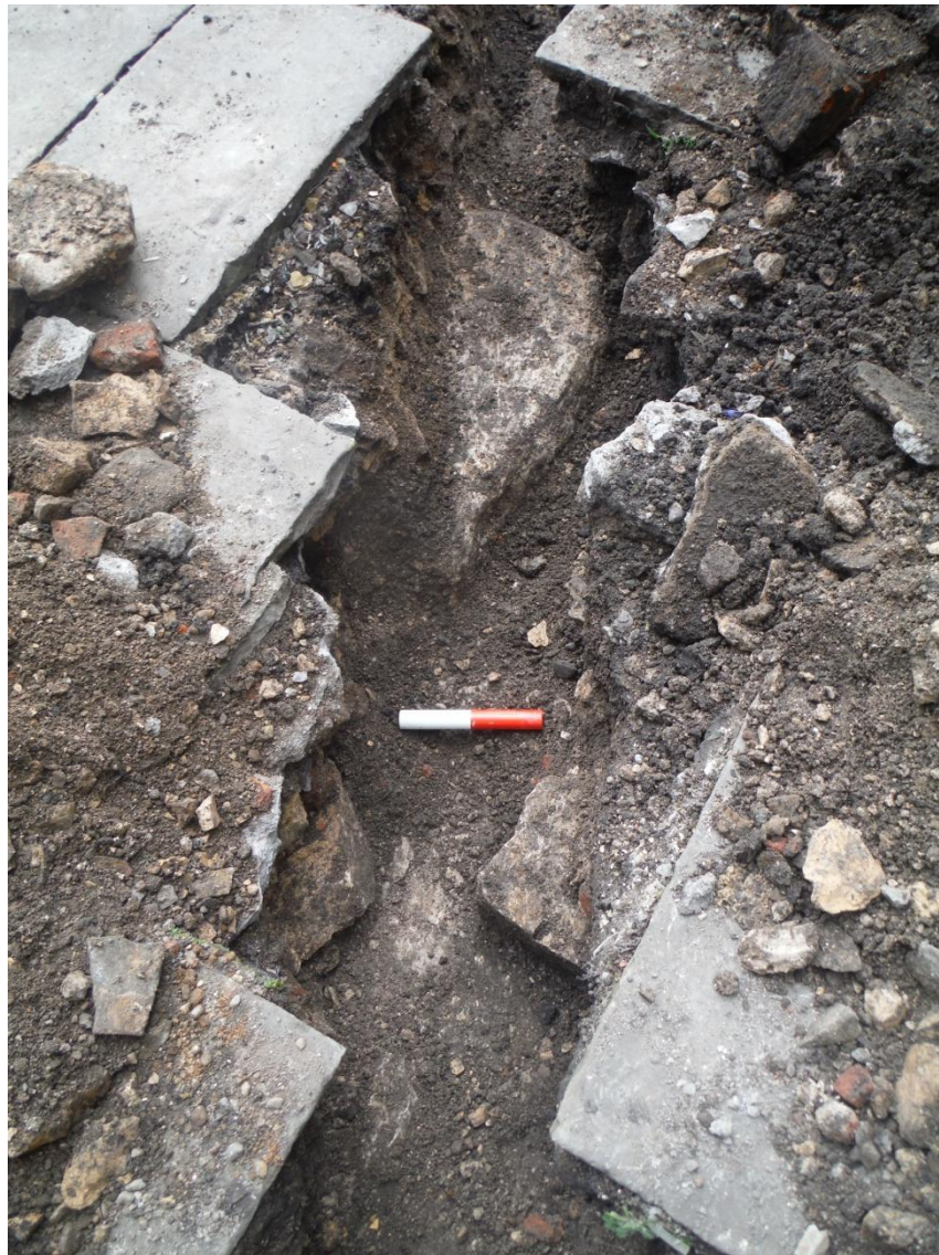
Plate 1 View of wall in base of trench looking south-west. Scale 20cm