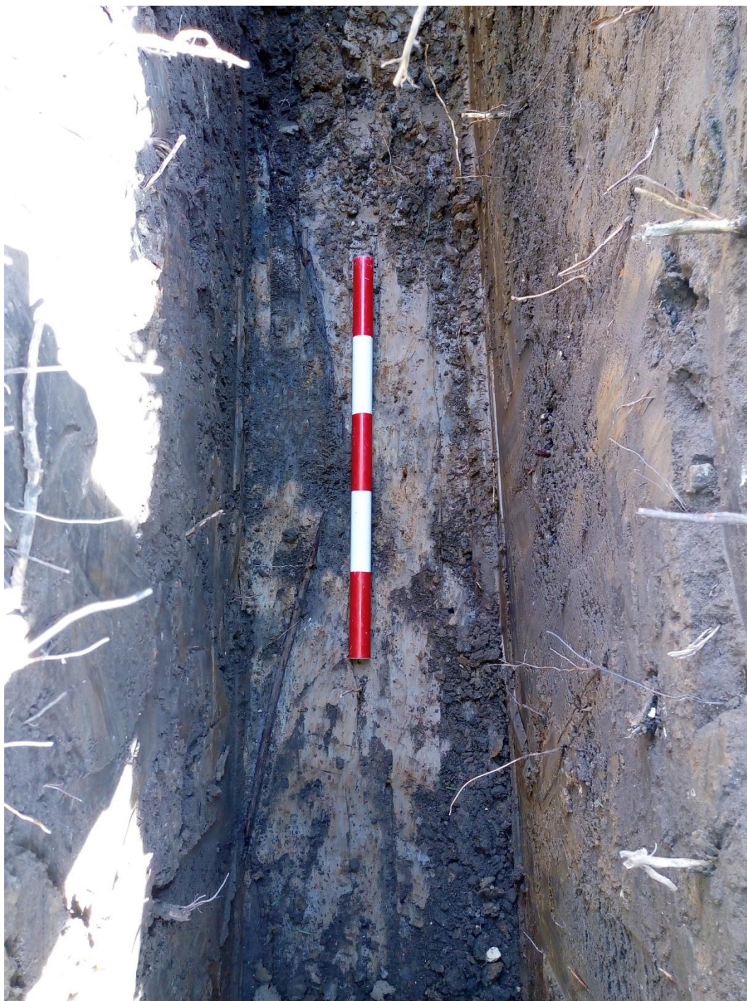
Plate 2 line of coffin lid of grave no. 2 looking east. Scale unit 100mm.