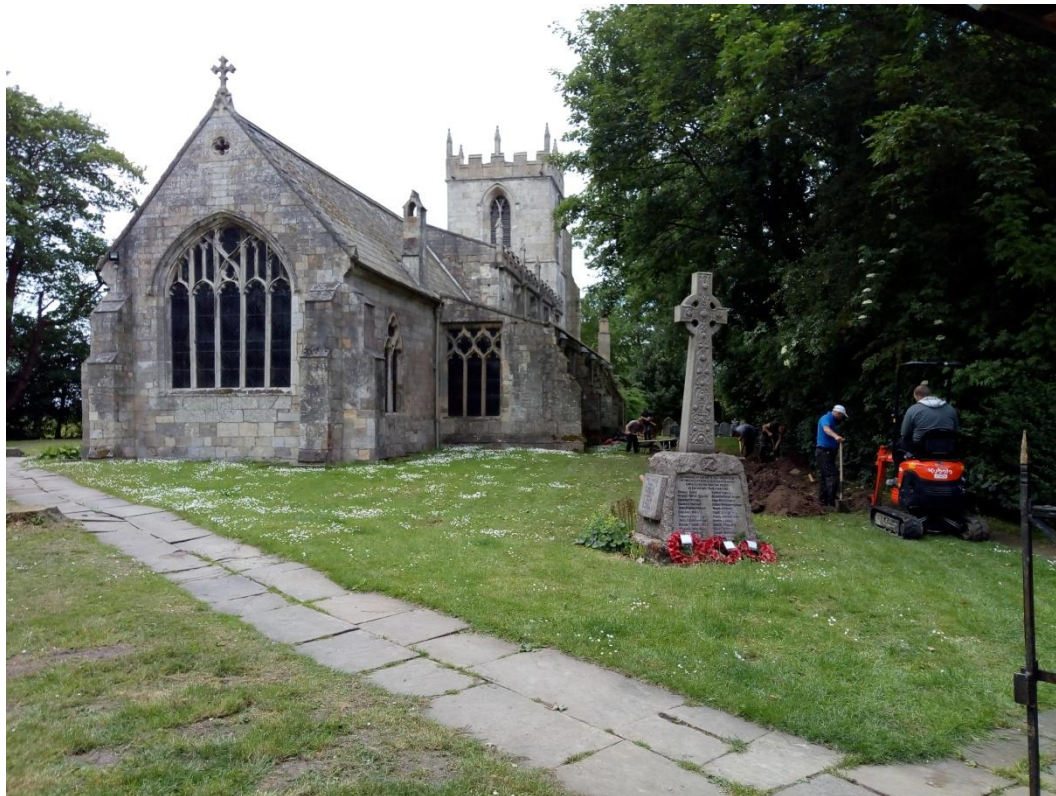
Plate 3 Location shot looking west.

This Report has been prepared solely for the person/party which commissioned it and for the specifically titled project or named part thereof referred to in the Report. The Report should not be relied upon or used for any other project by the commissioning person/party without first obtaining independent verification as to its suitability for such other project, and obtaining the prior written approval of York Archaeological Trust for Excavation & Research Limited ("YAT"). YAT accepts no responsibility or liability for the consequences of this Report being relied upon or used for any purpose other than the purpose for which it was specifically commissioned. Nobody is entitled to rely upon this Report other than the person/party which commissioned it. YAT accepts no responsibility or liability for any use of or reliance upon this Report by anybody other than the commissioning person/party.