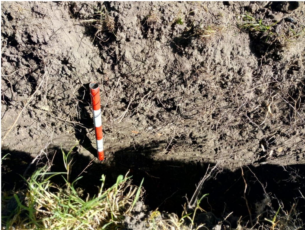
Plate 1 Representative section showing the churchyard topsoil overlying made ground looking north. Scale unit 100mm.