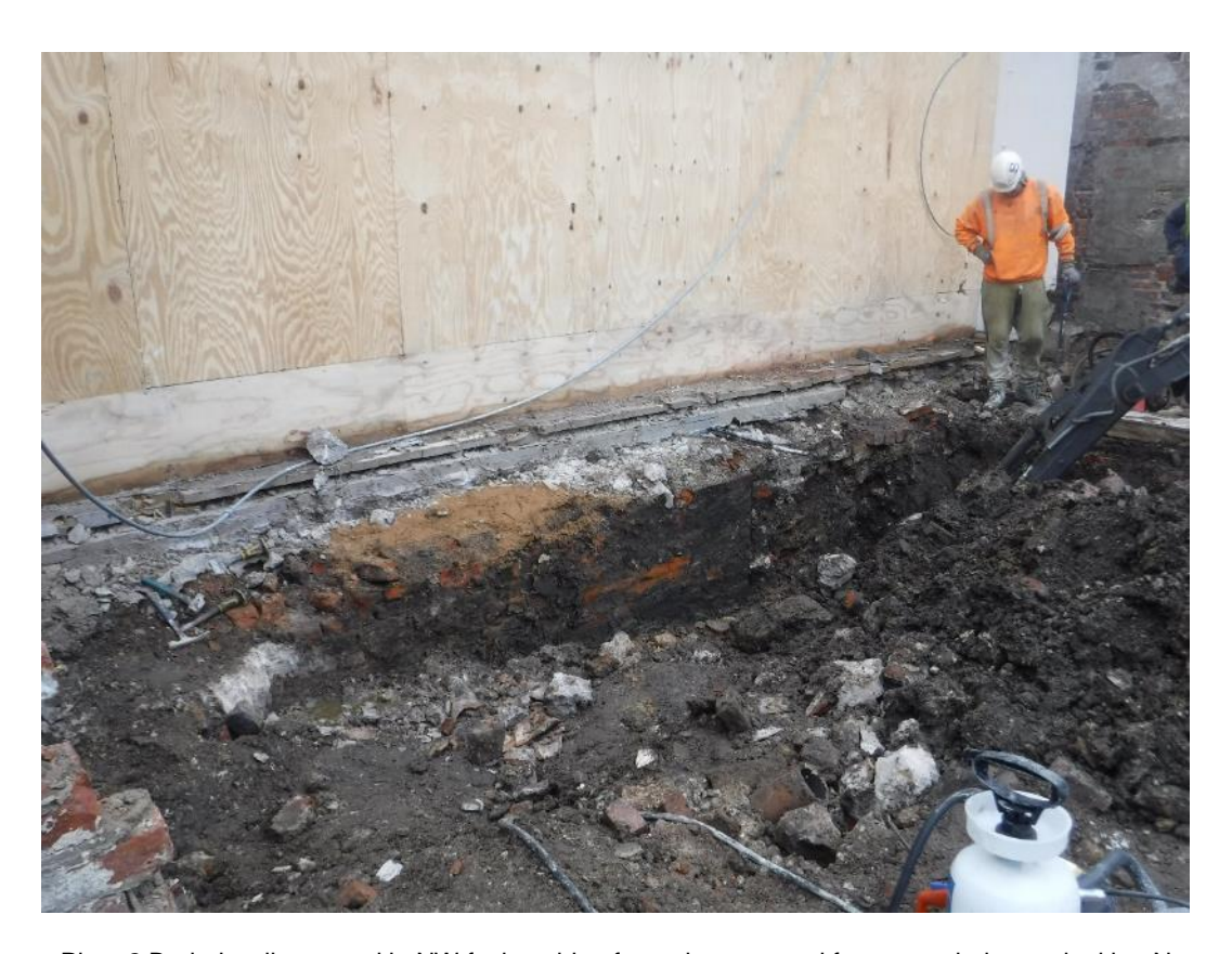
Plate 2 Buried wall exposed in NW facing side of trench excavated from new drain run, looking N