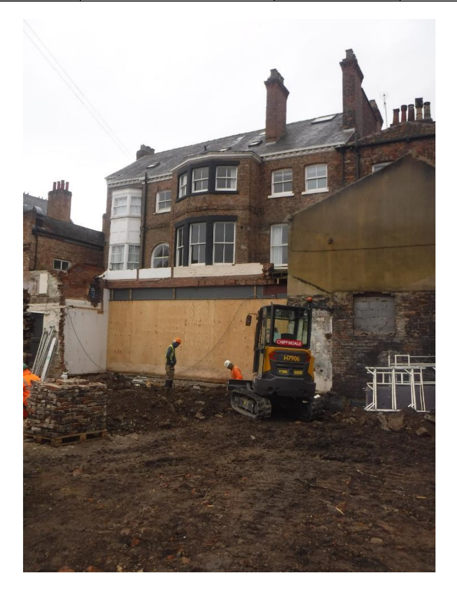
Plate 4 General view of Watching Brief at the rear of 27 Bootham area from the east

This Report has been prepared solely for the person/party which commissioned it and for the specifically titled project or named part thereof referred to in the Report. The Report should not be relied upon or used for any other project by the commissioning person/party without first obtaining independent verification as to its suitability for such other project, and obtaining the prior written approval of York Archaeological Trust for Excavation & Research Limited ("YAT"). YAT accepts no responsibility or liability for the consequences of this Report being relied upon or used for any purpose other than the purpose for which it was specifically commissioned. Nobody is entitled to rely upon this Report other than the person/party which commissioned it. YAT accepts no responsibility or liability for any use of or reliance upon this Report by anybody other than the commissioning person/party.