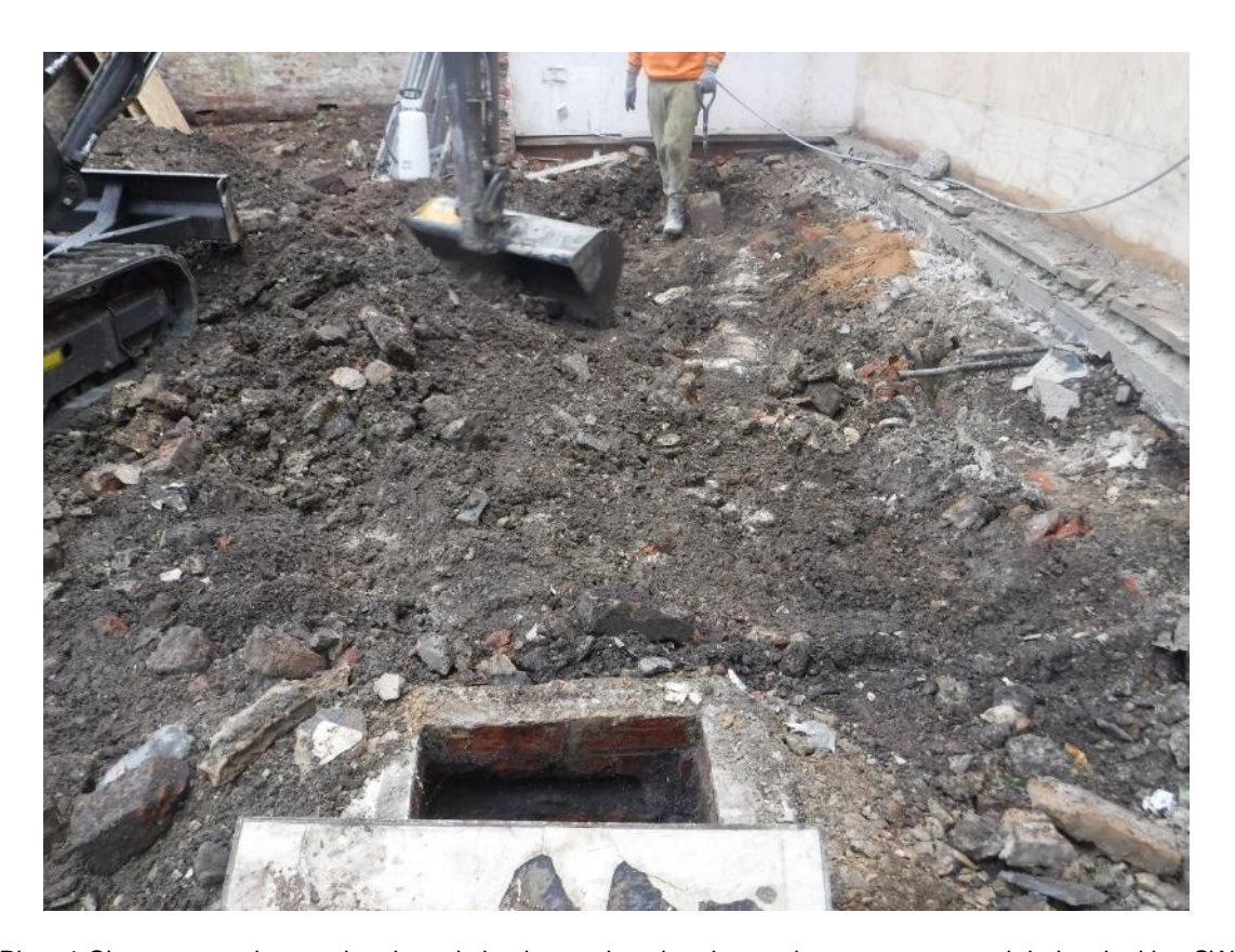
Plate 1 Clearance work exposing the existing inspection chamber and concrete encased drains, looking SW