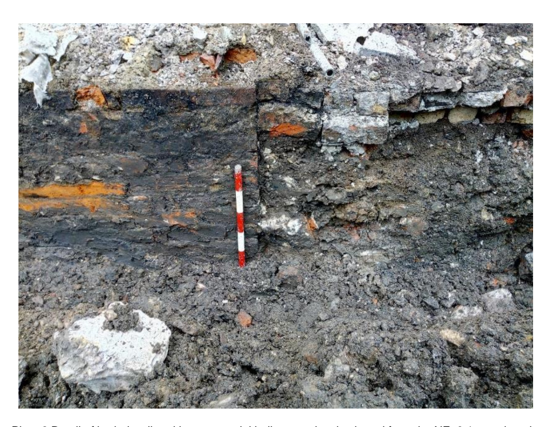
Plate 3 Detail of buried wall and loose material built up against it, viewed from the NE, 0.1m scale units