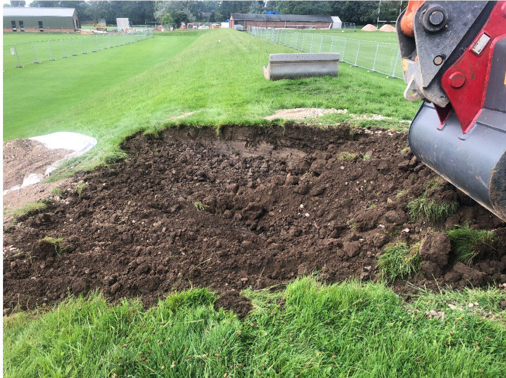
Plate 3 Excavation into the top of the flood embankment.

This Report has been prepared solely for the person/party which commissioned it and for the specifically titled project or named part thereof referred to in the Report. The Report should not be relied upon or used for any other project by the commissioning person/party without first obtaining independent verification as to its suitability for such other project, and obtaining the prior written approval of York Archaeological Trust for Excavation & Research Limited ("YAT"). YAT accepts no responsibility or liability for the consequences of this Report being relied upon or used for any purpose other than the purpose for which it was specifically commissioned. Nobody is entitled to rely upon this Report other than the person/party which commissioned it. YAT accepts no responsibility or liability for any use of or reliance upon this Report by anybody other than the commissioning person/party.