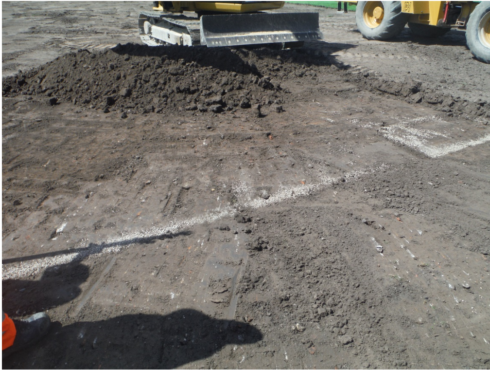
Plate 2 Example of field drains encountered at 4m intervals.