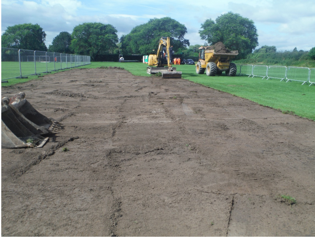
Plate 1 General view of compound strip.