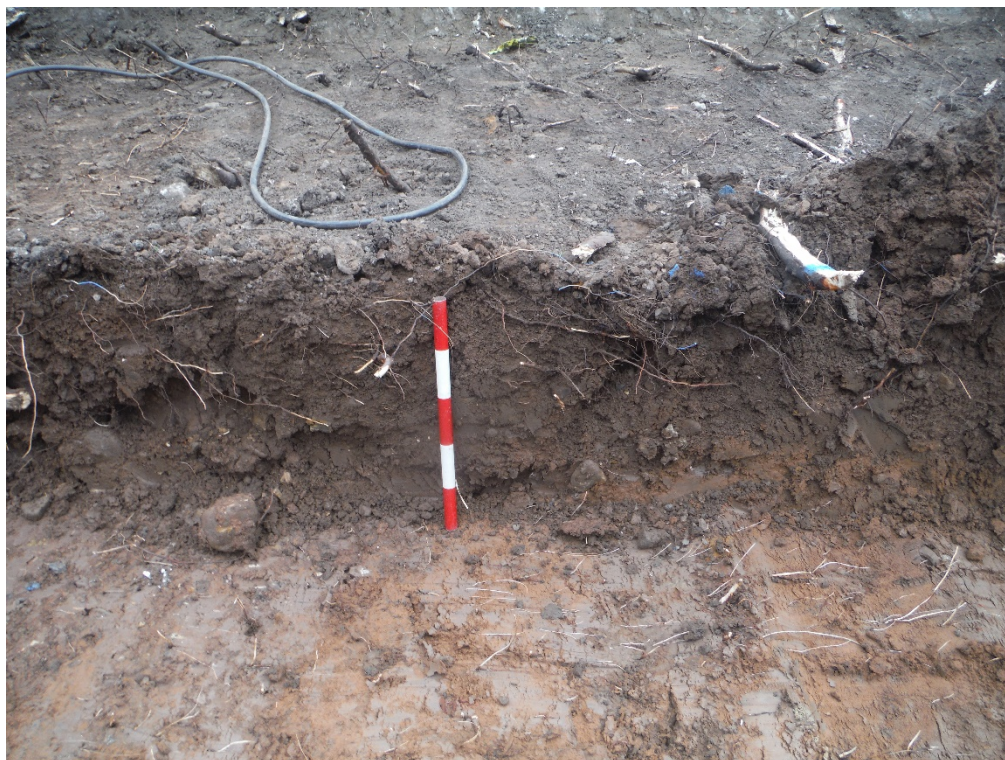
Plate 2 Section within footprint of building. Visible made ground and natural.