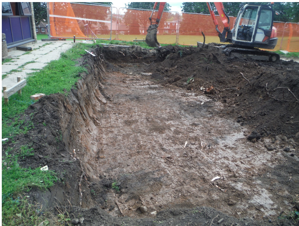
Plate 1 General view of site. Looking southeast