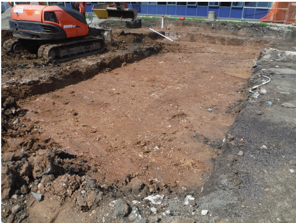
Plate 4 View of the southern extent of site with rubble demolition

This Report has been prepared solely for the person/party which commissioned it and for the specifically titled project or named part thereof referred to in the Report. The Report should not be relied upon or used for any other project by the commissioning person/party without first obtaining independent verification as to its suitability for such other project, and obtaining the prior written approval of York Archaeological Trust for Excavation & Research Limited ("YAT"). YAT accepts no responsibility or liability for the consequences of this Report being relied upon or used for any purpose other than the purpose for which it was specifically commissioned. Nobody is entitled to rely upon this Report other than the person/party which commissioned it. YAT accepts no responsibility or liability for any use of or reliance upon this Report by anybody other than the commissioning person/party.