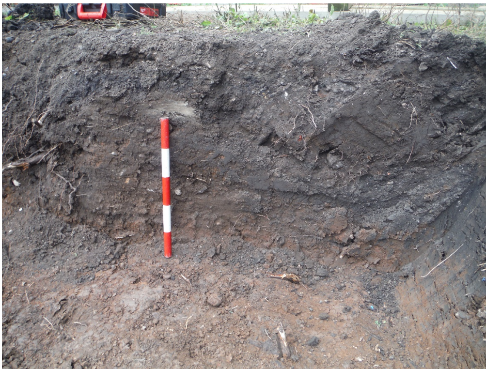
Plate 3 Section illustrating topsoil, subsoil and made ground at the northern extent of site.