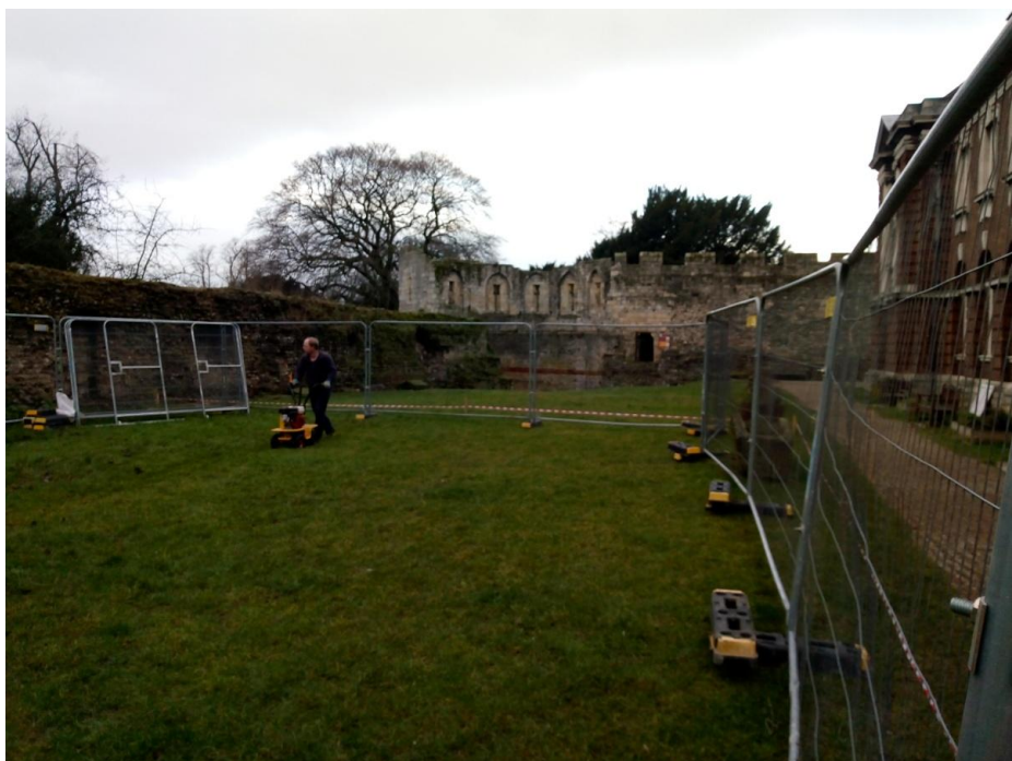
Plate 1 Area pre-excitation, facing north west