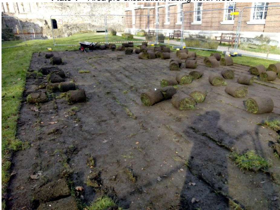
Plate 2 After removal of the turf, facing north east