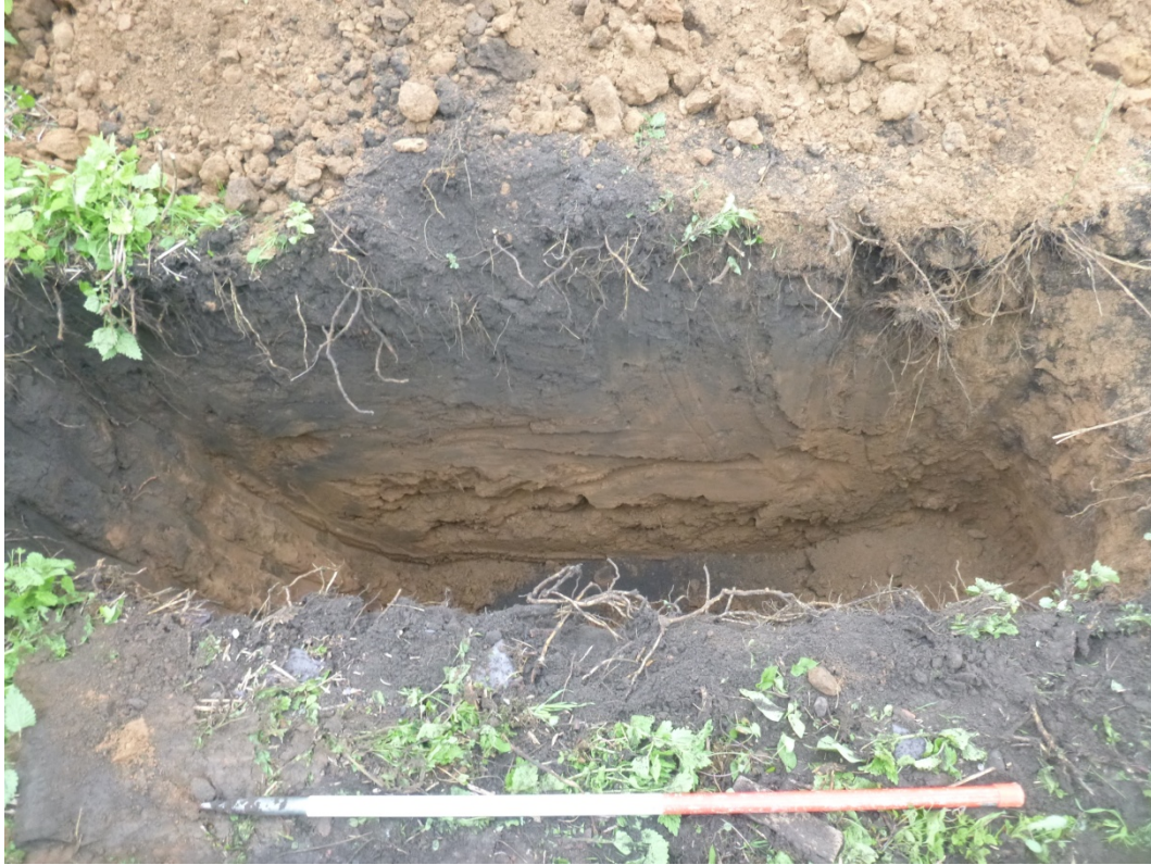
Plate 1. North-west facing view of Test Pit 6 (1.00m scale).