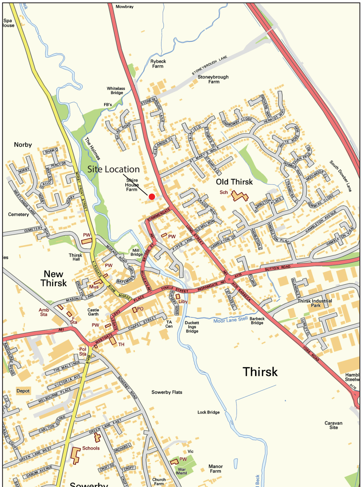
Figure 1 Site Location scale 1:10,000