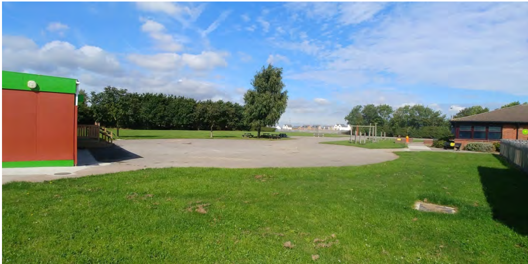
Plate 5 View northwest, showing school playground