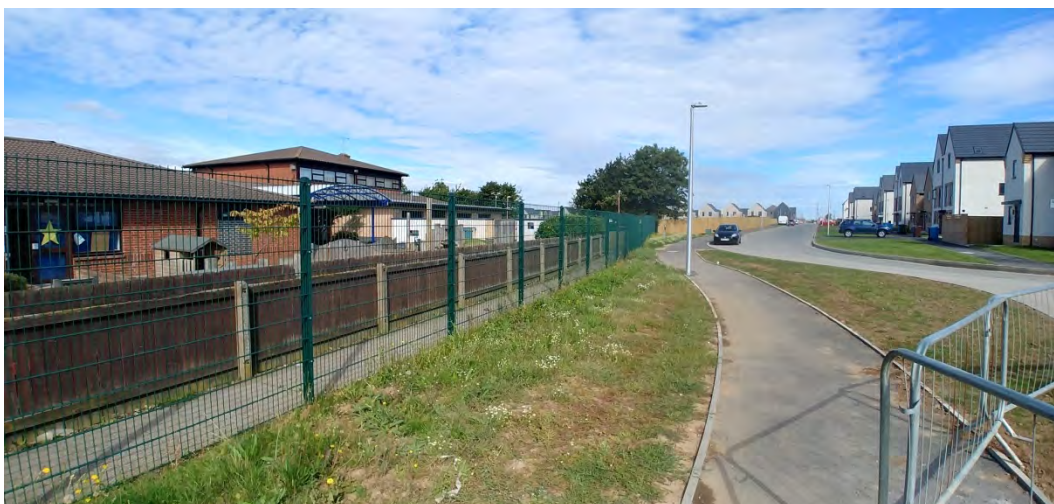
Plate 1 View east, setting of the study site to east, showing new road and housing