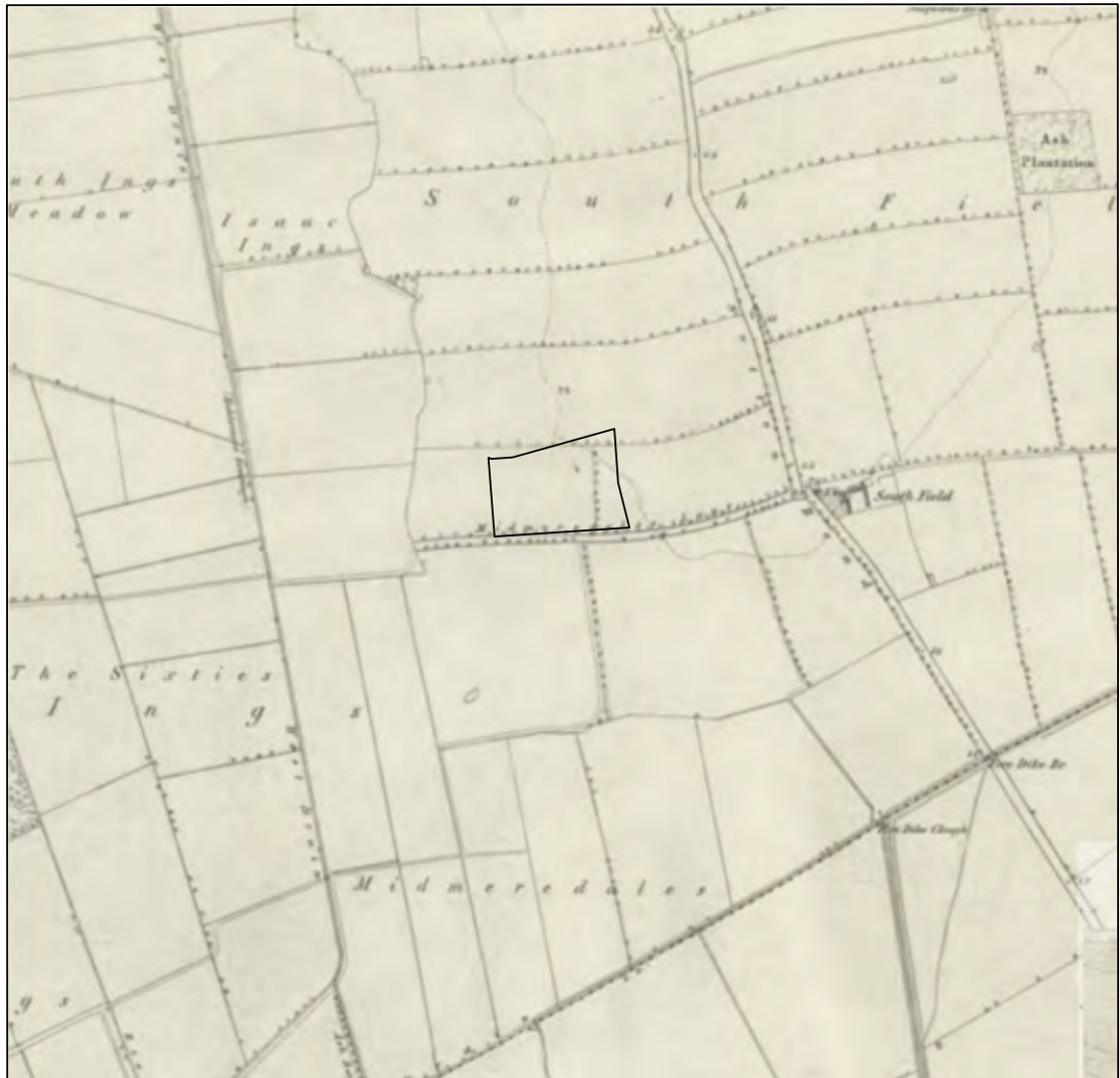
Figure 4 Extract from the 1855 OS 6" to 1 mile map. Not to Scale