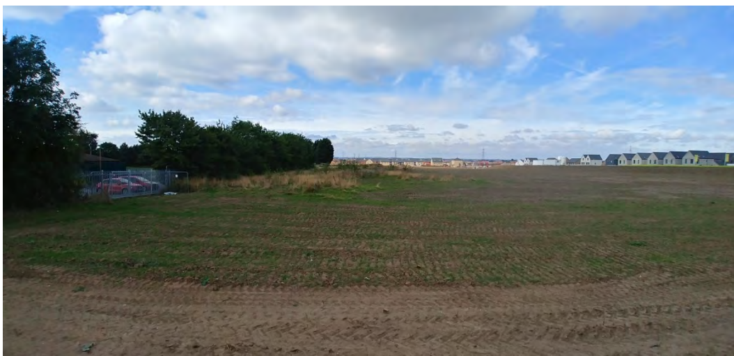
Plate 2 View west, northern area of site