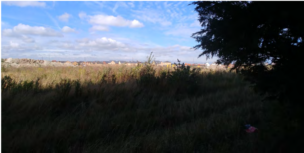
Plate 4 View northwest, showing area to west of site