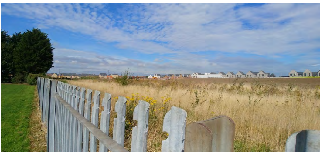
Plate 3 View northwest, northern area of site, showing earth bank and new houses to north