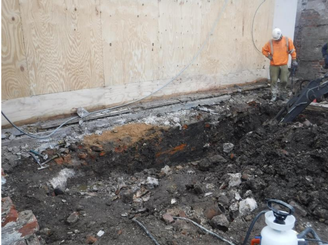
Plate 2 Buried wall exposed in NW facing side of trench excavated from new drain run, looking N