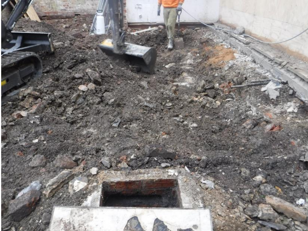
Plate 1 Clearance work exposing the existing inspection chamber and concrete encased drains, looking SW