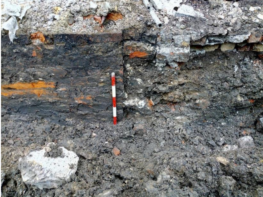
Plate 3 Detail of buried wall and loose material built up against it, viewed from the NE, 0.1m scale units