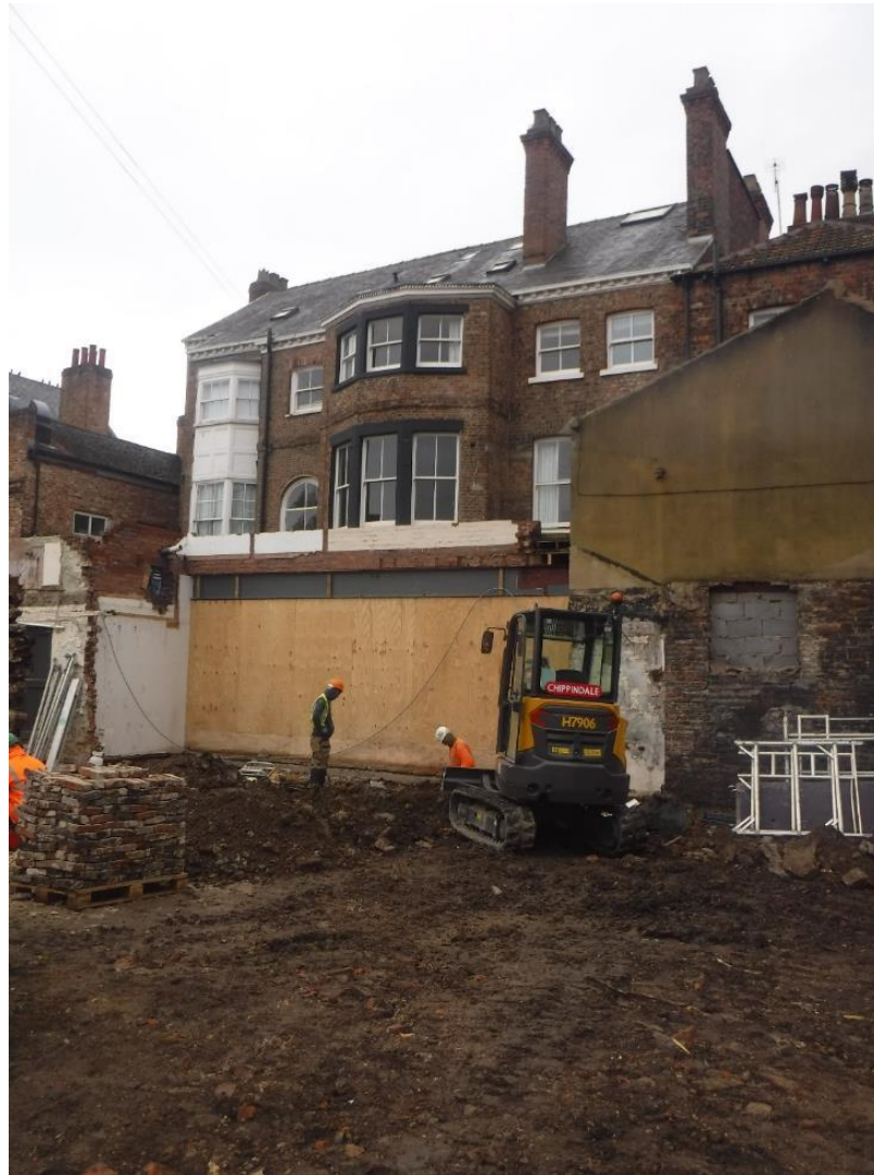
Plate 4 General view of Watching Brief at the rear of 27 Bootham area from the east

This Report has been prepared solely for the person/party which commissioned it and for the specifically titled project or named part thereof referred to in the Report. The Report should not be relied upon or used for any other project by the commissioning person/party without first obtaining independent verification as to its suitability for such other project, and obtaining the prior written approval of York Archaeological Trust for Excavation & Research Limited ("YAT"). YAT accepts no responsibility or liability for the consequences of this Report being relied upon or used for any purpose other than the purpose for which it was specifically commissioned. Nobody is entitled to rely upon this Report other than the person/party which commissioned it. YAT accepts no responsibility or liability for any use of or reliance upon this Report by anybody other than the commissioning person/party.