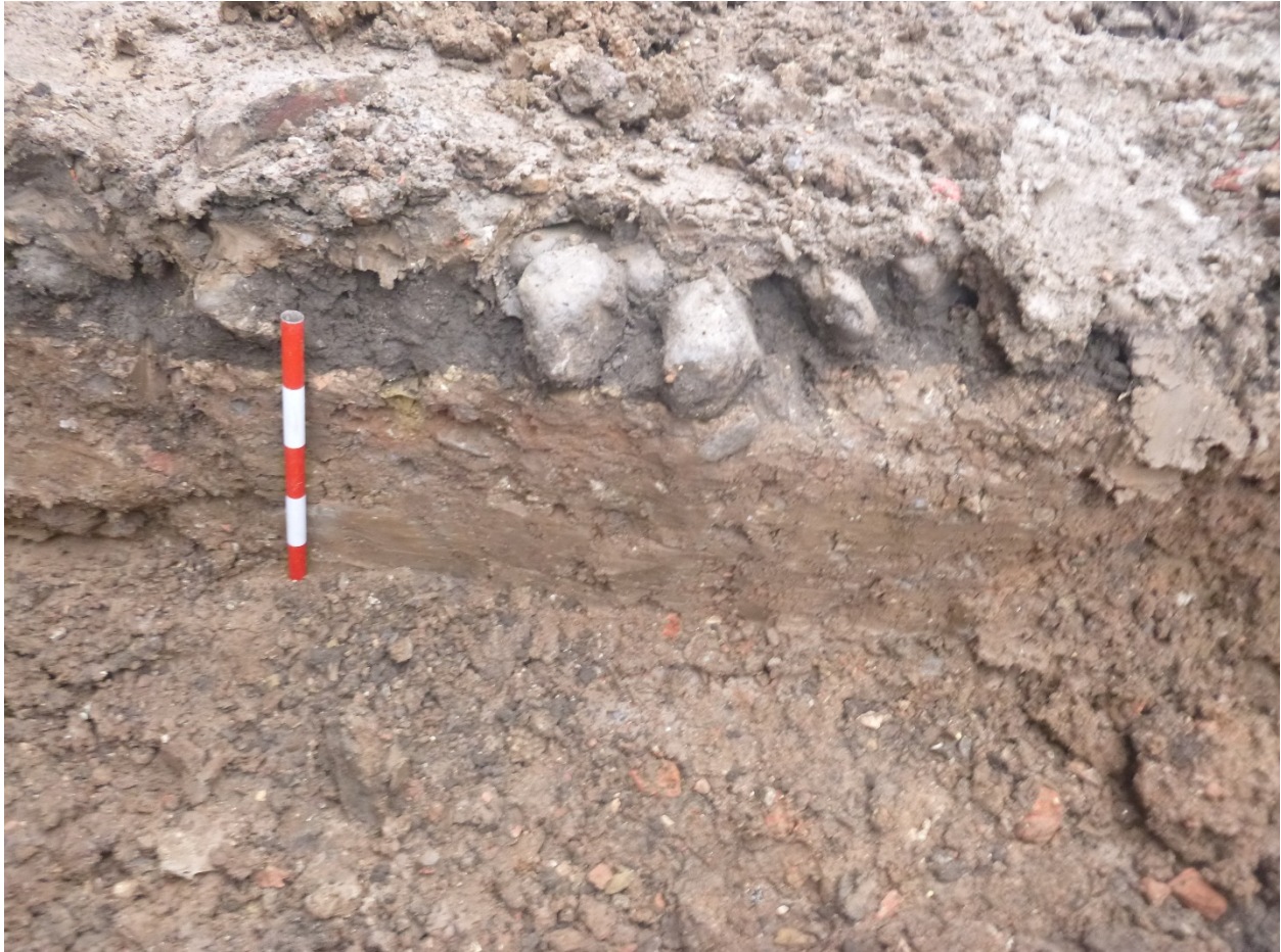
Plate 2 South-west facing representative section showing floor make-up and cobble surface. Scale unit 100mm.

This Report has been prepared solely for the person/party which commissioned it and for the specifically titled project or named part thereof referred to in the Report. The Report should not be relied upon or used for any other project by the commissioning person/party without first obtaining independent verification as to its suitability for such other project, and obtaining the prior written approval of York Archaeological Trust for Excavation & Research Limited ("YAT"). YAT accepts no responsibility or liability for the consequences of this Report being relied upon or used for any purpose other than the purpose for which it was specifically commissioned. Nobody is entitled to rely upon this Report other than the person/party which commissioned it. YAT accepts no responsibility or liability for any use of or reliance upon this Report by anybody other than the commissioning person/party.