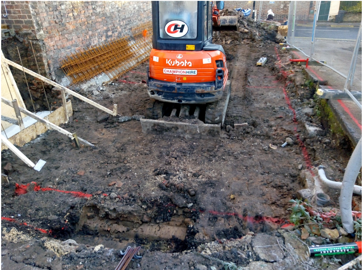
Plate 1 Site Location. Looking north-east.