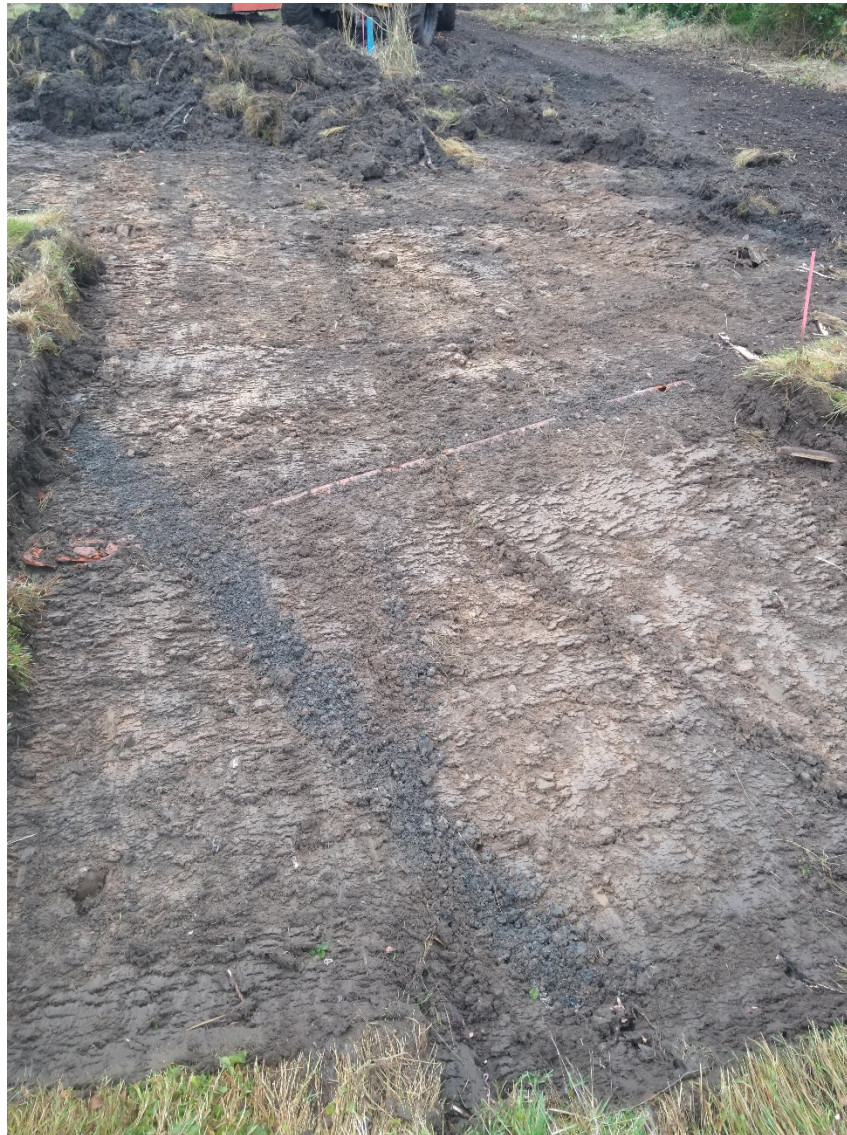
Plate 4 Closer view of natural geology just below topsoil (250mm- 400mm BGL).

This Report has been prepared solely for the person/party which commissioned it and for the specifically titled project or named part thereof referred to in the Report. The Report should not be relied upon or used for any other project by the commissioning person/party without first obtaining independent verification as to its suitability for such other project, and obtaining the prior written approval of York Archaeological Trust for Excavation & Research Limited ("YAT"). YAT accepts no responsibility or liability for the consequences of this Report being relied upon or used for any purpose other than the purpose for which it was specifically commissioned. Nobody is entitled to rely upon this Report other than the person/party which commissioned it. YAT accepts no responsibility or liability for any use of or reliance upon this Report by anybody other than the commissioning person/party.