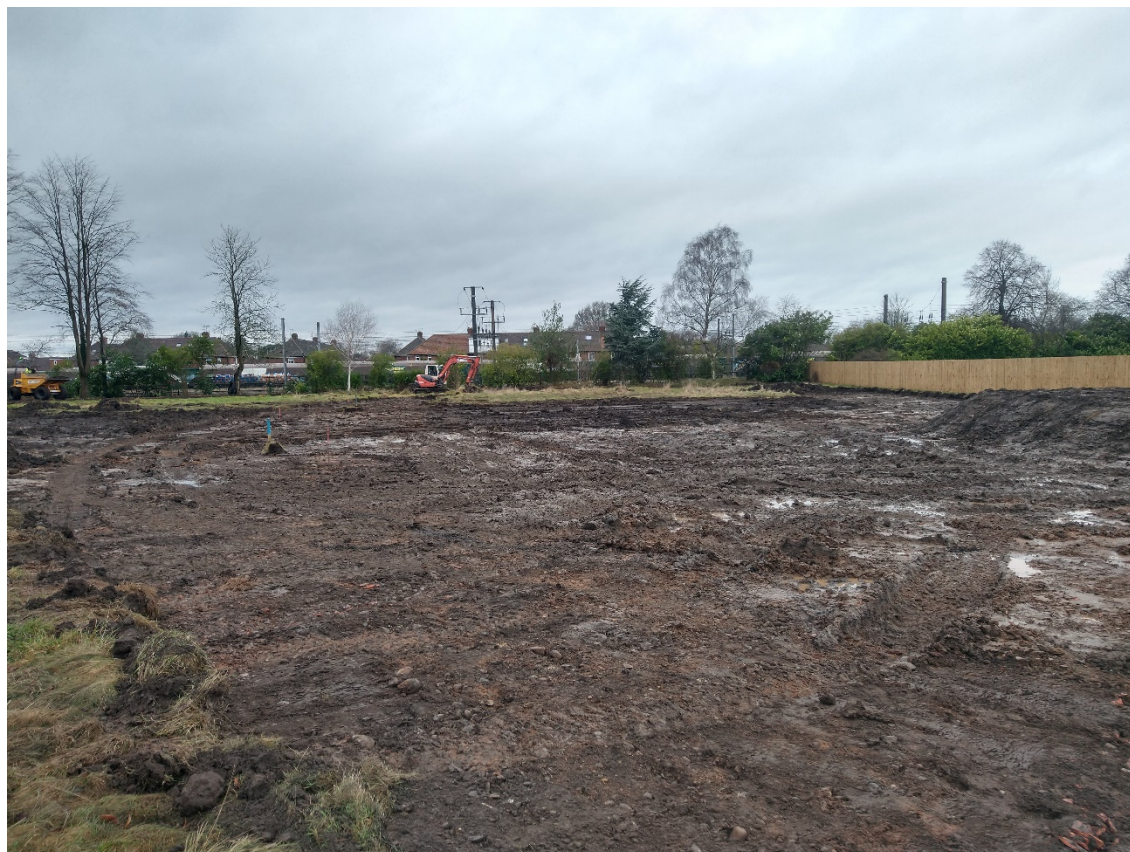
Plate 1 View of stripped are looking north west.