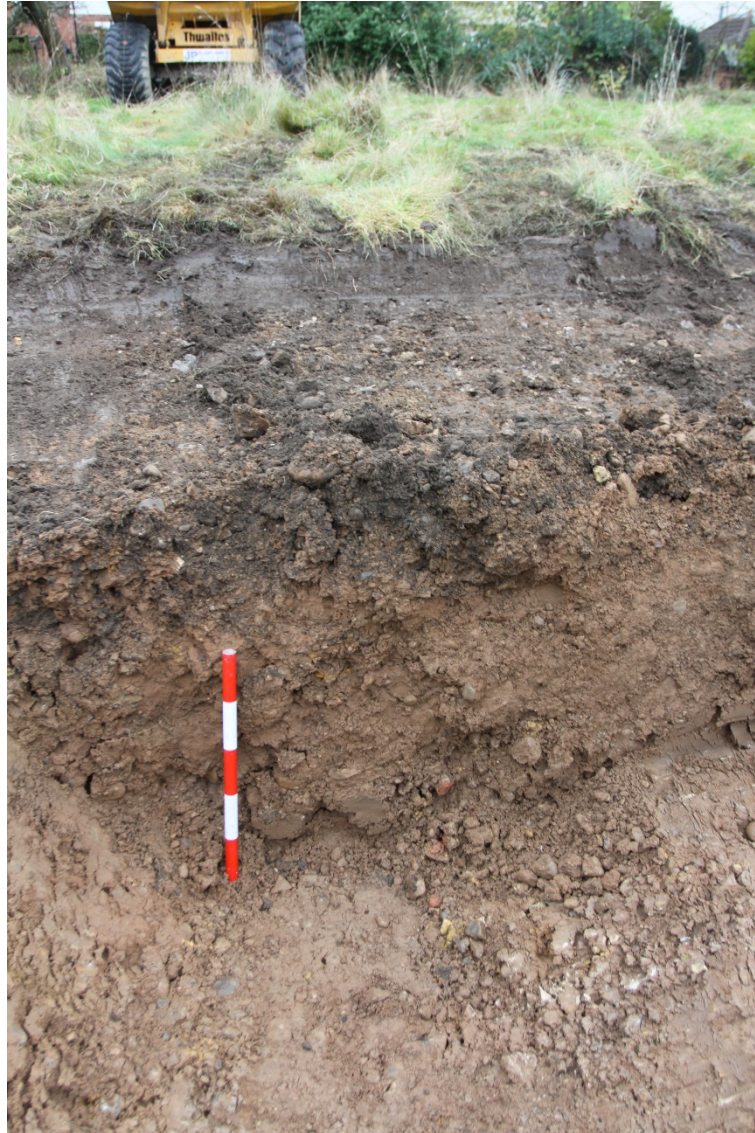
Plate 2 View of sondage into natural geological deposits.