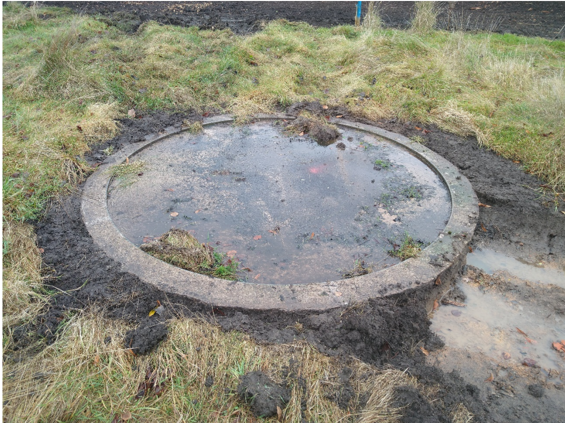
Plate 3 Shot putt platform at north west side of site.