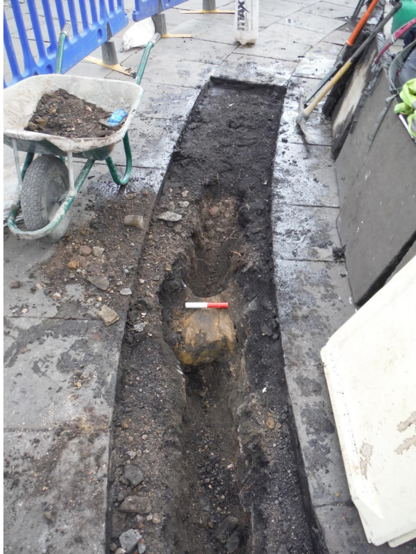
Plate 2 North-east facing view of part of a sandstone wall built on top of 19 th -century brick and tile fragments. Scale 20cm