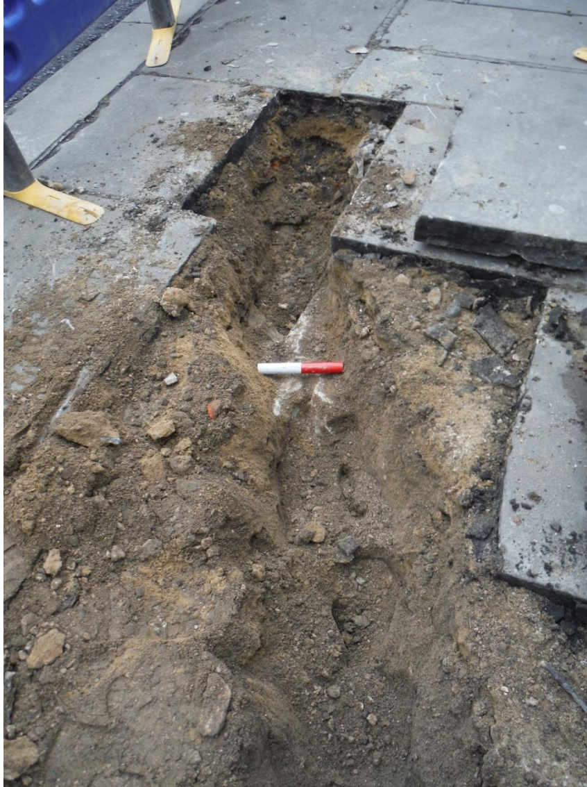
Plate 4 South-west facing view of limestone wall. Scale 20cm