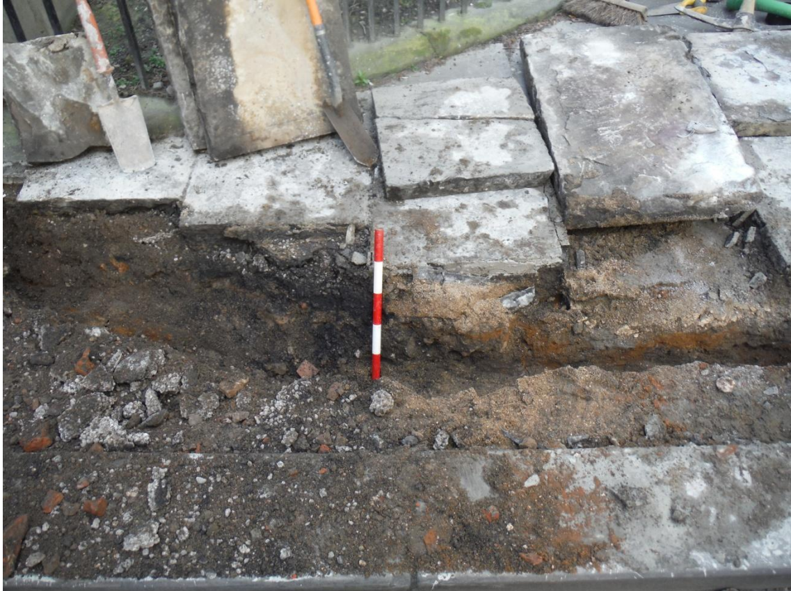
Plate 6 South-east view of cable trench section at the Jackson-Stops end of the service trench showing the end of the sandy bedding material, and the re-emergence of the dark mixed demolition/construction deposit seen at the other end of the trench (Plate 1). Scale 50cm.

This Report has been prepared solely for the person/party which commissioned it and for the specifically titled project or named part thereof referred to in the Report. The Report should not be relied upon or used for any other project by the commissioning person/party without first obtaining independent verification as to its suitability for such other project, and obtaining the prior written approval of York Archaeological Trust for Excavation & Research Limited ("YAT"). YAT accepts no responsibility or liability for the consequences of this Report being relied upon or used for any purpose other than the purpose for which it was specifically commissioned. Nobody is entitled to rely upon this Report other than the person/party which commissioned it. YAT accepts no responsibility or liability for any use of or reliance upon this Report by anybody other than the commissioning person/party.