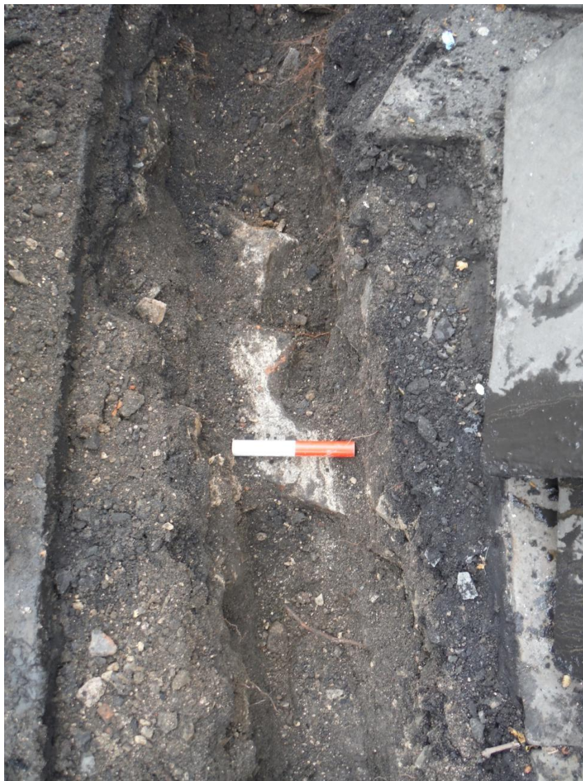
Plate 3 East facing view of brick, concrete and limestone wall. Scale 20cm