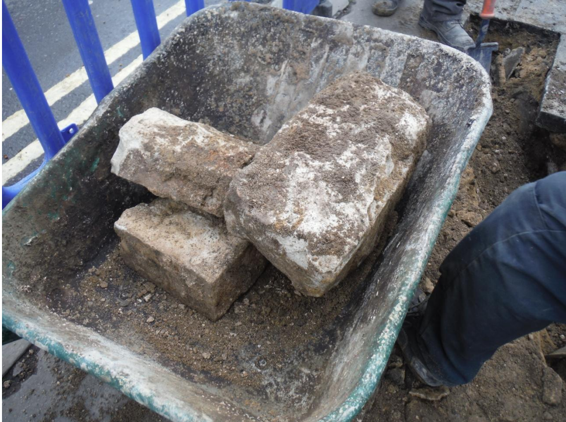
Plate 5 Detail shot of three roughly shaped limestone fragments from wall in cable trench