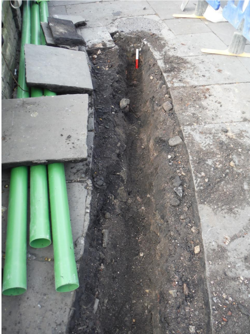
Plate 1 South-west facing view of the cinder bedding and 19 th -century mixed demolition/construction deposit. Scale 20cm.