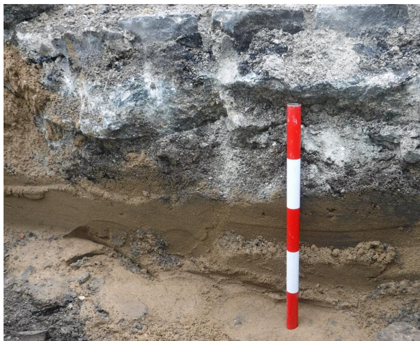
Plate 1: Section photo looking East