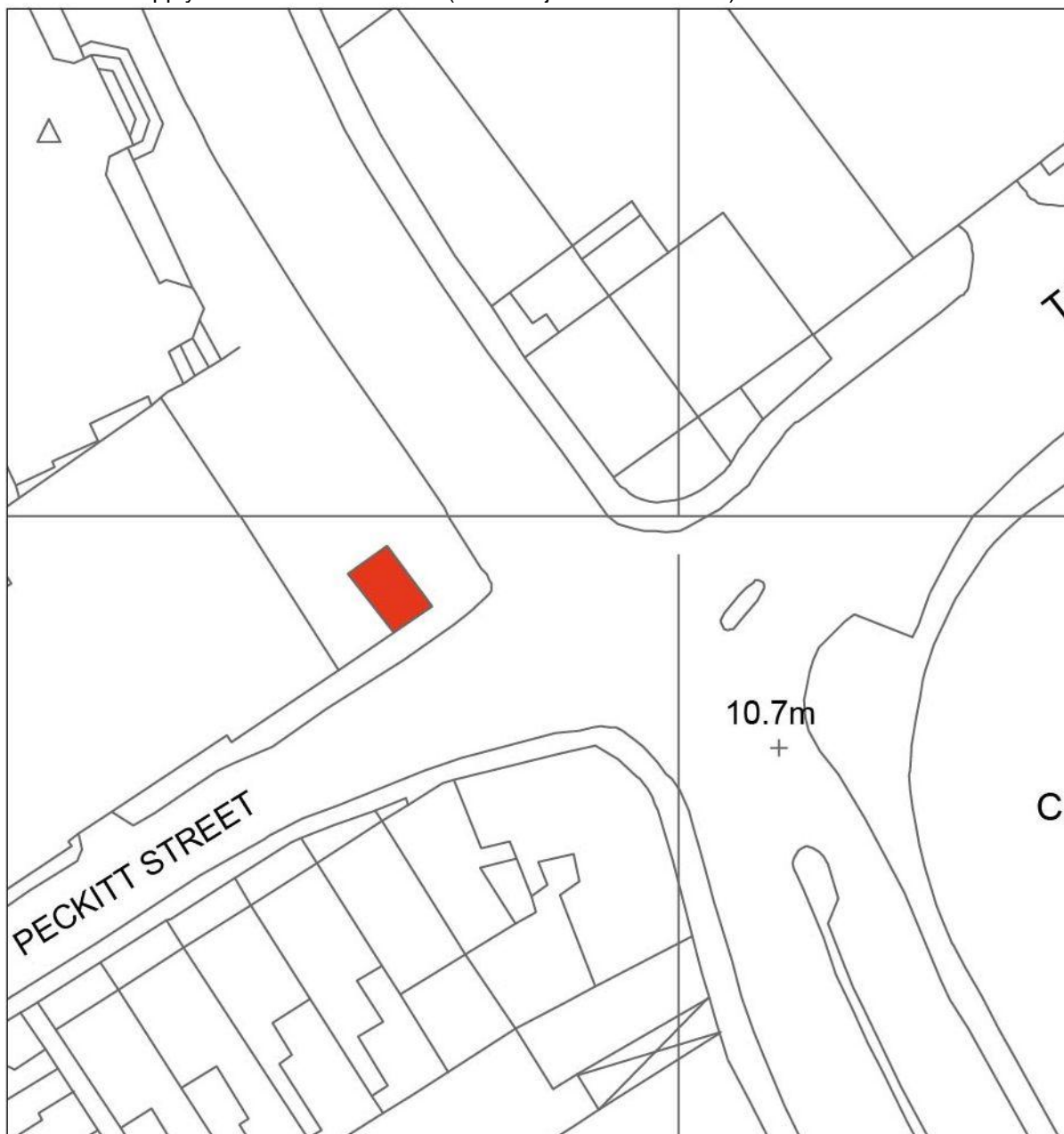
Figure1: Site location, scale1:500

On the 23/10/17 York Archaeological Trust (YAT) undertook a watching brief under an Area of Archaeological Importance Operations Notice (AAI OPS) on the footpath outside the Former Fire Station, Clifford Street, York, YO1 9RJ, SE 603515 (Figure 1). The work involved the installation of a temporary site electrical supply to the construction site (YAT Project number 5905).