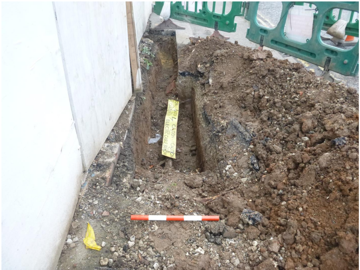
Plate 3 Excavated trench 0.5m scale, looking south-east

This Report has been prepared solely for the person/party which commissioned it and for the specifically titled project or named part thereof referred to in the Report. The Report should not be relied upon or used for any other project by the commissioning