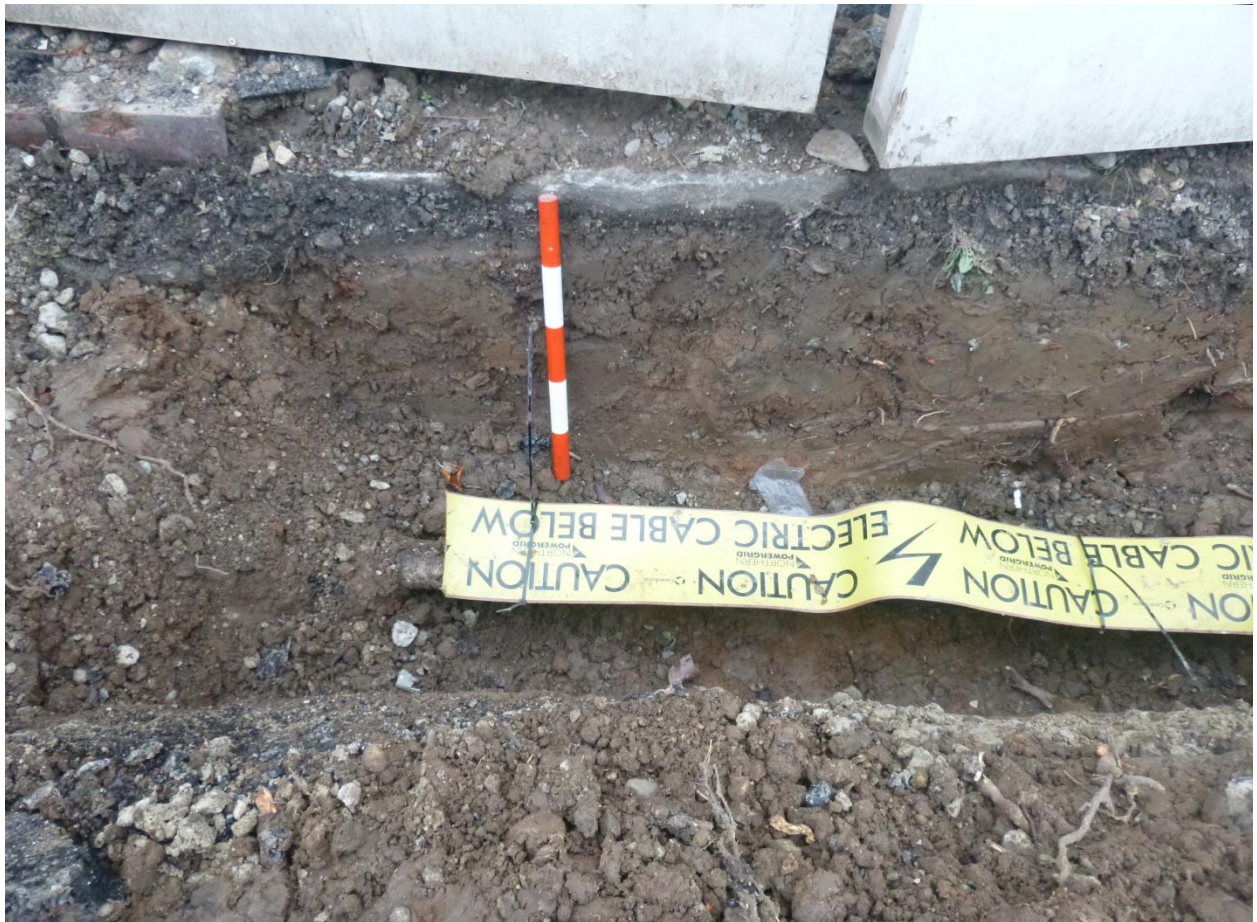
Plate 2 Section with 0.5m scale, looking north-east