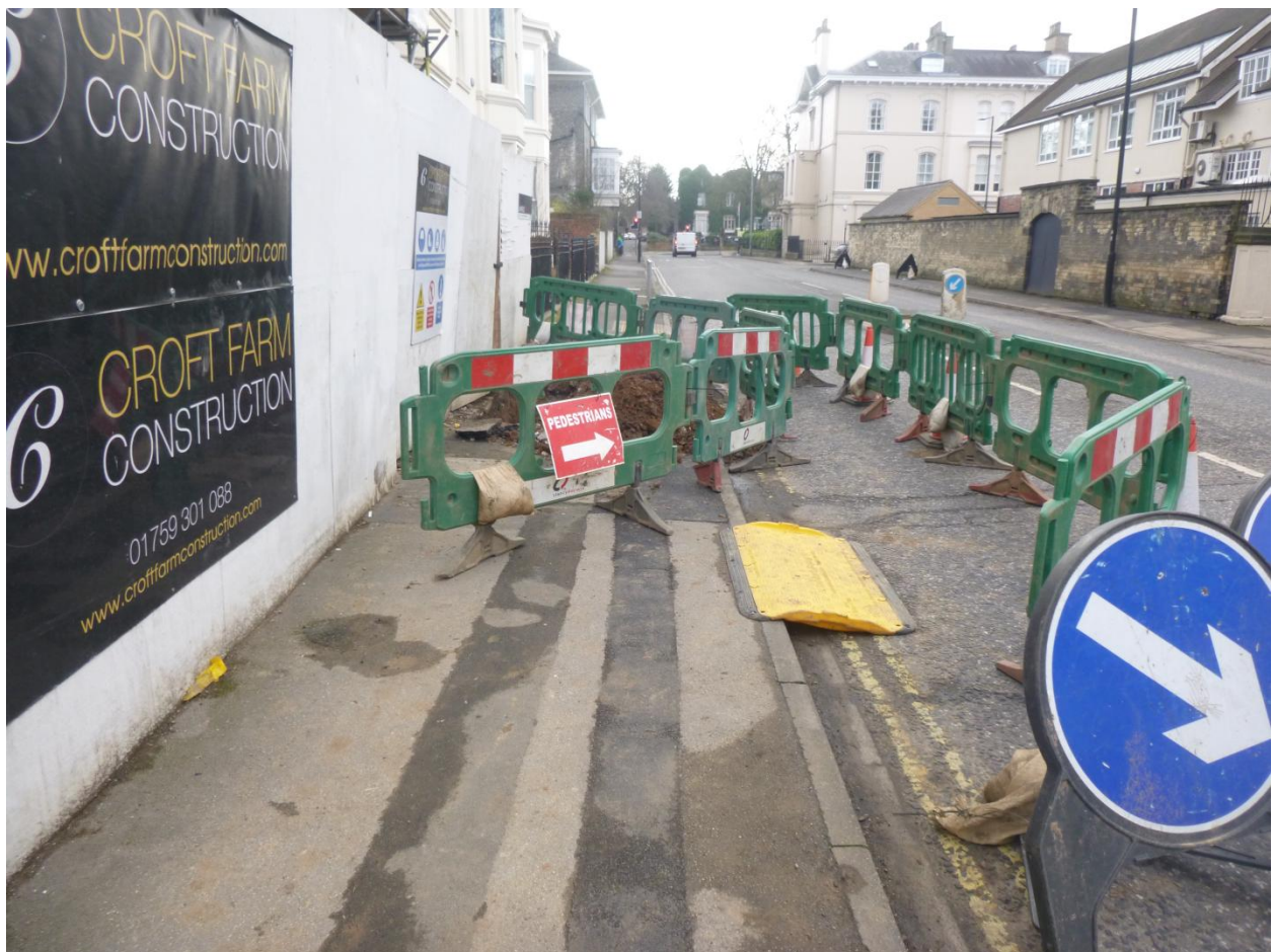
Plate 1 Dalton Terrace, looking south-east