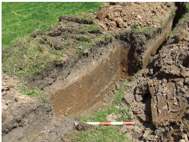
Plate 4 A typical cross-section of the observed deposits