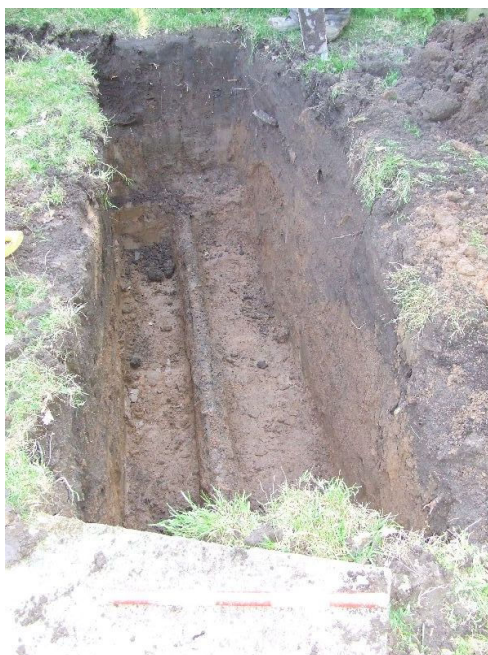
Plate 1 The electricity cable in the south-westernmost pit

Nothing of archaeological interest was observed in the trench; on the basis of this the decision was taken not to observe the excavation of a third pit at the south-eastern end of the cable trench.