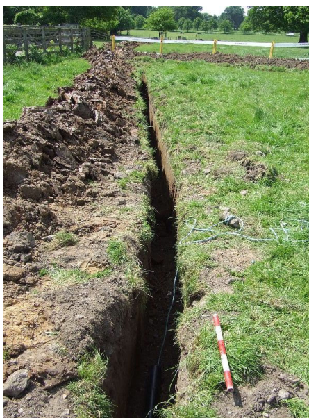
Plate 5 The north-north-west to south-south-east aligned portion of the trench