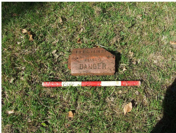
Plate 2 A ceramic plate that capped the existing electricity cable