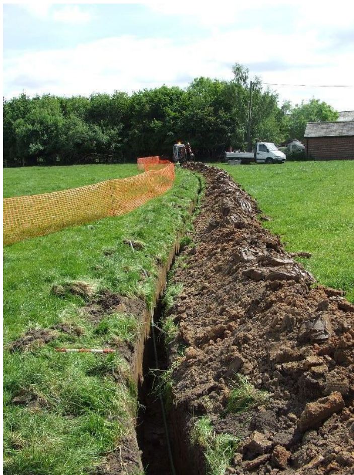
Plate 6 The north-west to south-east aligned portion of the trench