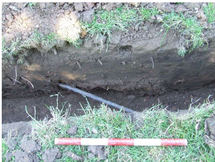
Plate 3 A modern service pipe in the north-north-west to south-south-east aligned portion of the trench