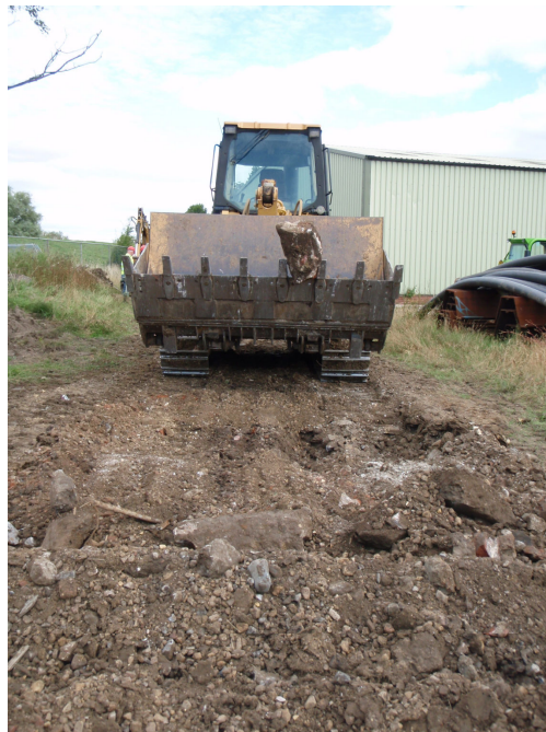
Plate 4 Stripping of the pond area