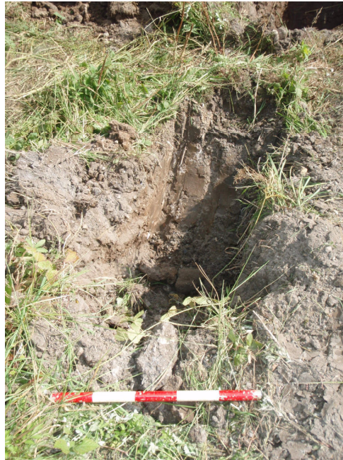
Plate 3 The south-eastern most fencing post hole (Scale unit 0.1m)