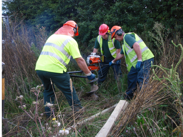
Plate 1 Augering the fence post holes