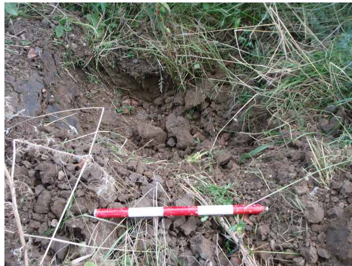
Plate 2 Material in the north-eastern most fencing post hole (Scale unit 0.1m)