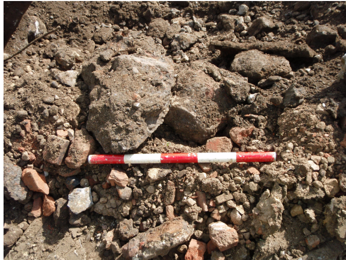
Plate 5 Modern concrete rubble in the pond area (Scale unit 0.1m)