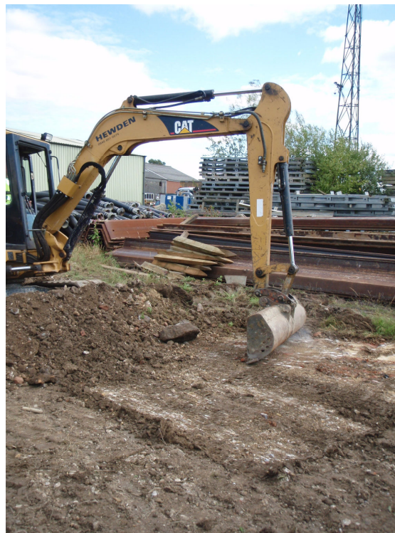
Plate 6 Stripping of the pond area