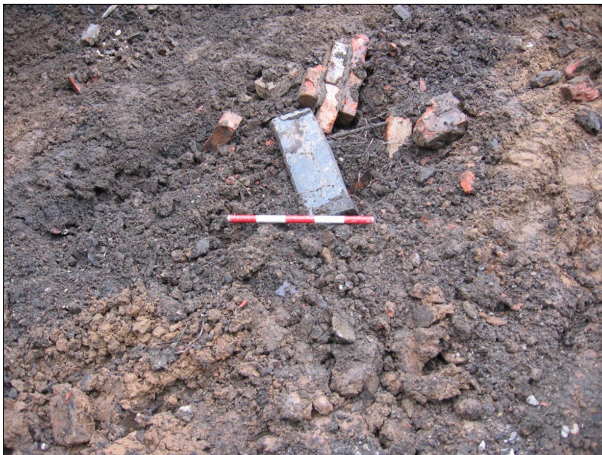
Plate 4 Modern drains in ramp excavation, looking south

During these works no finds were recovered. Due to a redesign of the construction of the new car parking area the only area where it was considered likely that any significant archaeology might be encountered was towards the base of the new ramp but examination of this area when exposed revealed that modern drains had removed most of any archaeology that may have been present. No features were observed here or elsewhere and the overall strip did not fully penetrate clearly modern deposits. A small amount of the medieval agricultural soil was removed during the excavation of the ramp but other than this it is not believed that archaeological deposits or features of any great significance were disturbed and features such as those recorded in the evaluation remain buried below the new car park.