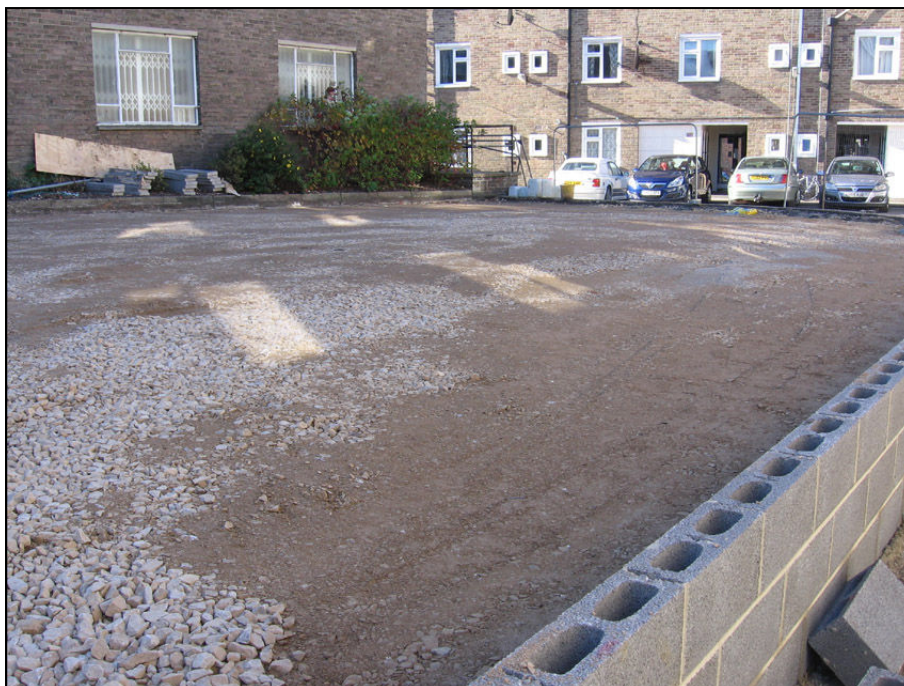
Plate 3 West and central parts of site after stoning up, looking west