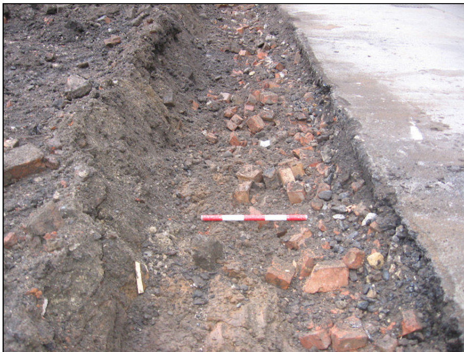
Plate 2 Base of new retaining wall trench, looking west