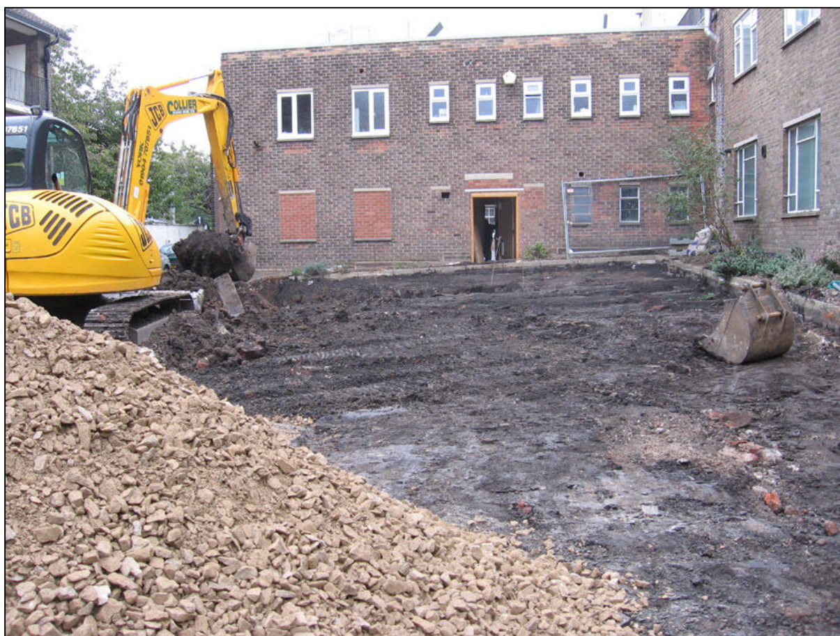
Plate 1 Site after overall strip, looking east

A section was recorded along the eastern end of the north-west facing part of the new access ramp. Here the earliest deposit recorded, at 0.8m and lower, was a mid orange-brown clayey sand (3008) which was believed to be natural and equivalent to Contexts 1014 and 2022 in the evaluation. Overlying it was a 0.2m deep mixture of mid brownish-grey clayey silt and mid orange slightly clayey sand (3009). This was probably equivalent to Context 2021 in the evaluation. Sealing this was a 0.25m deep layer of mid brownish-grey clayey silt (3010) probably to be equated with Contexts 1003 and 2003 in the evaluation. Overlying this was a 0.1m deep deposit of dark grey slightly clayey silt with frequent brick / tile and occasional mid brown sand also broadly equivalent to Contexts 1003 and 2003. Sealing it was a 0.15m deep deposit of cinders (3011) partly equivalent to Context 1002 and 2002). Above this was a 0.05m deep layer of pale grey cement (3012), also partly equivalent to Contexts 1002 and 2002, and this formed the bedding for the modern surface of concrete slabs (3013) seen elsewhere as Contexts 1001, 2001 and 3003.