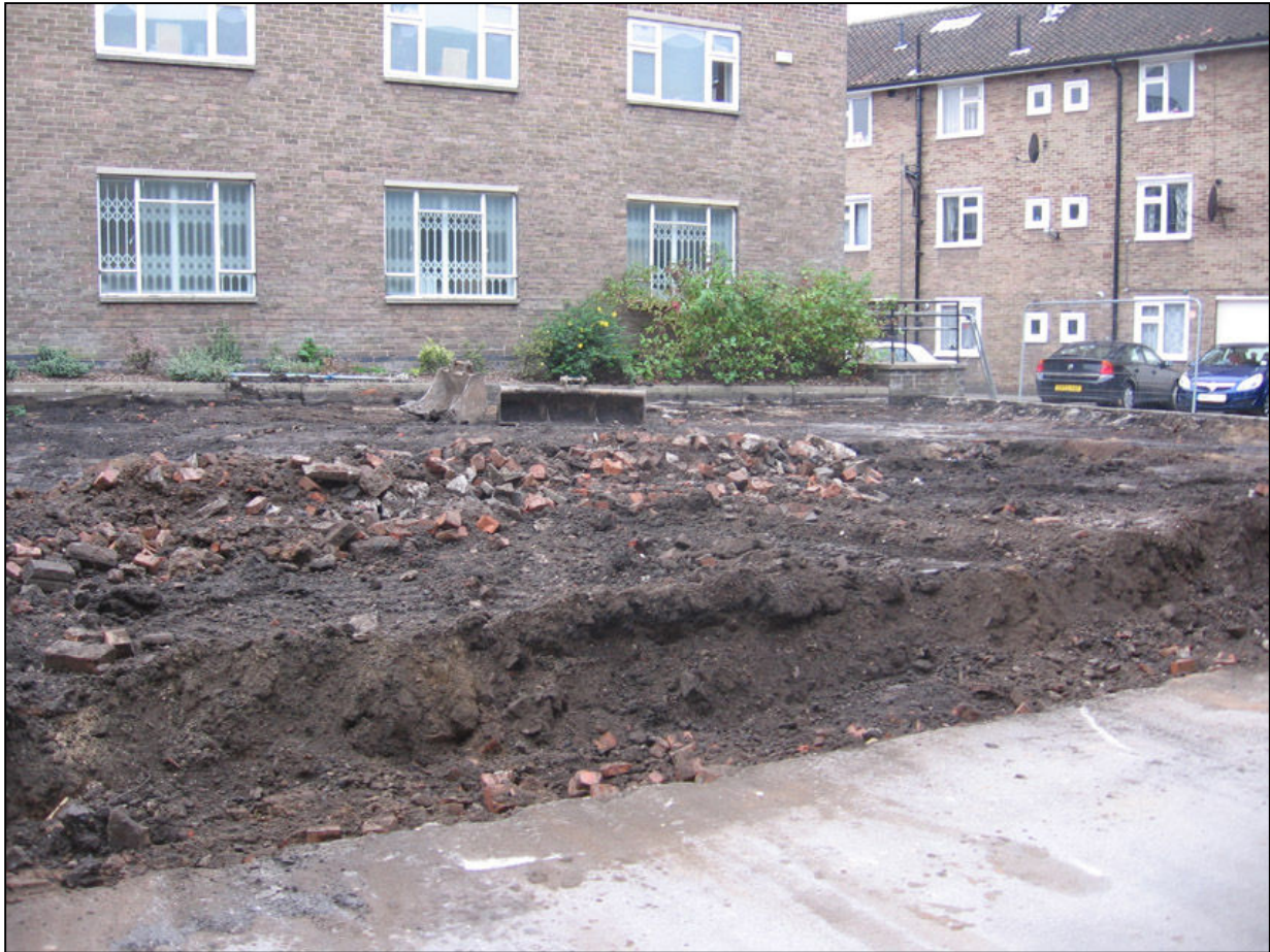
Plate 7 West end of site after overall strip, looking south-west