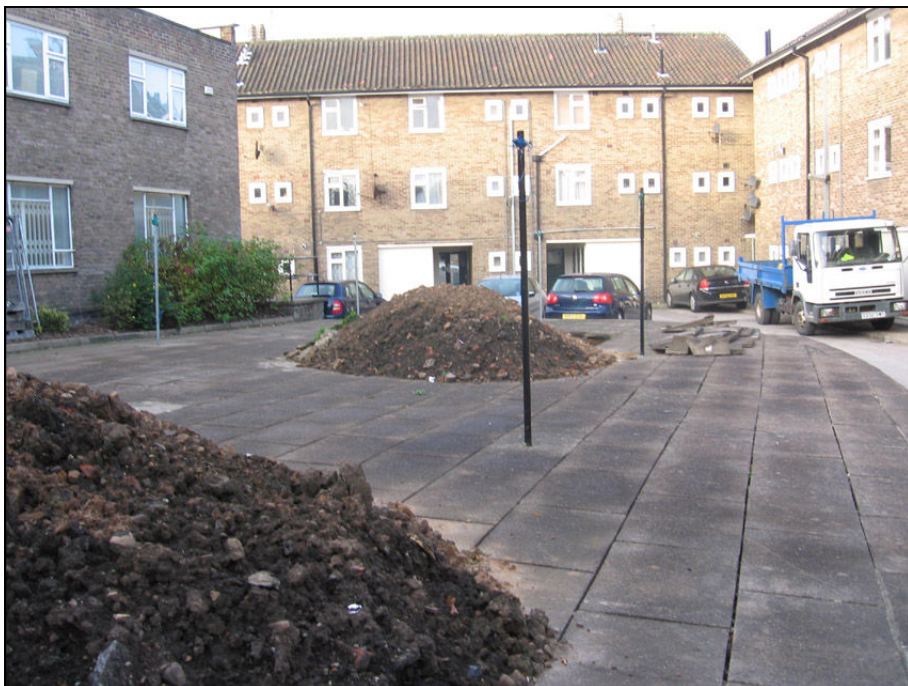
General view of site prior to the works, looking west