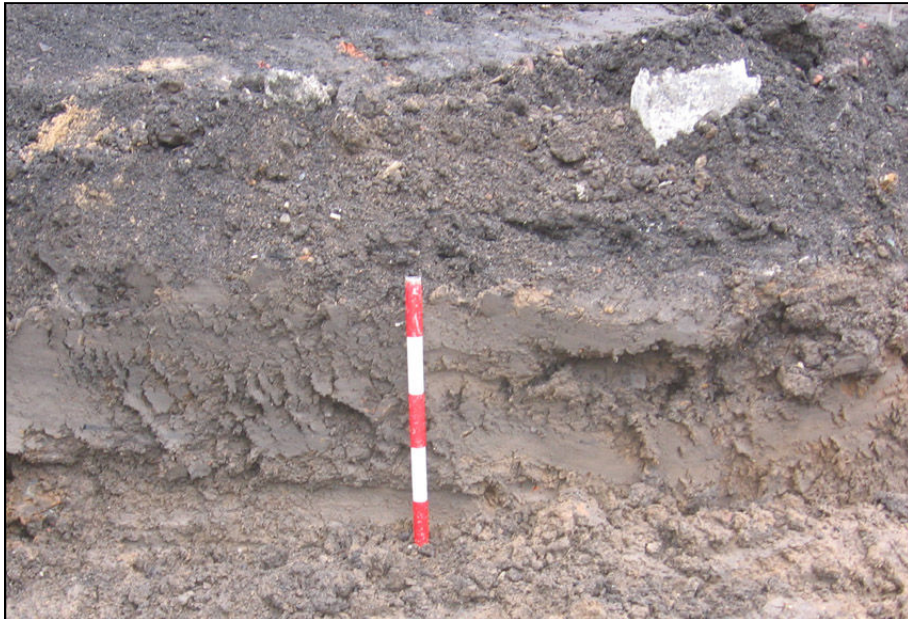
Plate 5 Detail of section along ramp excavation, looking south-east