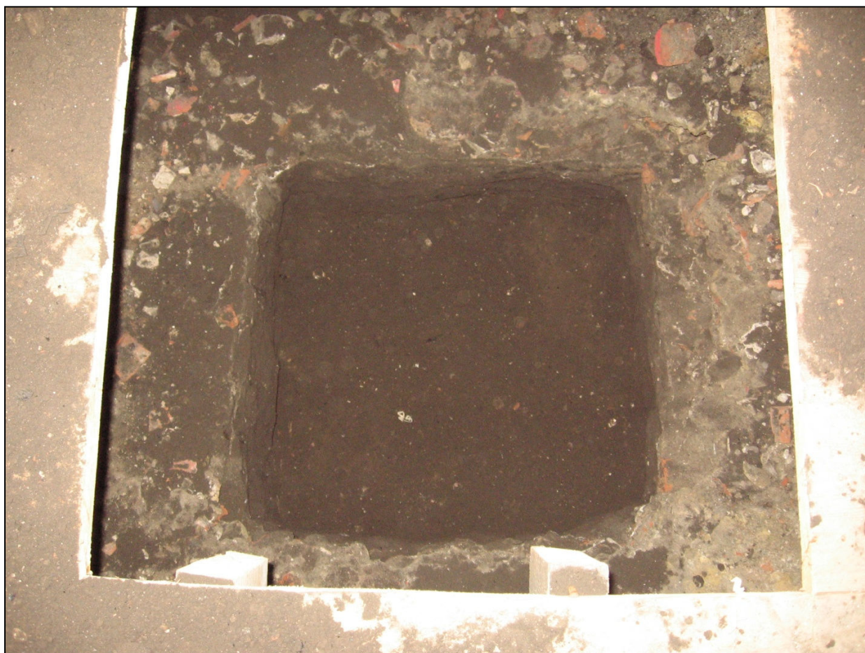
Plate 1 Foundation Pit 13, looking north-west

All of the deposits encountered in the new drain run and foundation trench were clearly modern and disturbed and were not recorded in detail. No datable finds were recovered from any of the foundation pits so dating of the contexts seen remains uncertain, although Context 1002 is likely to be directly associated with the construction of the hall and thus no earlier than the 19 th century. Context 1001 is probably a disturbed version of Context 1000 which appears to be a medieval / post-medieval graveyard soil containing moderate quantities of disarticulated human bone. This bone was gathered together and reburied once all the foundation pits had been dug. Overall it appears that little significant disturbance to the archaeology has taken place.