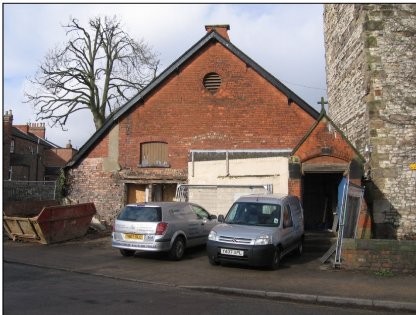
Plate 3 The south-east end of the church hall, looking north-west