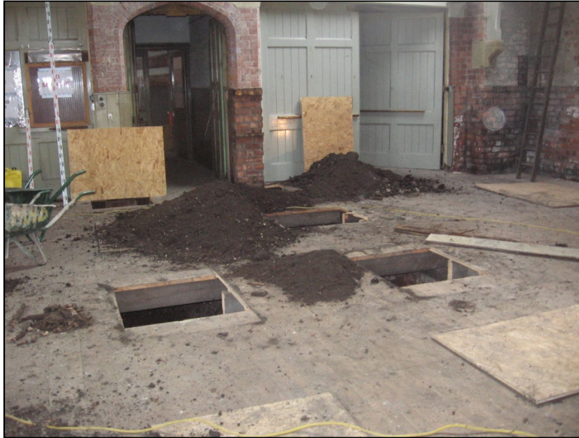
Plate 2 Foundation Pits 1-6 during excavation, looking south-east