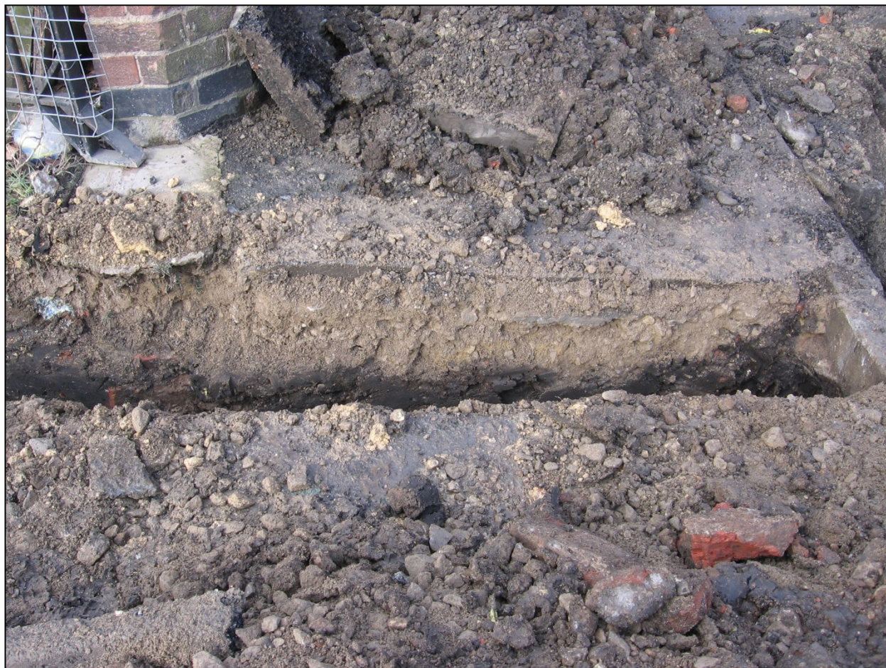
Plate 1 Trench at location of Section 2, looking north-west

The majority of the deposits recorded from the trenches were clearly modern but Contexts 1000 and 1002 may have been slightly disturbed build-up deposits. No dating evidence was recovered for these deposits but previous work in the immediate vicinity has shown that similar deposits can be dated to the broadly medieval period. The cobbles, 1006, seen in Section 3 almost certainly represent a previous road surface of uncertain, but possibly 19 th century, date. Overall it is believed that no archaeological remains of any great significance were disturbed during these works.