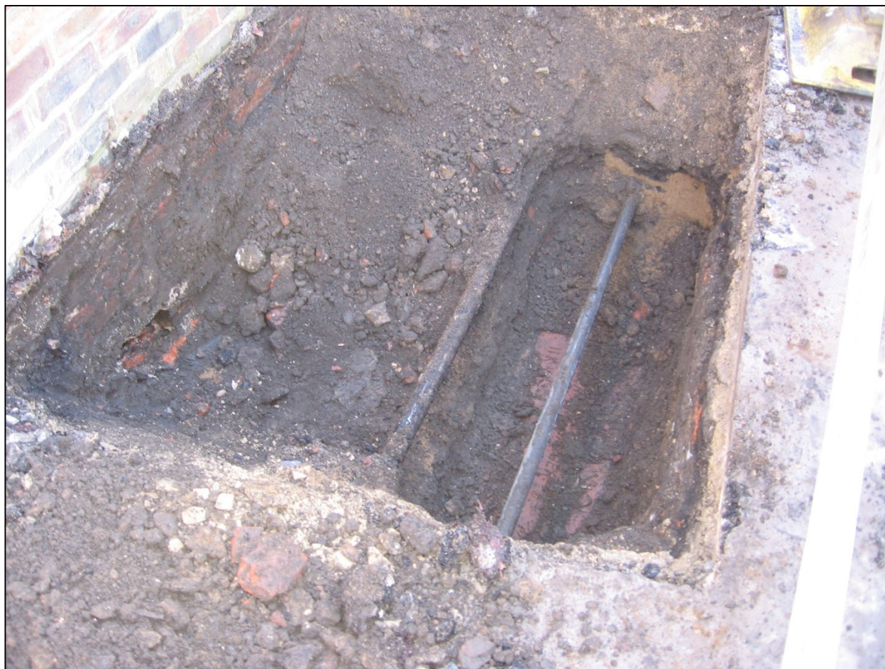
Plate 2 Trench in back alley, looking north