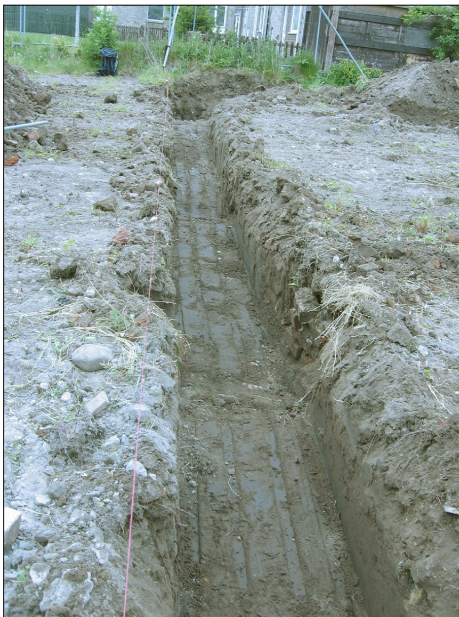
Plate 2 Exploratory trench, looking north-east