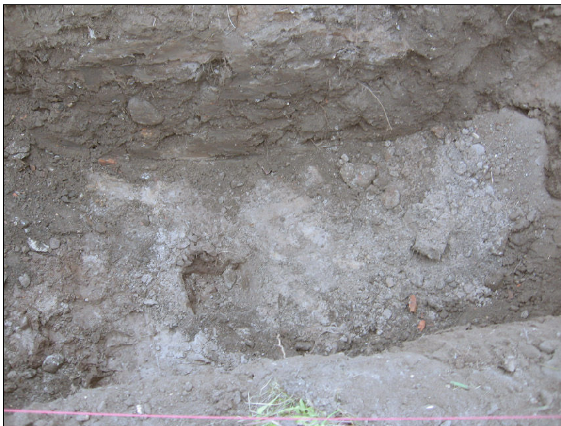
Plate 1 Natural sand and modern dumping in Section 1