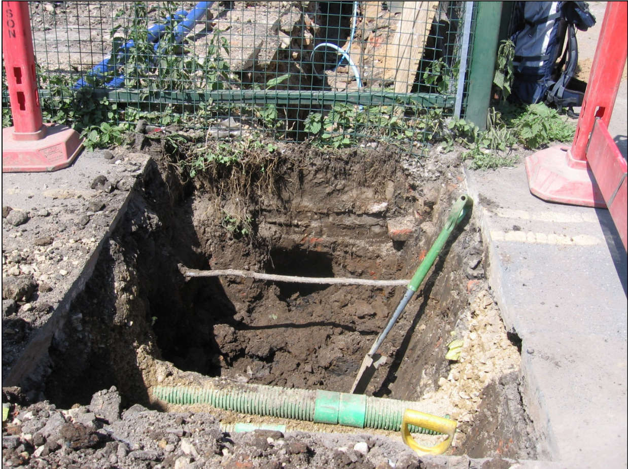
Plate 1 The trench, looking north-west

Although the majority of the deposits recorded from this trench were clearly modern the cleanness and location of Context 1000 may indicate that it was a deposit of some archaeological significance, possibly a build-up deposit. All contexts above it were at least relatively modern although the cobbled road surface, Context 1003, below the existing tarmac road surface might be of 19 th century origin. No archaeological remains were disturbed during these works.