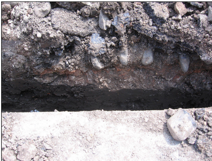
Plate 2 Deposits and cobbled road surface in vicinity of Section 3, looking west

In the fourth and final section, the earliest recorded deposit, seen between 0.5m and 0.8m BGL, was a mid brown clay with occasional pebbles (1015) which may have been natural. Sealing it was a 0.1m deep possible build-up deposit of mid greyish-brown silt with moderate brick / tile (1016). This was sealed by a 0.3m deep layer of concrete (1017) which formed the bedding for the modern tarmac road surface (1018).