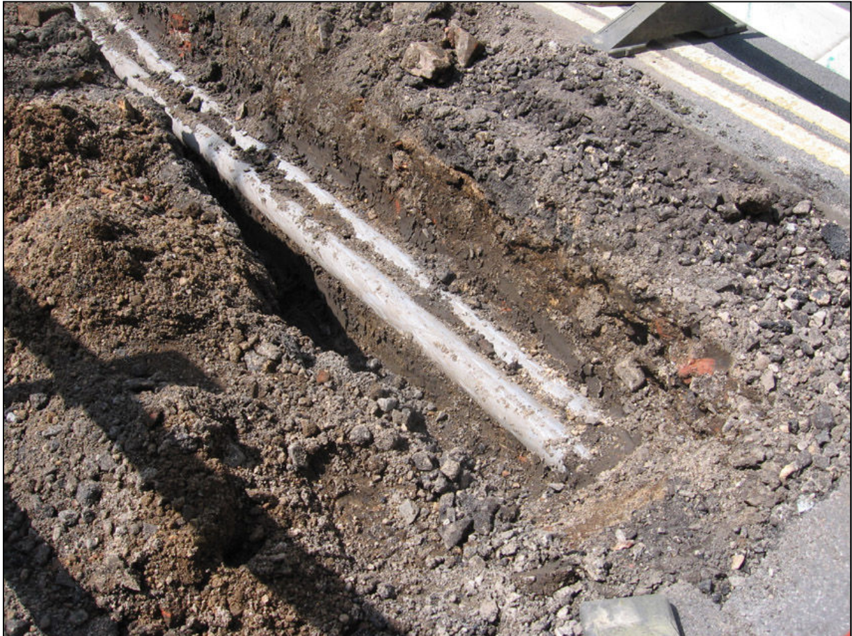
Plate 1 Modern and earlier deposits in vicinity of Section 1, looking south-west

In the second section the lowest deposit noted, between 0.35m and at least 0.8m BGL, was a possible build-up deposit of dark greyish-brown slightly sandy silt with occasional charcoal (1006). Overlying it was a 0.15m deep horizontal band of cobbles in dark grey silt (1007), probably an earlier road surface. It was sealed by a layer of tarmac pieces (1008), a levelling deposit for the modern road surface of tarmac (1009).