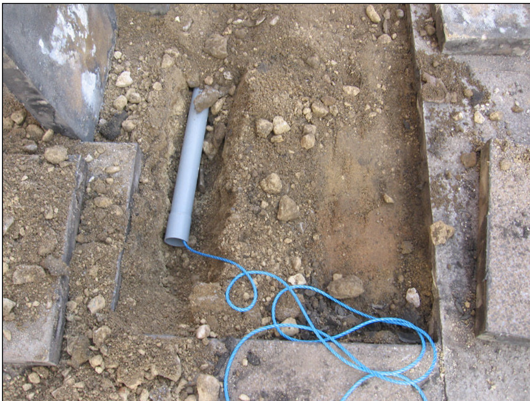
Plate 1 The duct trench, looking south-east