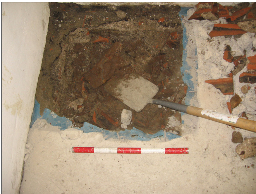
Plate 2 Section 2 trench during excavation, looking north-east