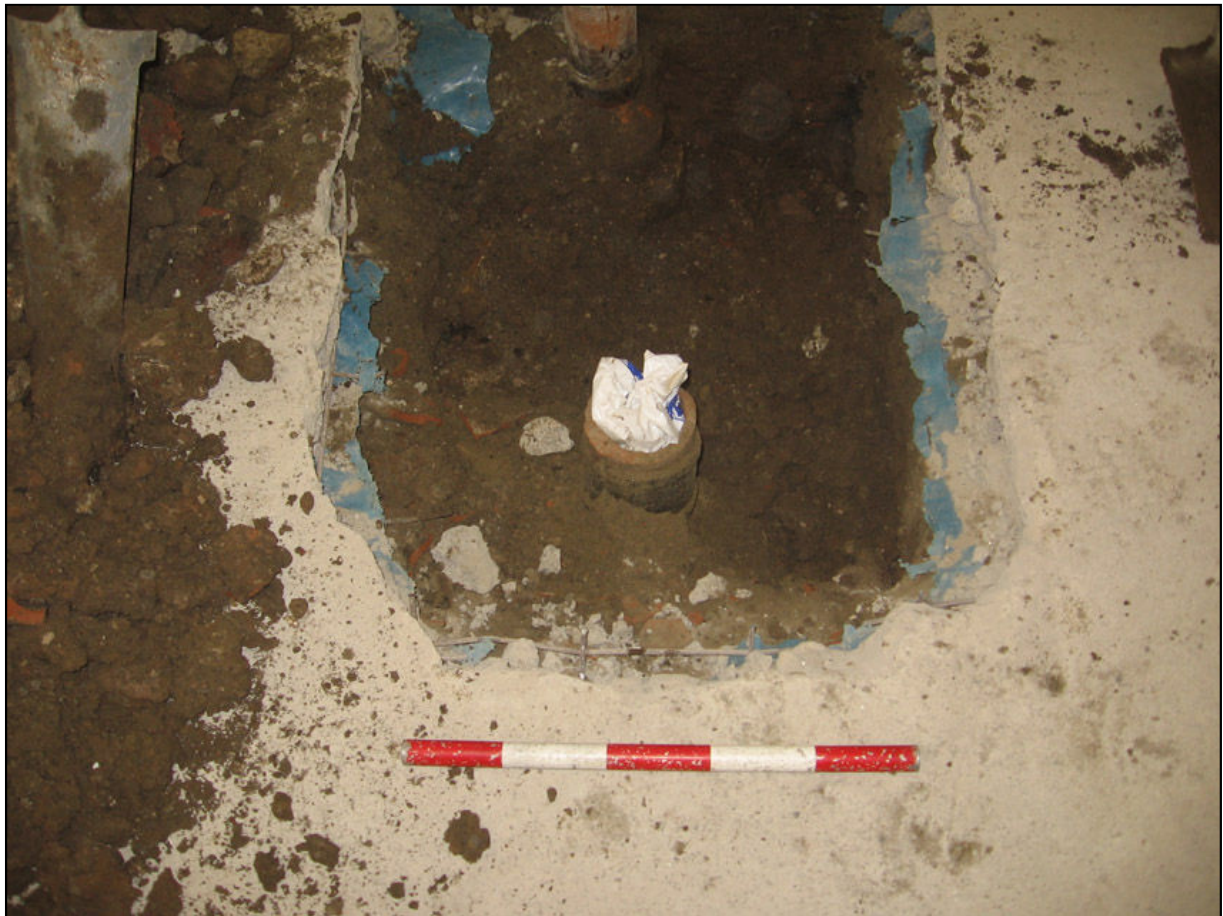
Plate 1 Section 1 trench during excavation, looking south-west

The third section was towards the bottom of the steps down into the basement. The steps and underlying make-up were removed and the sloping surface revealed was cut back vertically to the lowest remaining step. In this vertical section the lowest deposit recorded was a firm, mid brown clay with occasional pebbles (1006). This extended upwards to c.0.95m above the basement floor. Above it was a 0.25m deep layer of dark greyish-brown silt with frequent brick / tile and plaster (1007) forming the make-up for the steps.