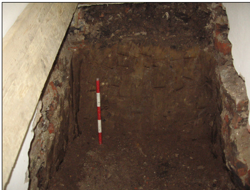
Plate 3 Section 3 after completion of excavation, looking south-west