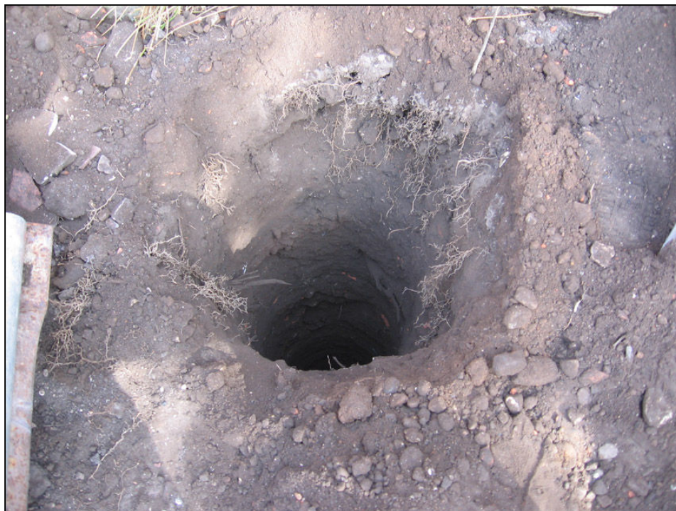
Plate 2 View of top of Foundation Pit 4, looking north