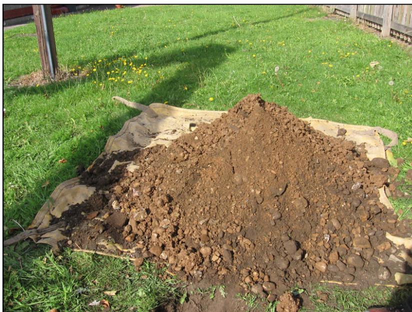
Plate 1 Natural sand and gravel from Foundation Pit 2, looking west

No dating evidence from this watching brief was recovered but some useful conclusions can be made. The sand and gravel 1004 from Foundation Pit 2 and sandy clay from Foundation Pit 4 are both likely to be of natural origin and are typical of the Lawrence Street area of York where the natural varies considerably from clay to gravel to sand. Of some note is its depth below modern ground level, between 1 and 1.4m perhaps suggesting that there has been some build-up of ground level in the area although this could be modern and associated with the pre-fab structures still present along the west side of Regent Street. The insertion of drains had removed any trace of archaeology from Foundation Pits 1 and 3 and there were no clearly archaeological deposits within Foundation Pit 4. Contexts 1005 and 1006 in Foundation Pit 2 may have been build-up deposits of uncertain date but probably medieval or post-medieval. The brickwork noted in Foundation Pit 1 may have belonged to one of the 19 th century houses believed to have occupied this street prior to the erection of the pre-fab buildings. No archaeological remains of any significance were encountered during the works.