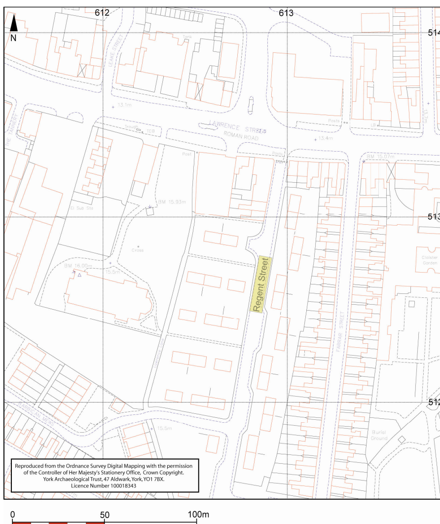
Figure 1 Location of Regent Street

On 1 st September 2010 York Archaeological Trust undertook a watching brief on land towards the northern end of Regent Street, off Lawrence Street, York (Figure 1). The objective was to record any deposits, features or buried structures of archaeological interest encountered during the excavation of two pits for new telegraph poles. In each case modern obstructions were encountered above the required depth, c.1.8m below ground level and the pits were both relocated (Figure 2). All four pits are described in this report. The pits were each approximately 0.4m square and up to 1.8m deep. The test pits were mainly dug by hand although a lorry-mounted mechanical drill was used to excavate the lower parts of the pits. The recording took the form of written notes and measured sketches supplemented by colour digital photographs.