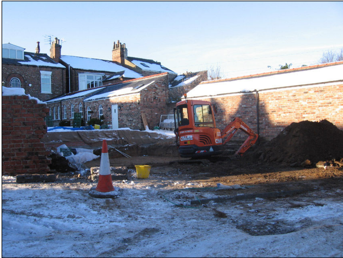
Plate 5 General view of site, looking north-west