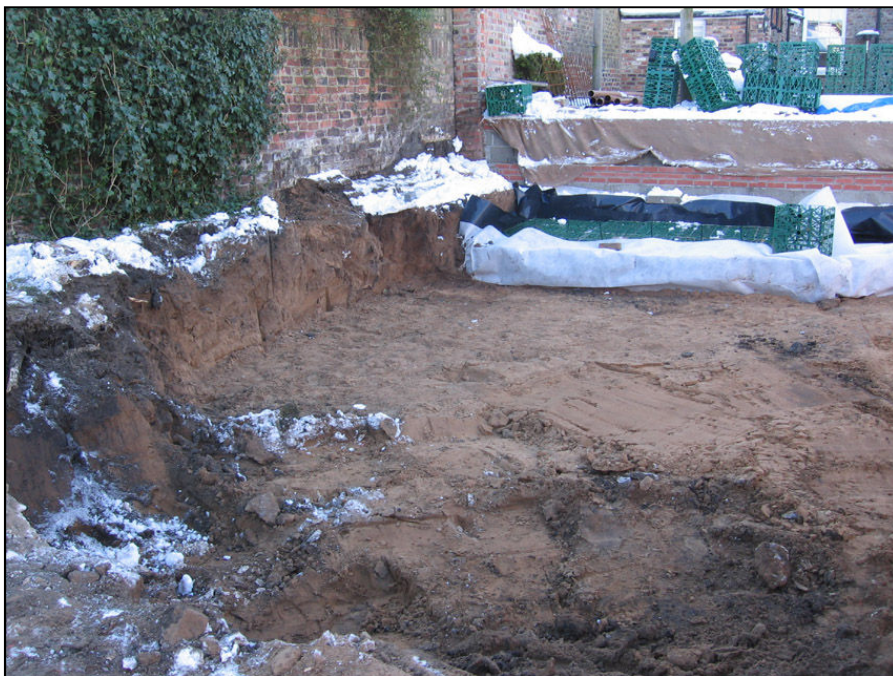
Plate 4 South-west corner of site, looking south-west