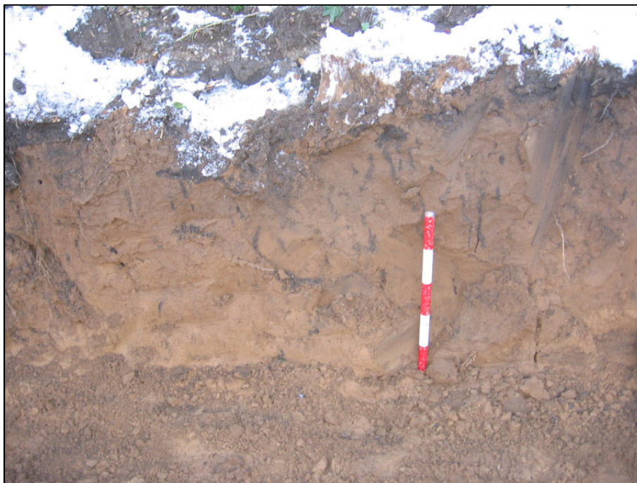
Plate 1 Detail of part of north facing section, looking south