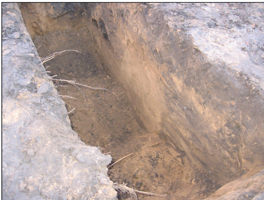
Plate 2 Drain exploratory trench / recorded section, looking north-east