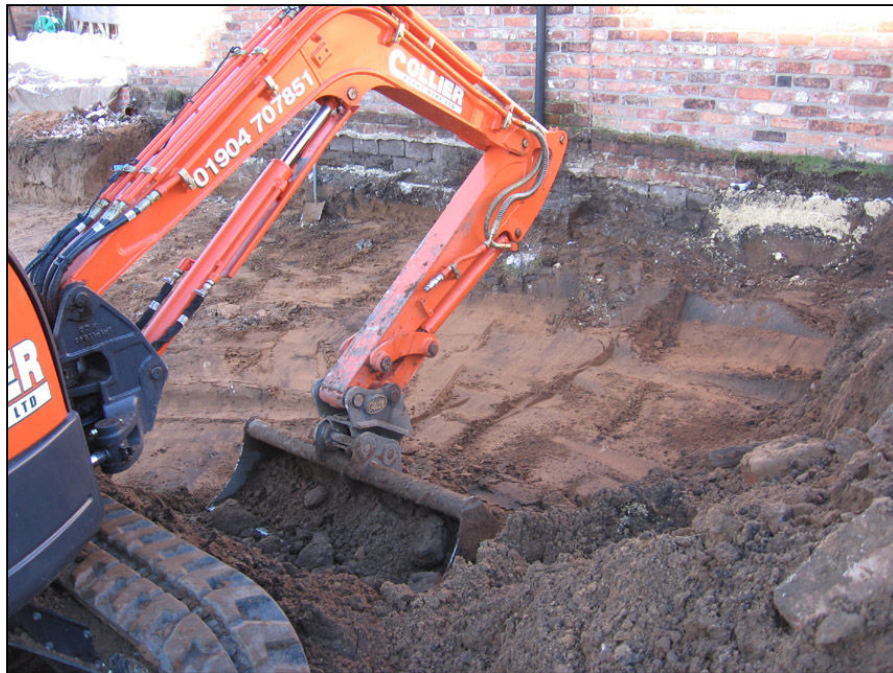
Plate 3 Site strip in progress, looking north-west