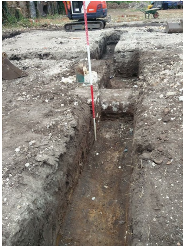
Plate 1. Example of foundation trenches and modern disturbance, looking southeast