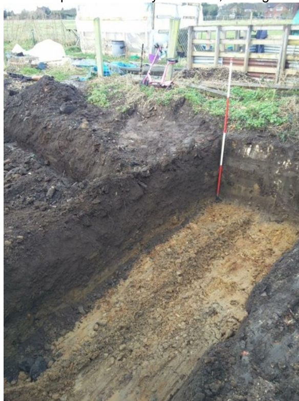
Plate 2. Example of soakaway and drain, looking northwest