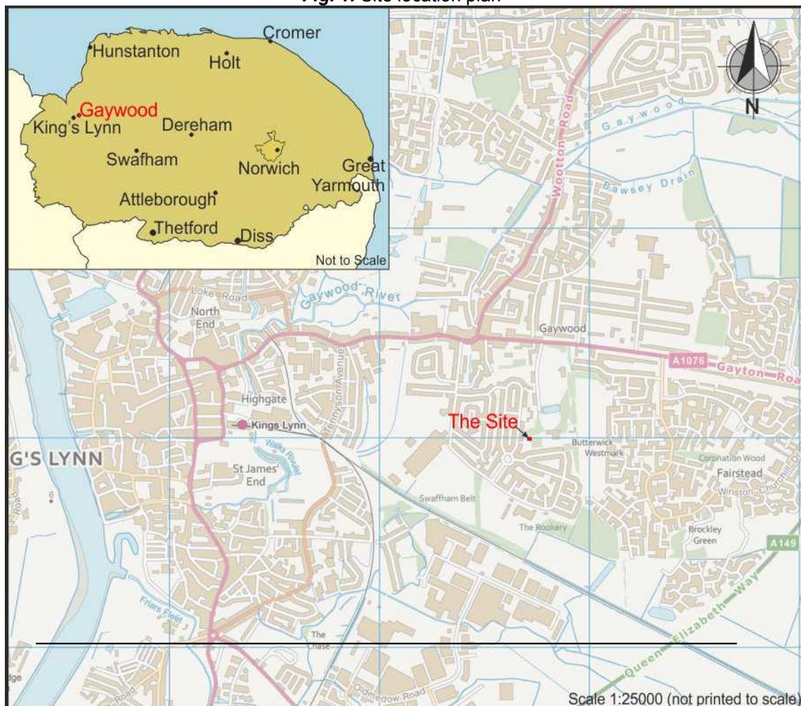
Fig. 1. Site location plan