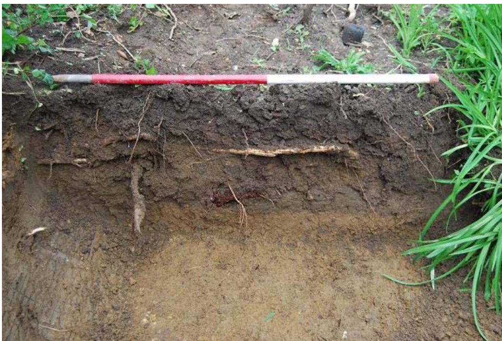
Plate 2 South-east facing section of Trench 1 showing rooting activity