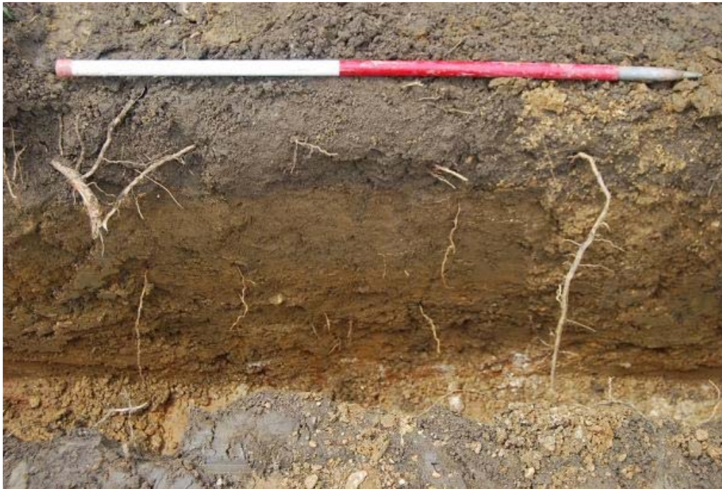
Plate 4 South-east facing sample section of Trench 2 building footings