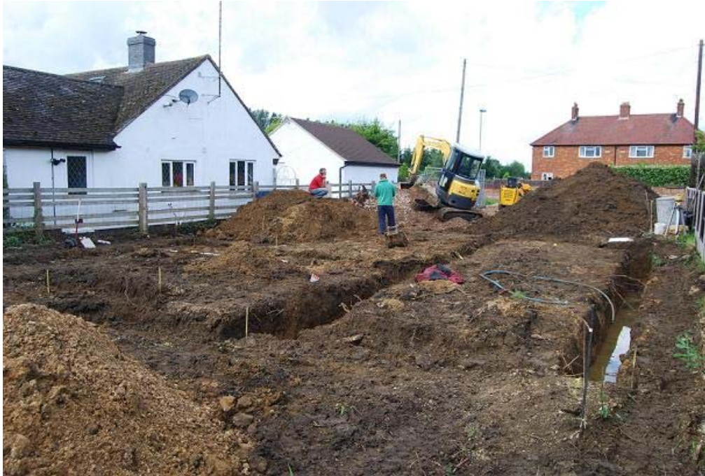
Plate 3 The overall site once bungalow foundations (Trench 2) had been excavated, looking north.