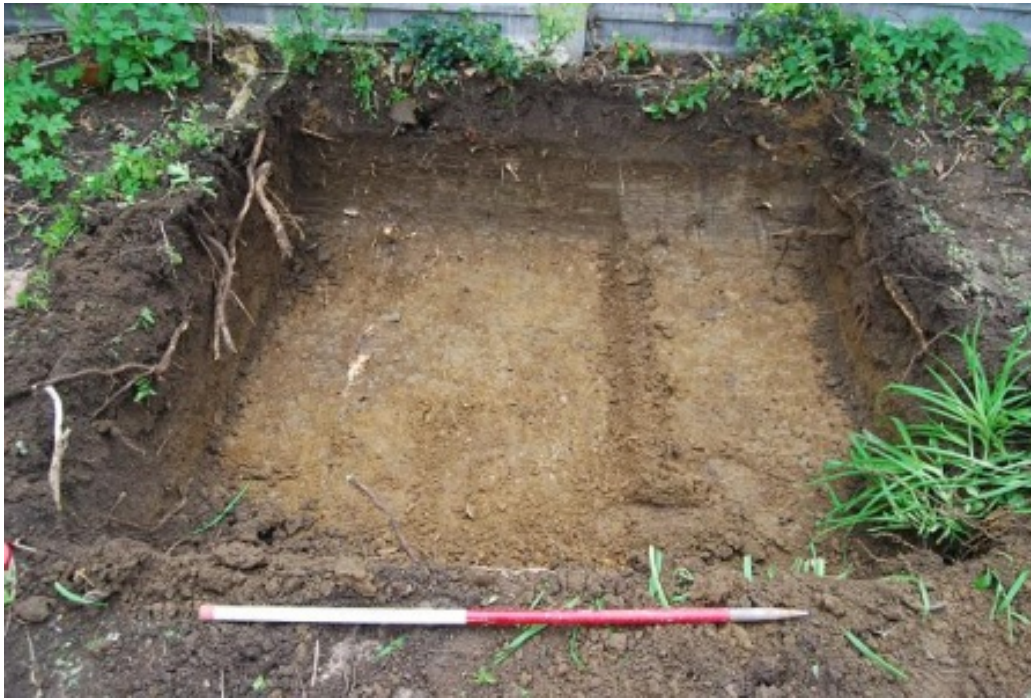
Plate 1 Trench 1 Soak away fully excavated looking south-west