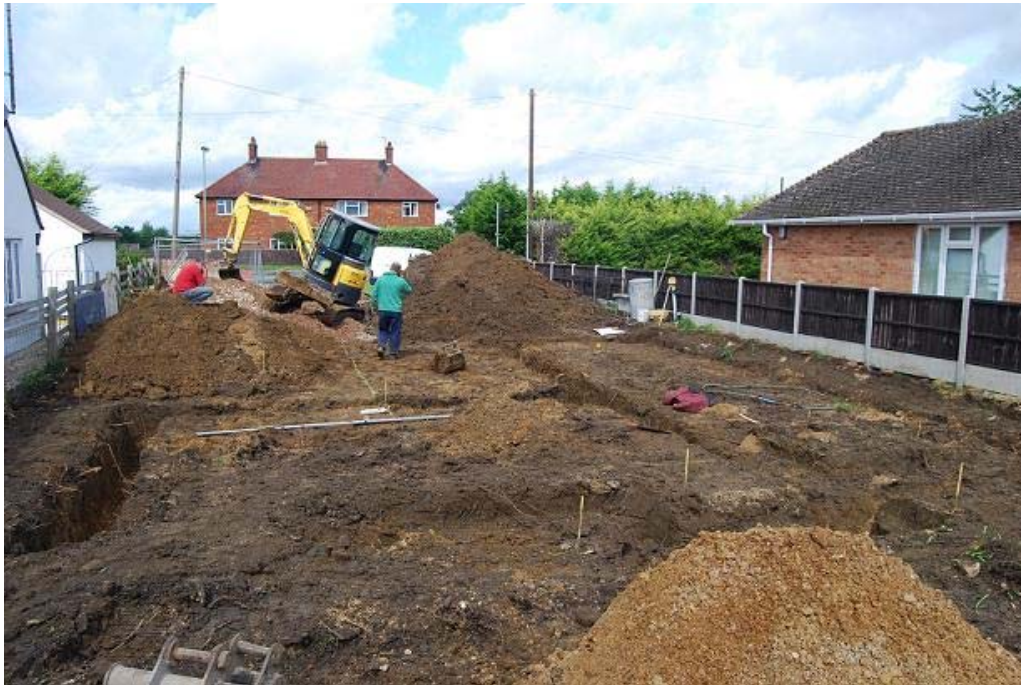
Plate 5 The overall site looking north-east