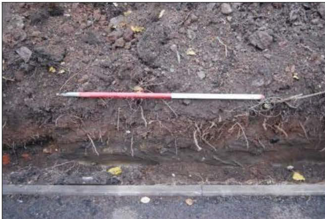
Plate 6 West facing section of Trench 1 through flower bed