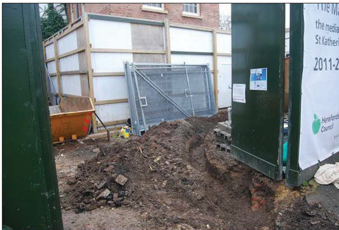
Plate 1 Trench 1 through the courtyard from the north