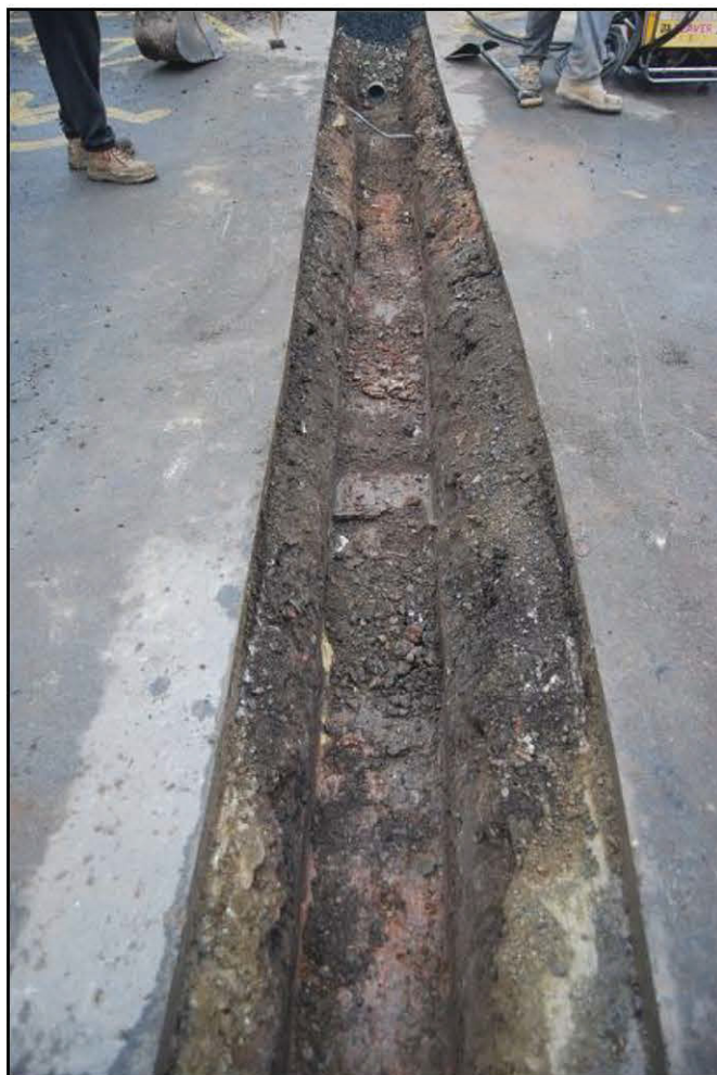
Plate 3 Trench 1 through the car park from the north