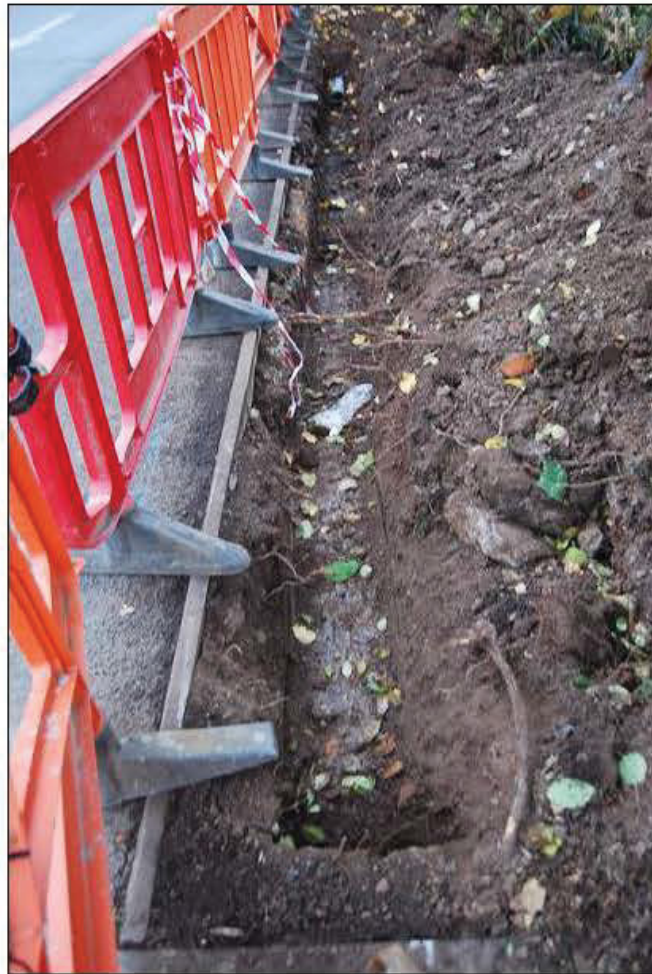
Plate 5 Trench 1 through the flower bed from the south