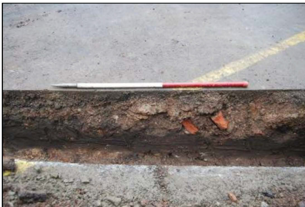
Plate 4 West facing section of Trench 1 through the car park