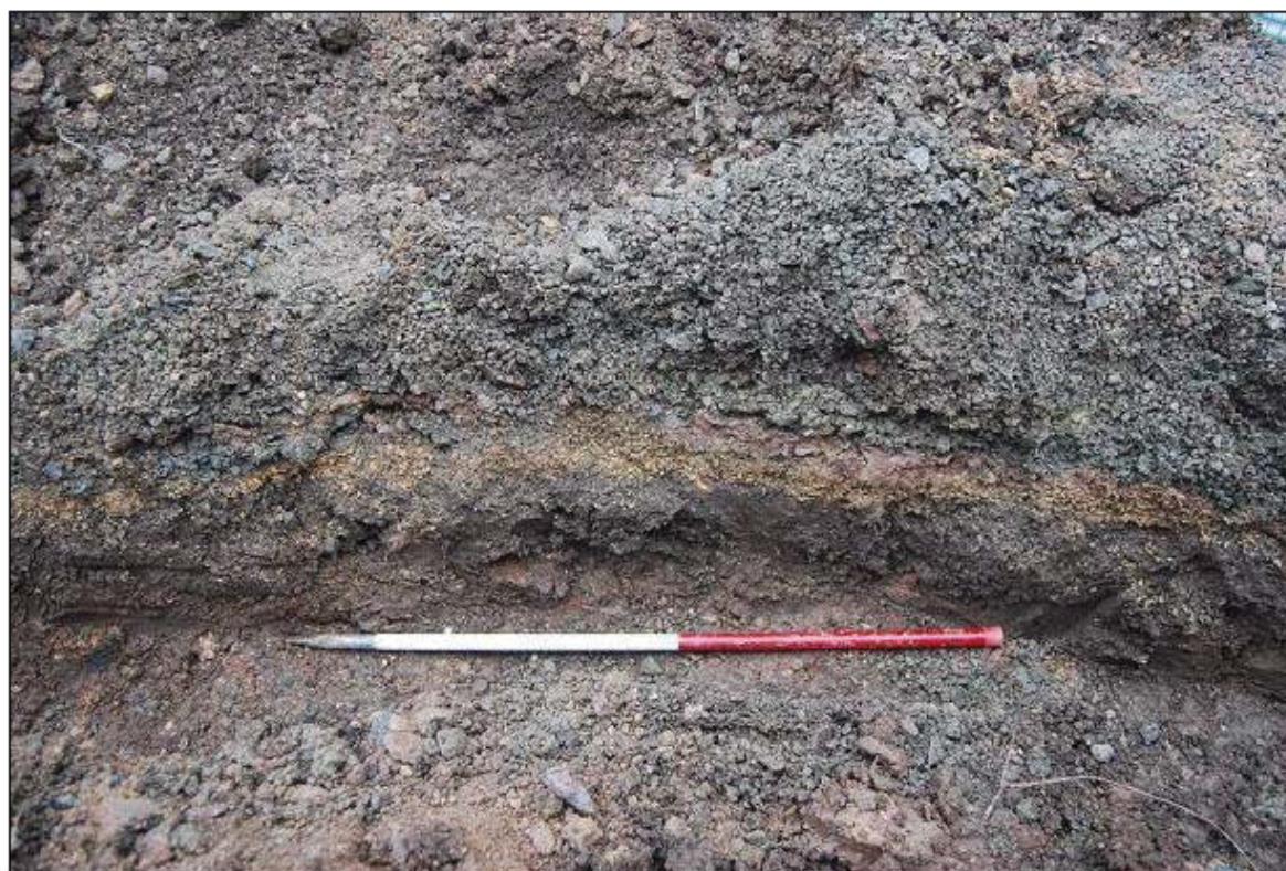
Plate 2 North-west facing section of Trench 1 through the courtyard