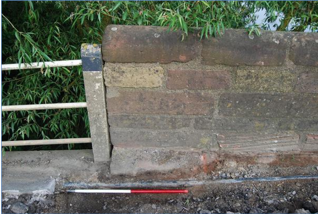
Plate 5 The service cable revealed on the south-west corner of the bridge