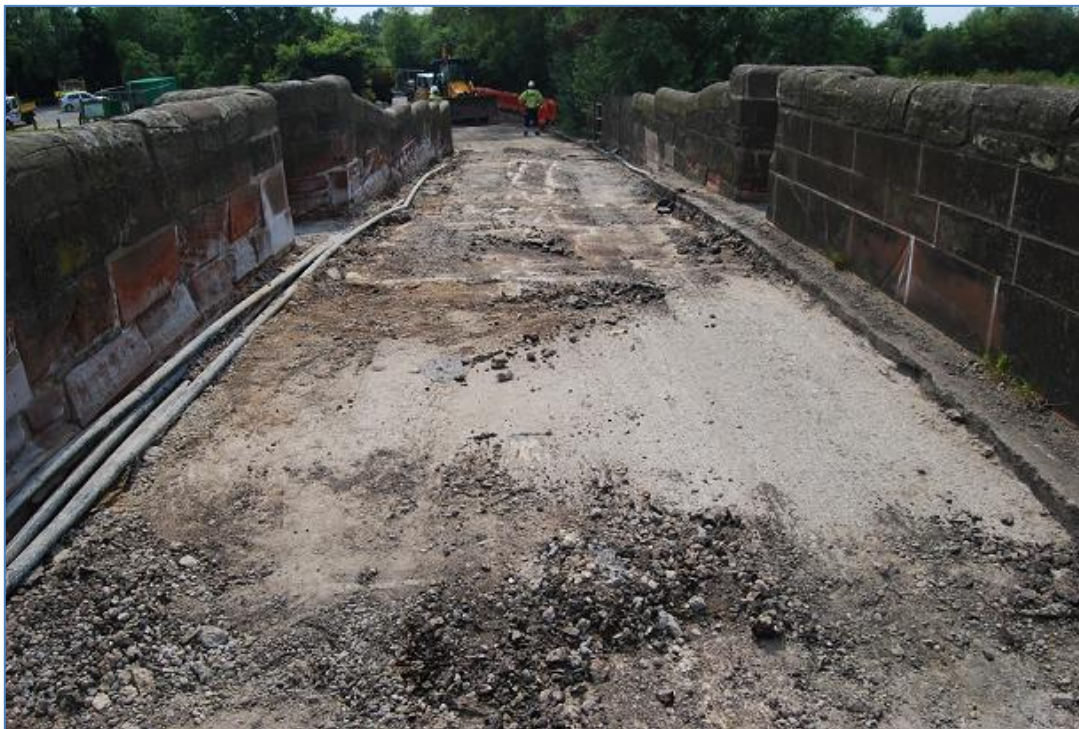
Plate 6 Tarmac removed from the carriageway cables exposed, looking south-west