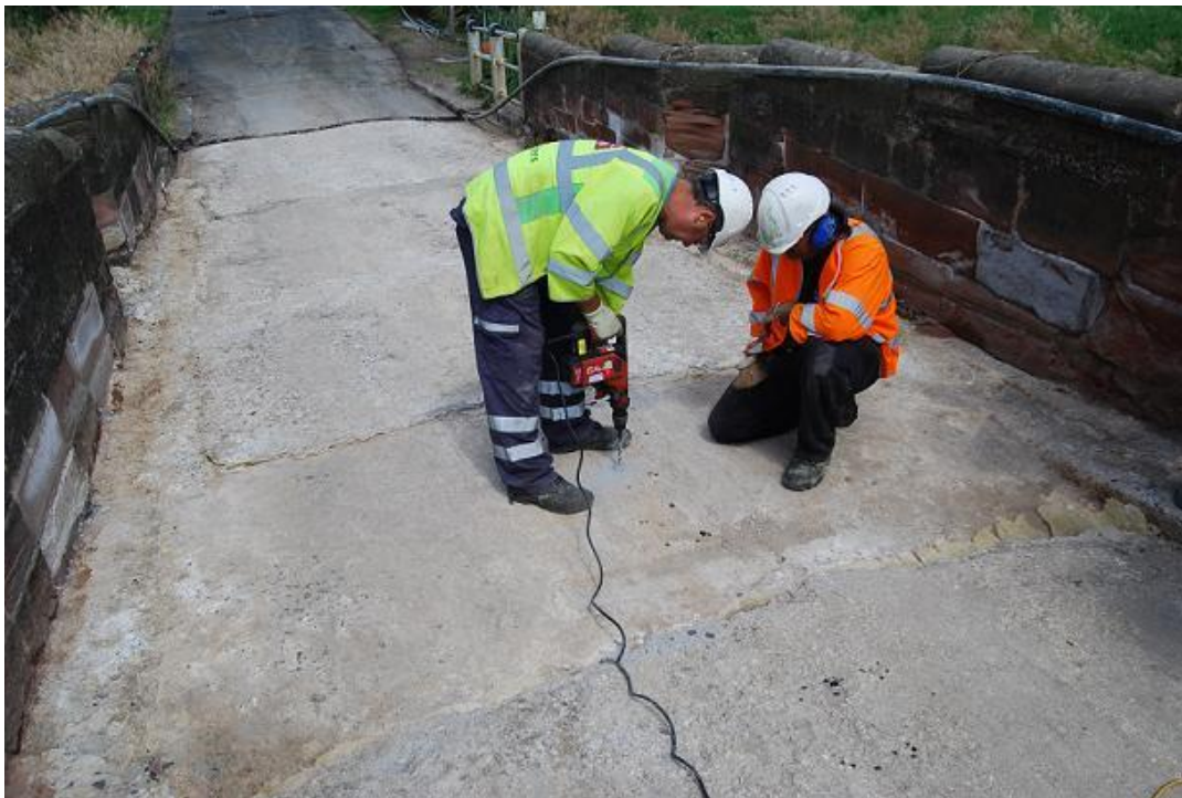
Plate 10 Example of drilling holes through the concrete in the centre of each arch, looking east