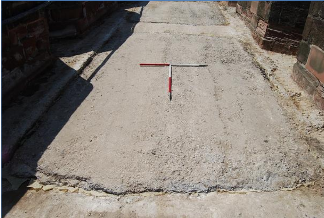
Plate 9 The concrete saddling between the arches after cleaning, looking south-west