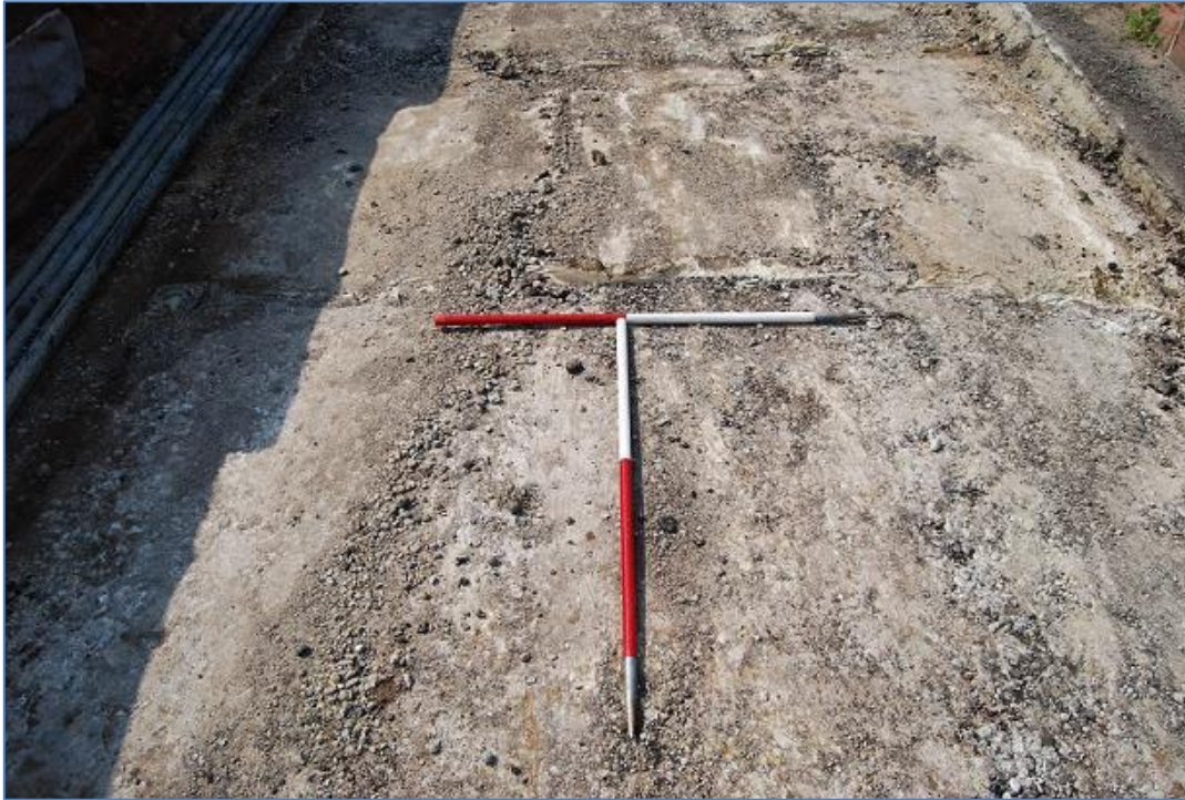
Plate 7 Example of saddling concrete and underlying plastic sheeting between the bridge arches before cleaning