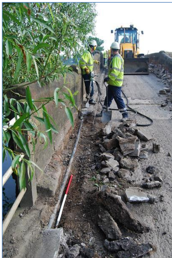
Plate 4 Breaking out the concrete along the parapet walls to reveal service cables