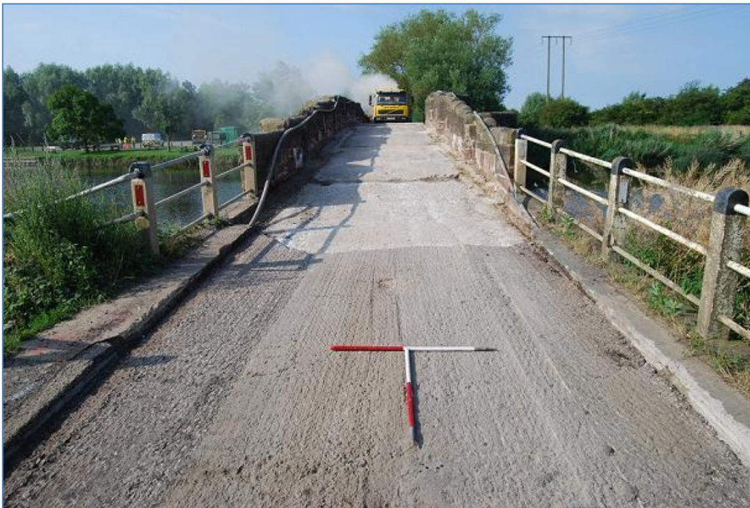
Plate 8 Road sweeping the bridge concrete, looking south-west