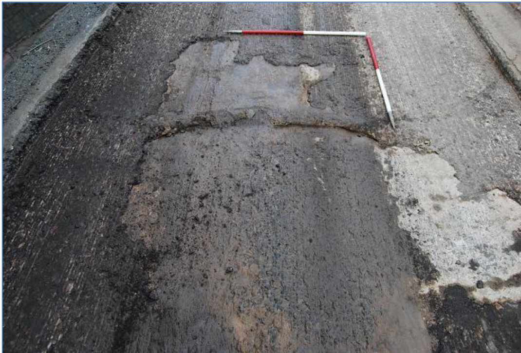
Plate 3 Uneven concrete that had caused cracking in the tarmac carriageway