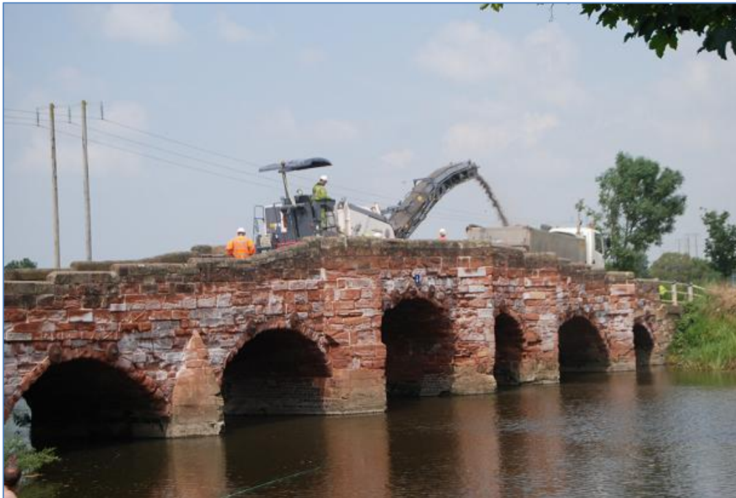
Plate 1 Planing top tarmac surface off the bridge, looking north