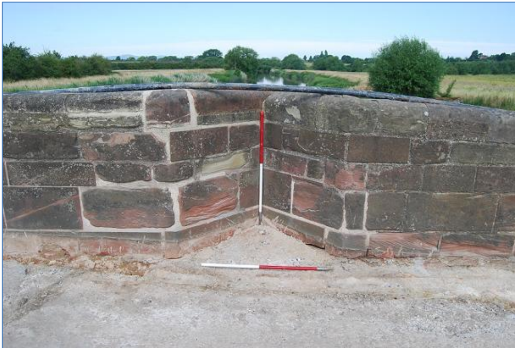
Plate 14 Refuge on Northwest side of bridge with sandstone revealed, view west