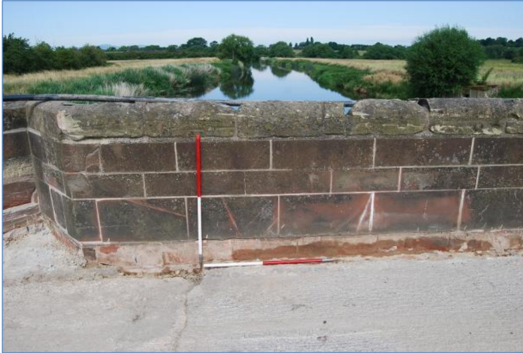
Plate 13 Example of parapet wall with sandstone revealed on north-west side of bridge, view west