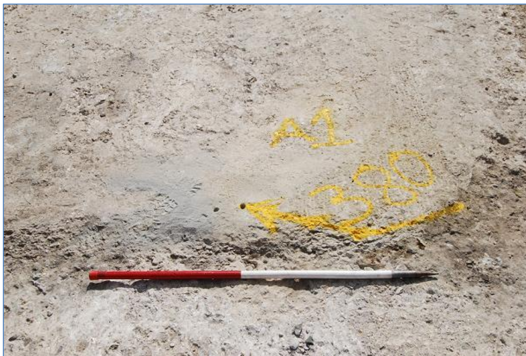
Plate 15 Example drill hole in arch 1; concrete is 380mm in depth overlying the sandstone bridge