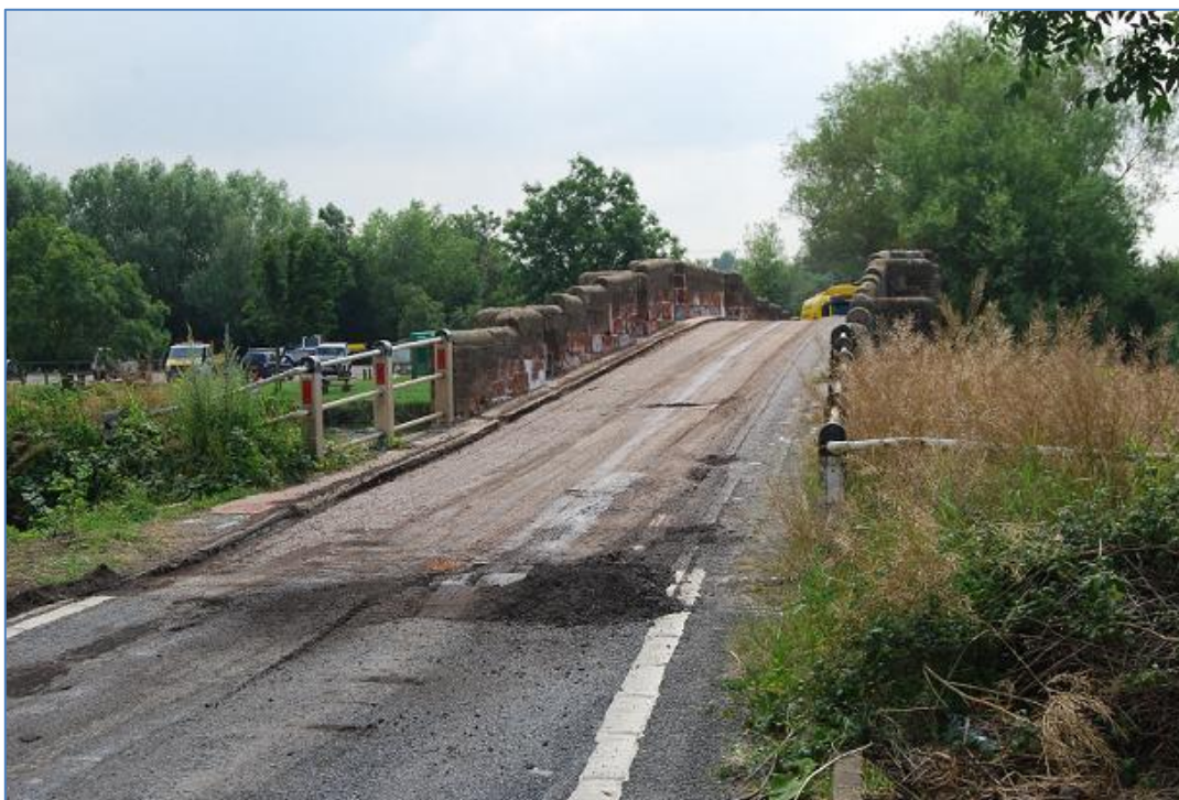
Plate 2 The road surface following planing, looking south