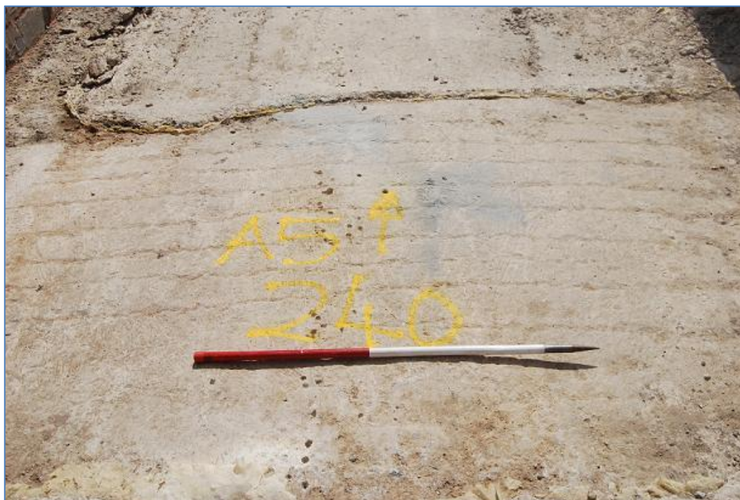
Plate 16 Example of drill hole in arch 5; concrete is 240mm in depth down to sandstone bridge