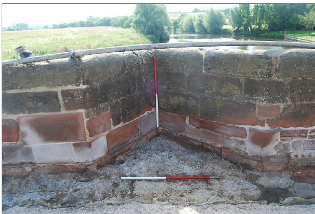
Plate 12 Example of a refuge on east side of bridge, view south-east