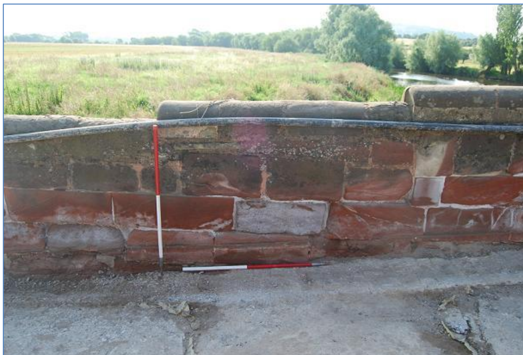
Plate 11 Parapet wall revealed on the northeast side of the bridge, view south-east