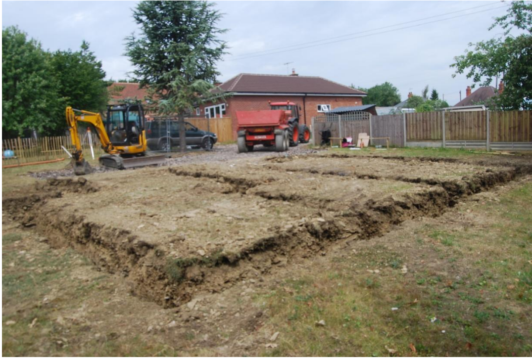
Plate 3: General view north-west of foundations trenches with access road in background