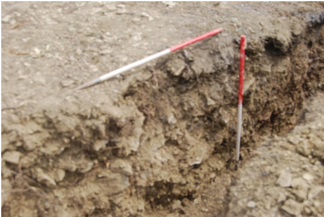
Plate 2: Sample foundation trench section