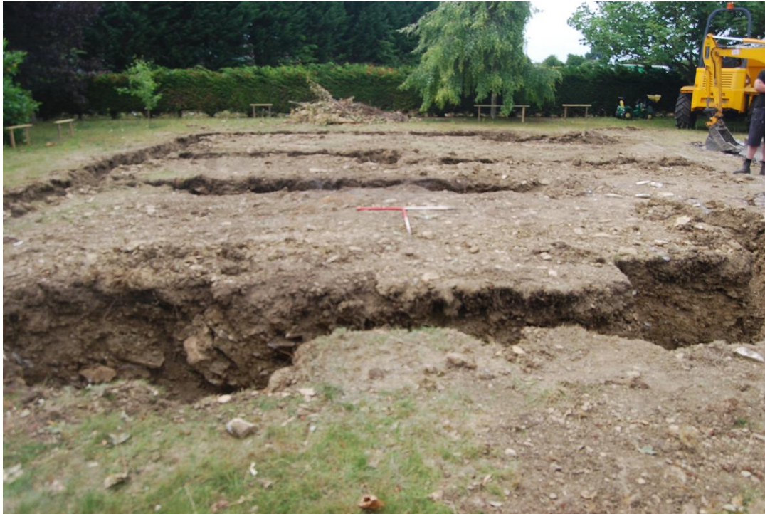
Plate 1: General view of foundation trenches in progress, view south-south-east