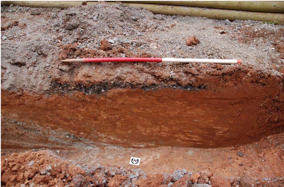
Plate 2 North facing section of foundation trench