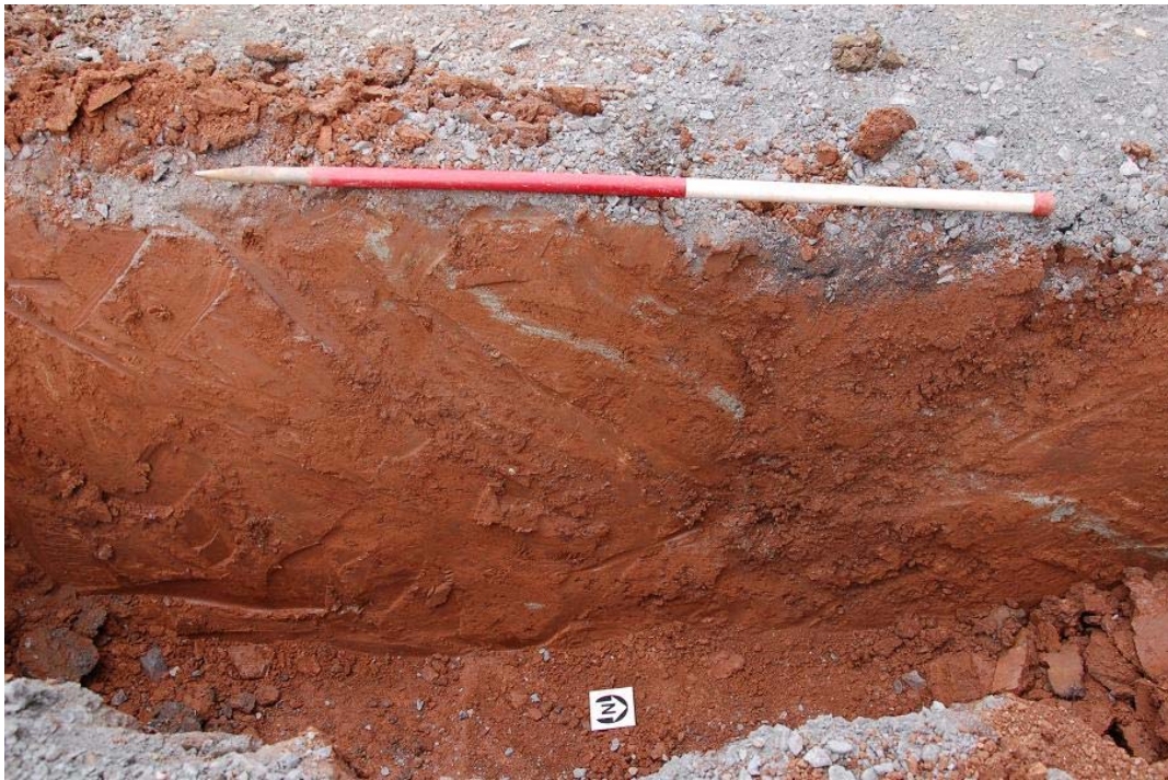
Plate 3 East facing section of foundation trench including modern water pipe cut