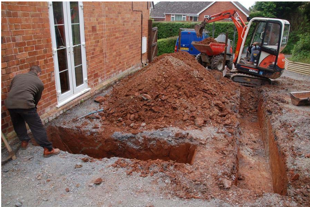
Plate 4 Location of Foundation trenches