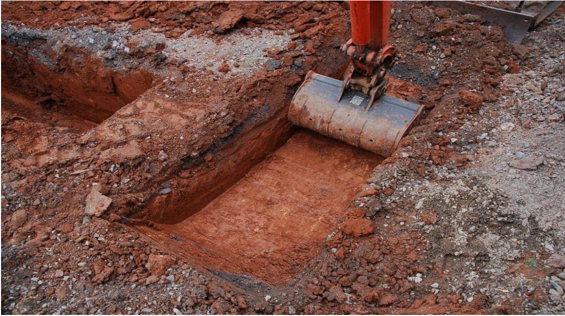
Plate 1 Foundation trench looking north east