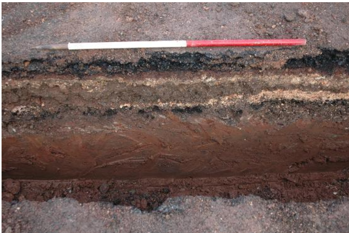
Plate 3 South-west facing section through modern made ground deposits