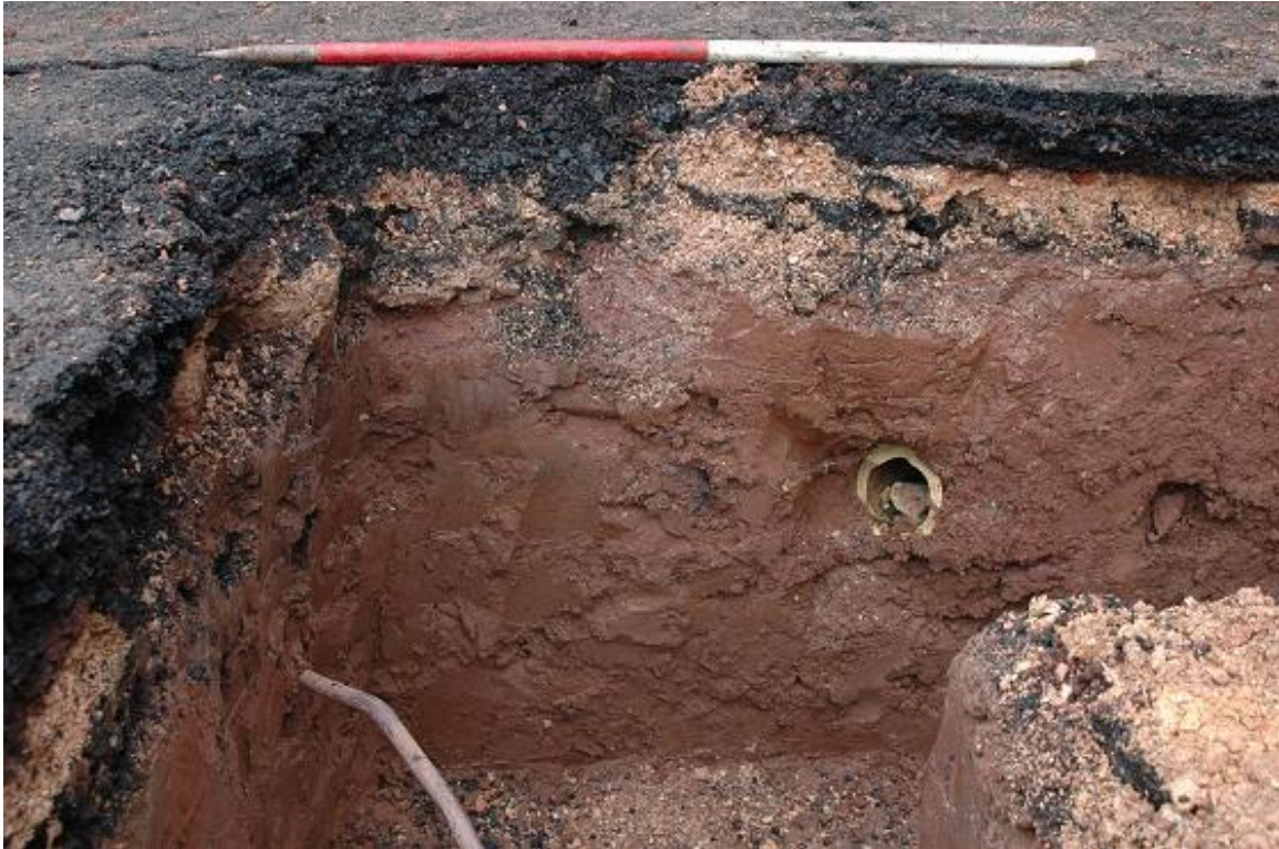
Plate 1 South-west facing section through modern made ground deposits.