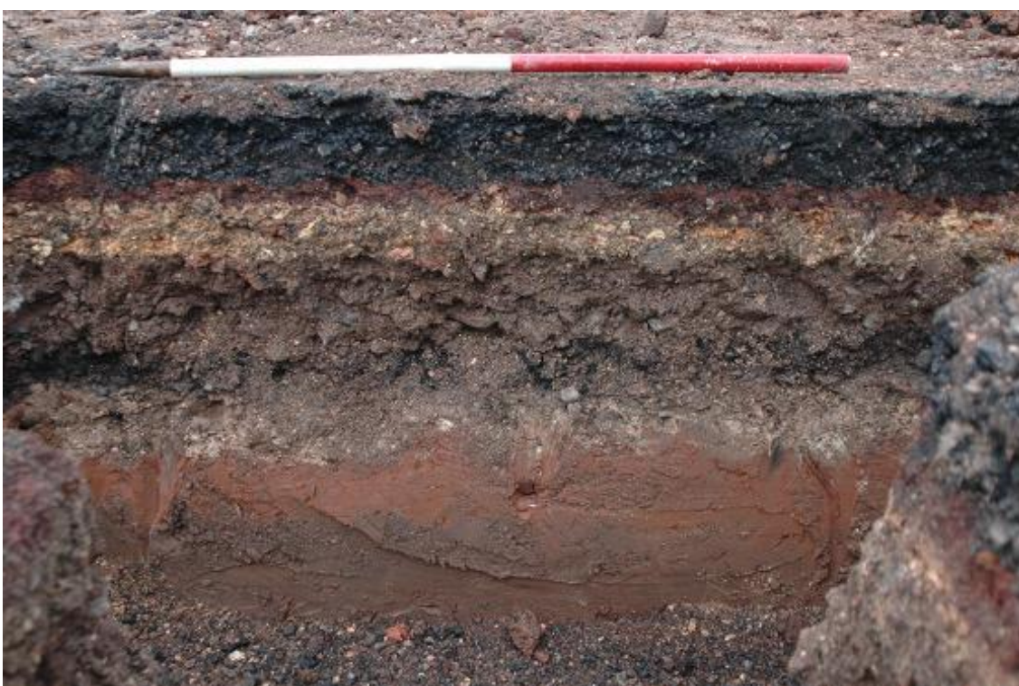
Plate 4 South-east facing section through modern made ground deposits