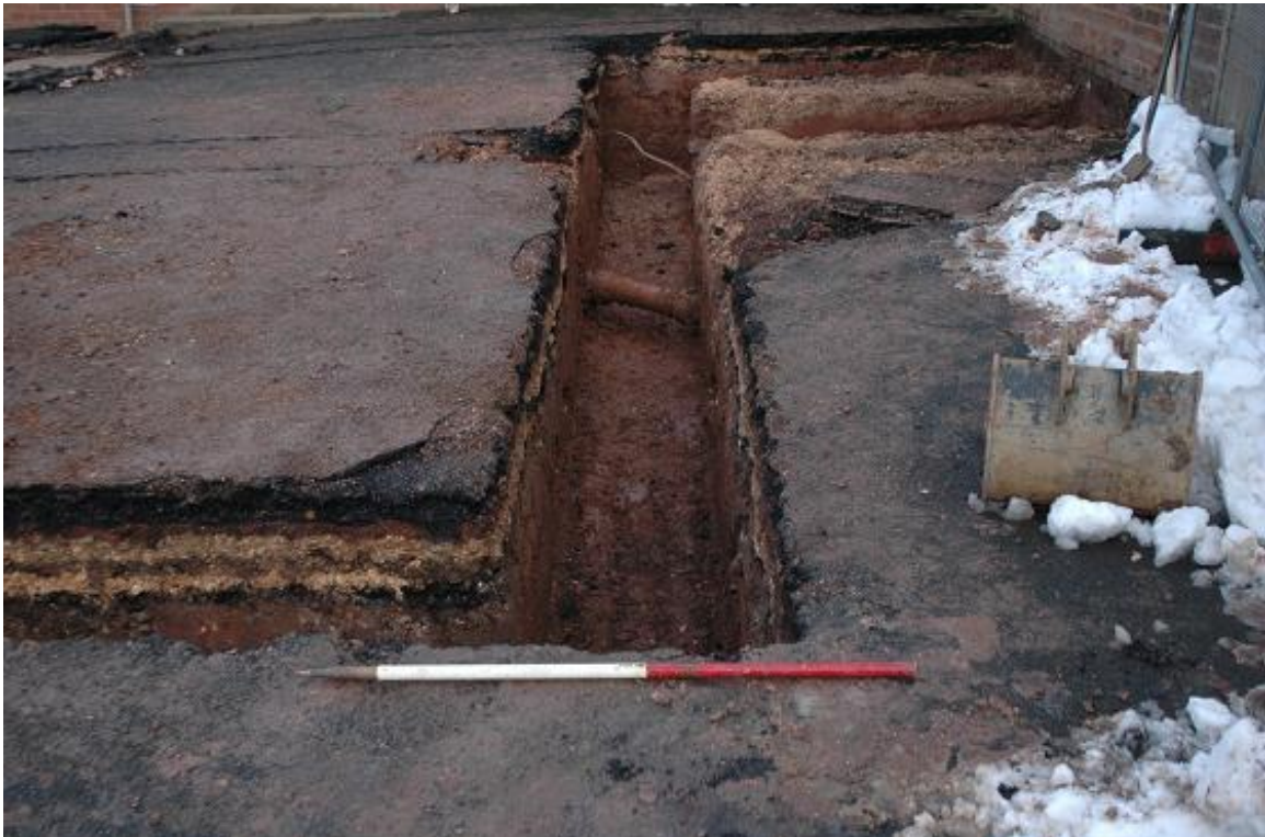
Plate 2 The site from the south-west