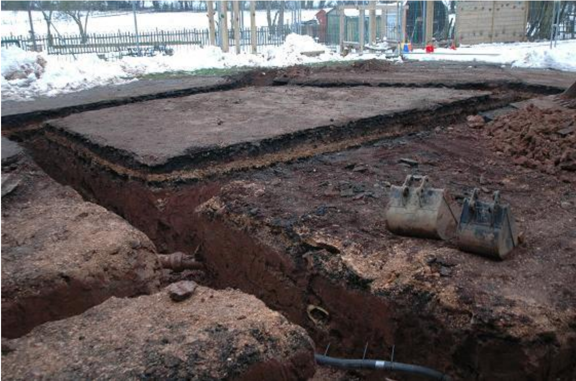
Plate 5 The site from the north-east