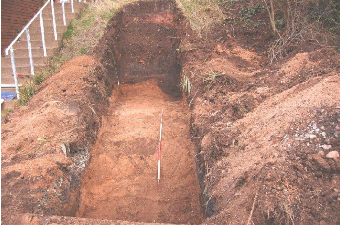
Plate 19: Trench 17, natural sandy deposit in foreground with section showing extensive modern made ground forming the grass terrace to the west of the nurse's home, scale at 2m. Facing east.