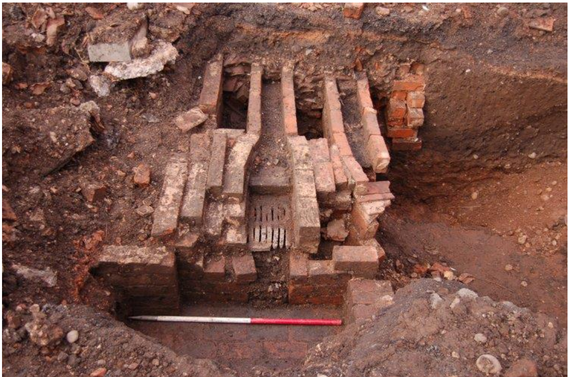
Plate 16: Trench 12, brick structure (1320), showing iron crate, stokehole and stoke pit in foreground, the external brick wall (1324) can be seen to the right of the main structure, scale at 1m. Facing west.