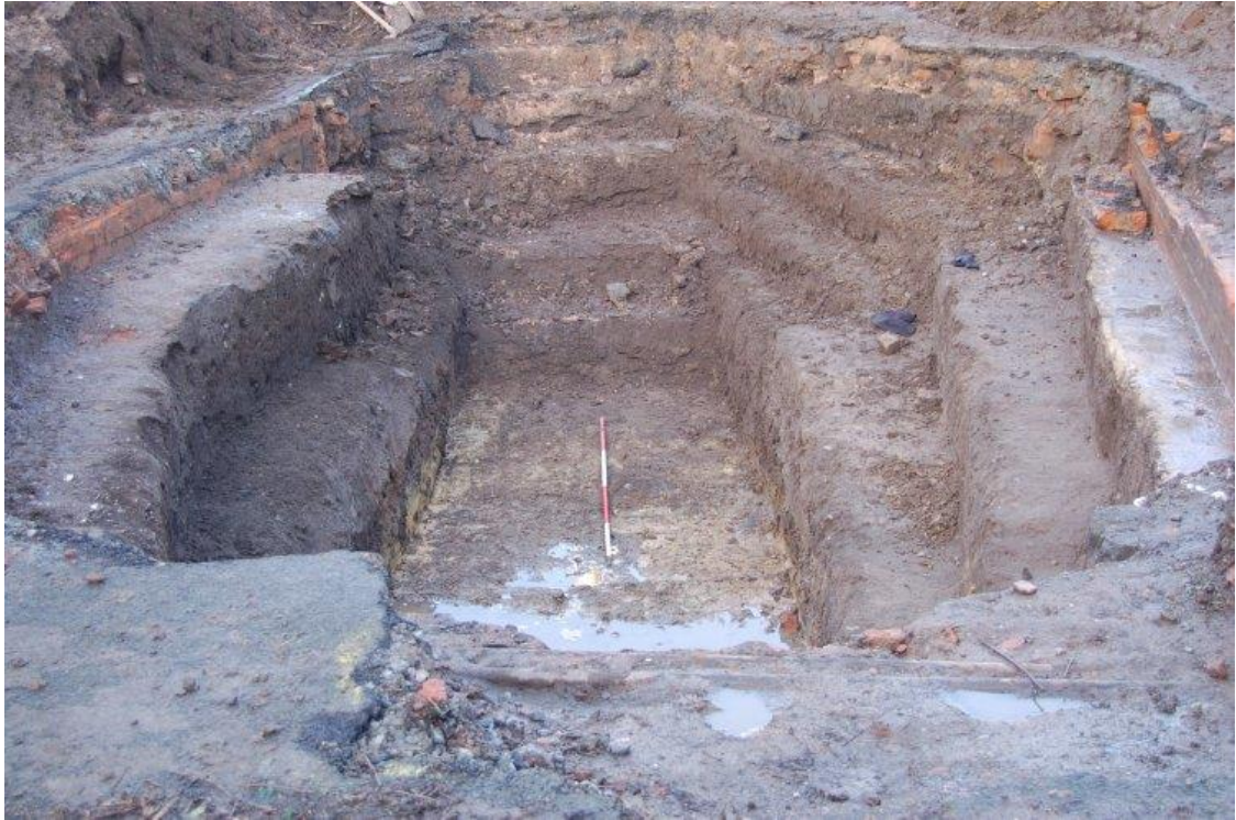
Plate 27: General view of Trench 23, north/south aligned linear ditch (2311) visible in centre of trench, scale at 2m. Facing north.