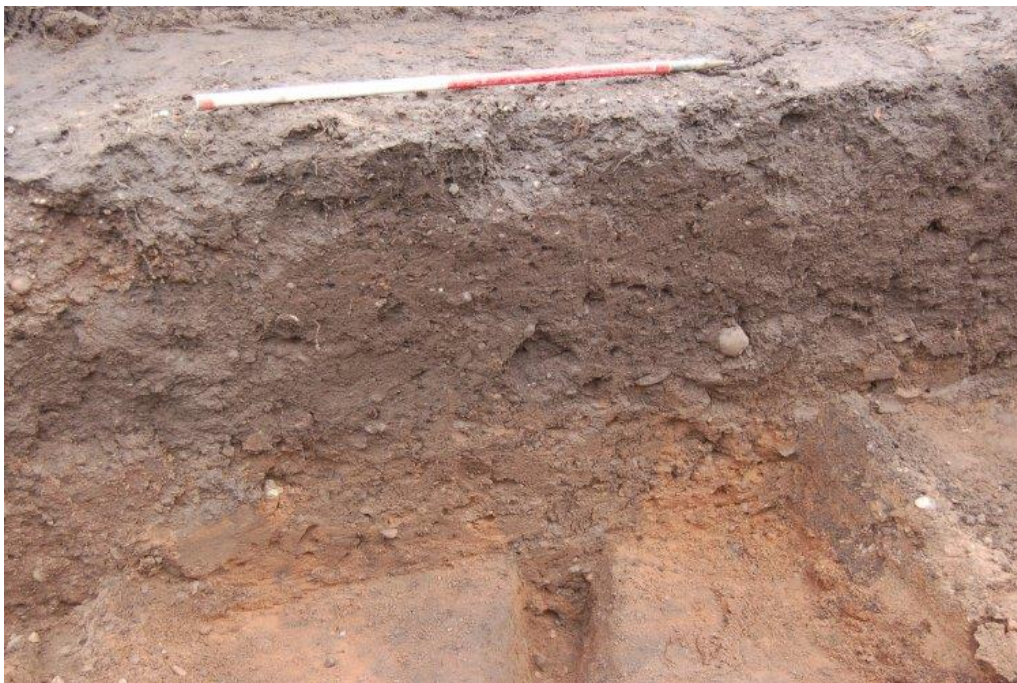
Plate 8: Trench 7, gully 708, scale at 1m. Facing east.