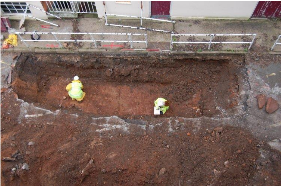
Plate 34: General view of Trench 29, scale at 2m. Facing east.