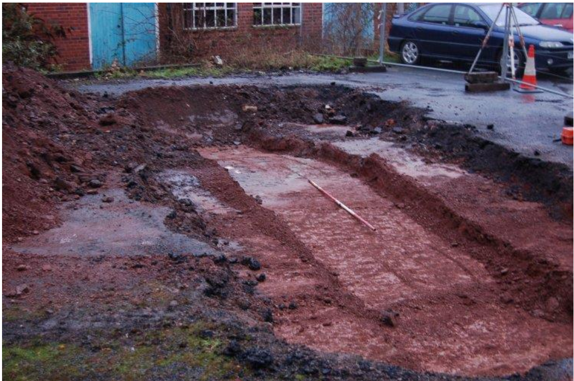
Plate 20: General view of Trench 18 showing present tarmac surface lying directly on natural deposits, indicating extensive truncation of the central terrace area of the site, scale at 2m. Facing west.