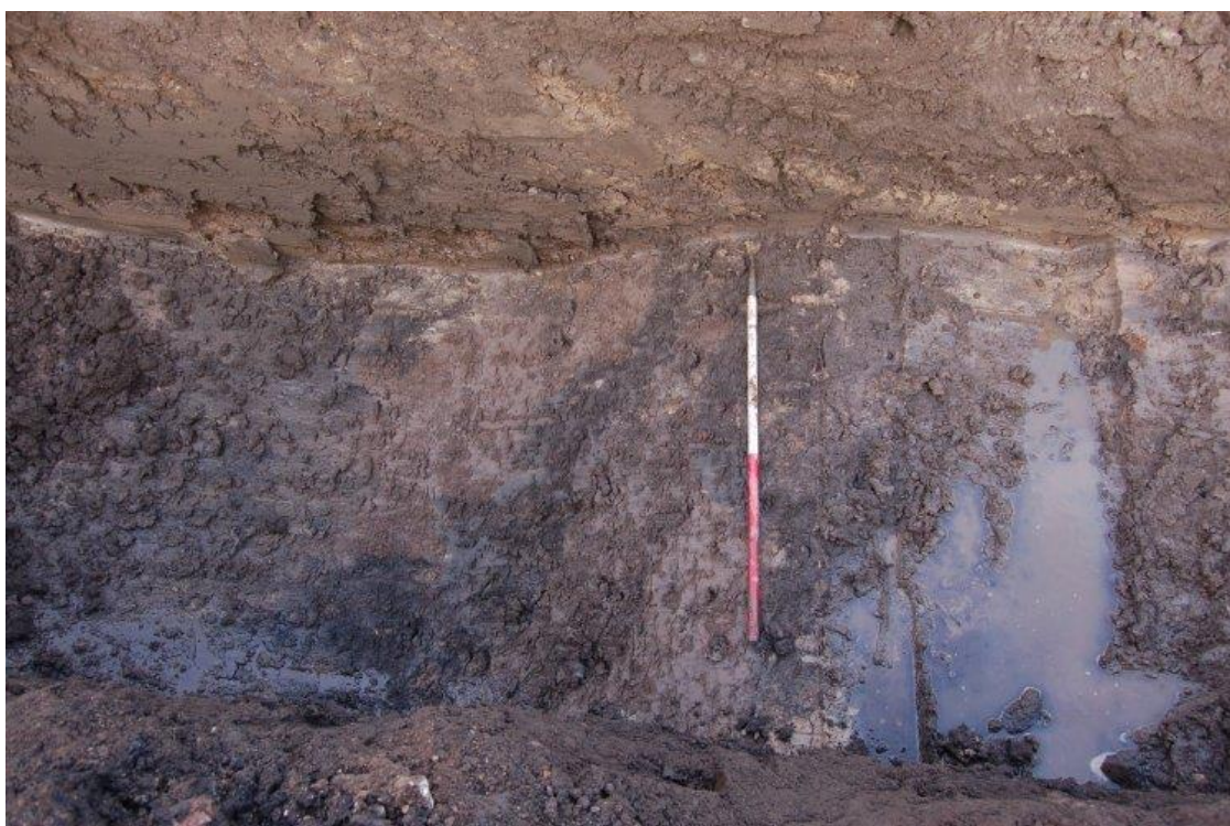
Plate 26: Trench 22, two roughly north/south aligned unexcavated ditches (2208, 2210) below the scale, scale at 1m. Facing north.