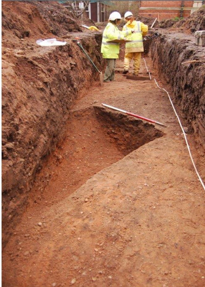
Plate 7: Trench 7, southwest/northeast aligned Roman (?) ditch (714), scale at 1m. Facing north.