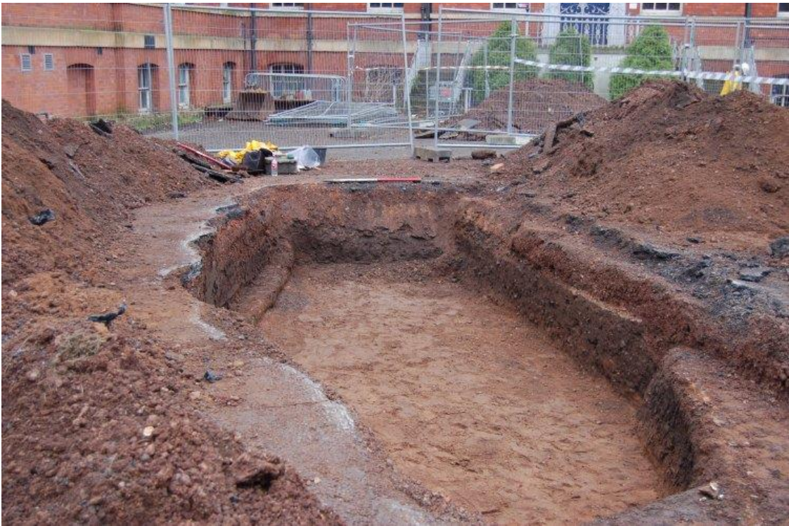
Plate 2: General view of Trench 2, scale at 1m. Facing north-east.