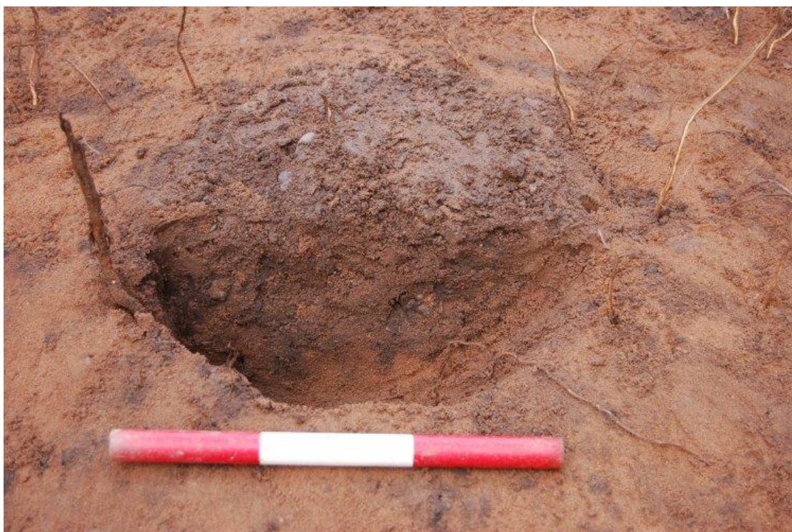
Plate 9: Trench 9, pit cut ( 908), scale at 0.3m. Facing north.