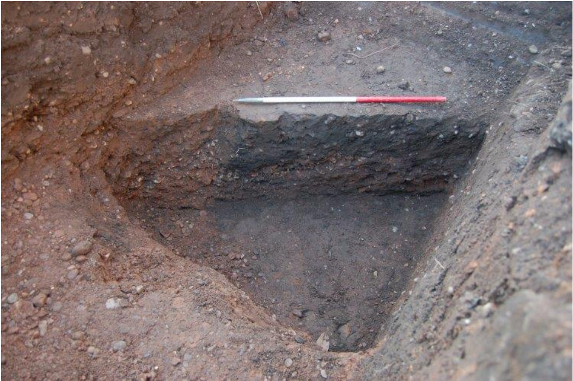
Plate 17: Trench 14, 18 th century linear ditch (1415) with dark fill to right, truncating earlier 17 th feature (1413) to the left, scale at 1m. Facing south-west.