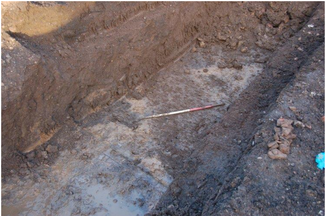
Plate 23: Trench 21, northeast/southwest aligned medieval ditch (2108) visible in centre of trench, scale at 1m. Facing north-west.