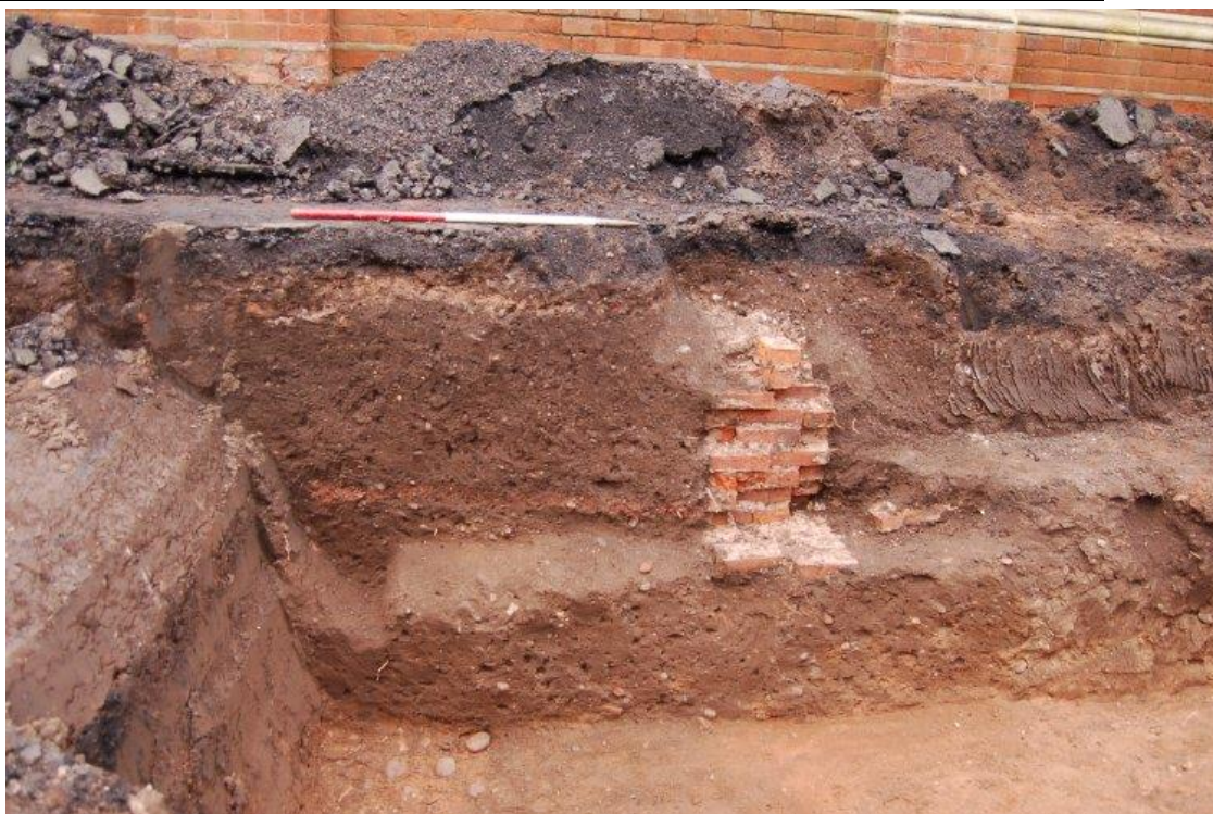
Plate 3: Trench 3, 18 th century wall 308, medieval ditch 311, seen as dark stain in lower foreground prior to excavation, scale at 1m. Facing west.