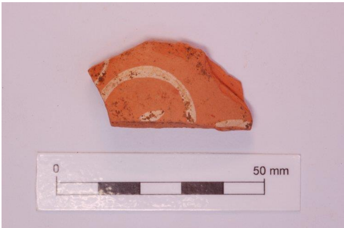
Plate 36: 1 st – 2 nd century Oxfordshire colour coat pottery sherd, with painted white circles and pellets (1208).