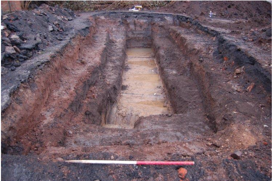
Plate 29: General view of Trench 25, scale at 1m. Facing south.