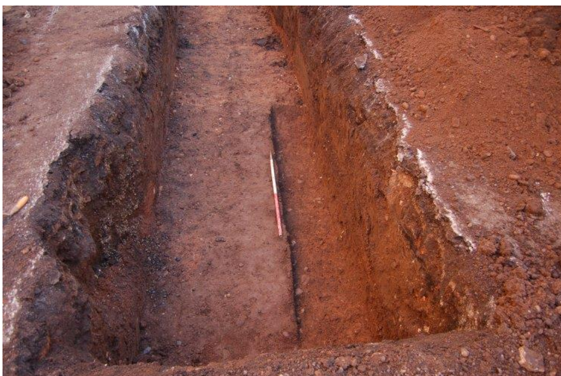
Plate 32: Trench 27, north/south aligned Roman ditch (2703) in foreground, scale at 1m. Facing east.