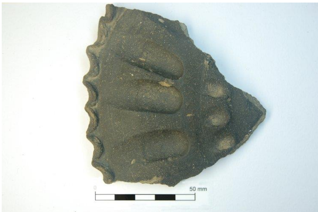
Plate 37: Roman Malvernian lid, with impressed finger decoration and 'piecrust' rim (2505).