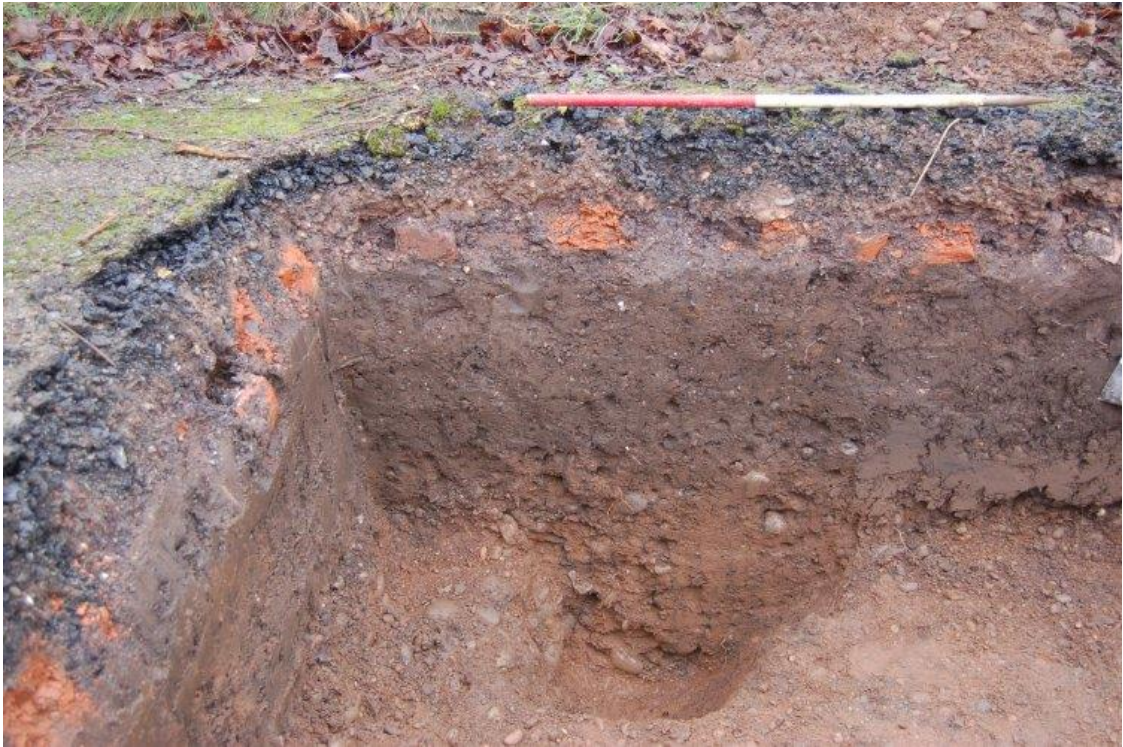
Plate 5: Trench 6, possible Roman pit 607, scale at 1m. Facing north.