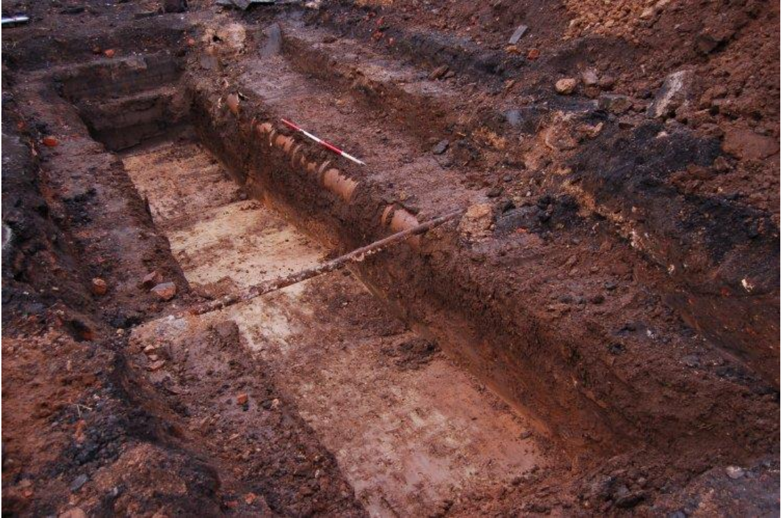
Plate 33: General view of Trench 28, interface between yellow flood plain alluvial clays and red Mercian Mudstone of the terrace slope can be seen in the bottom right hand corner of the trench, scale at 2m. Facing north-west.