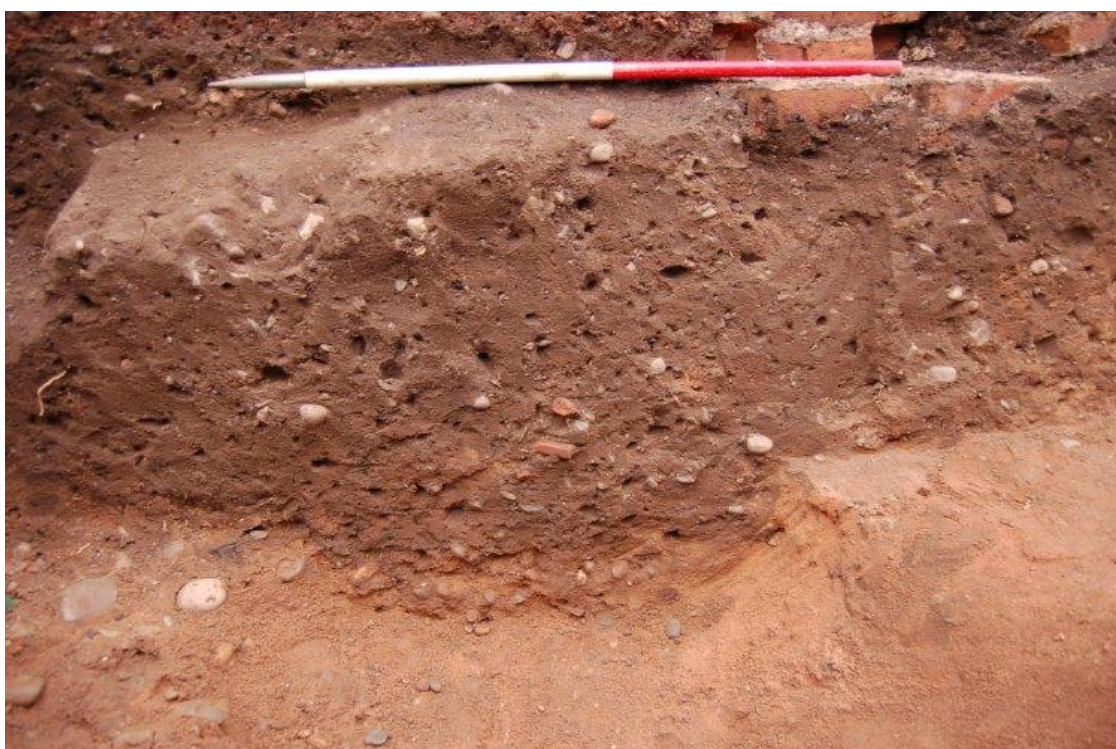
Plate 4: Trench 3, excavated medieval ditch 311, scale at 1m. Facing west.