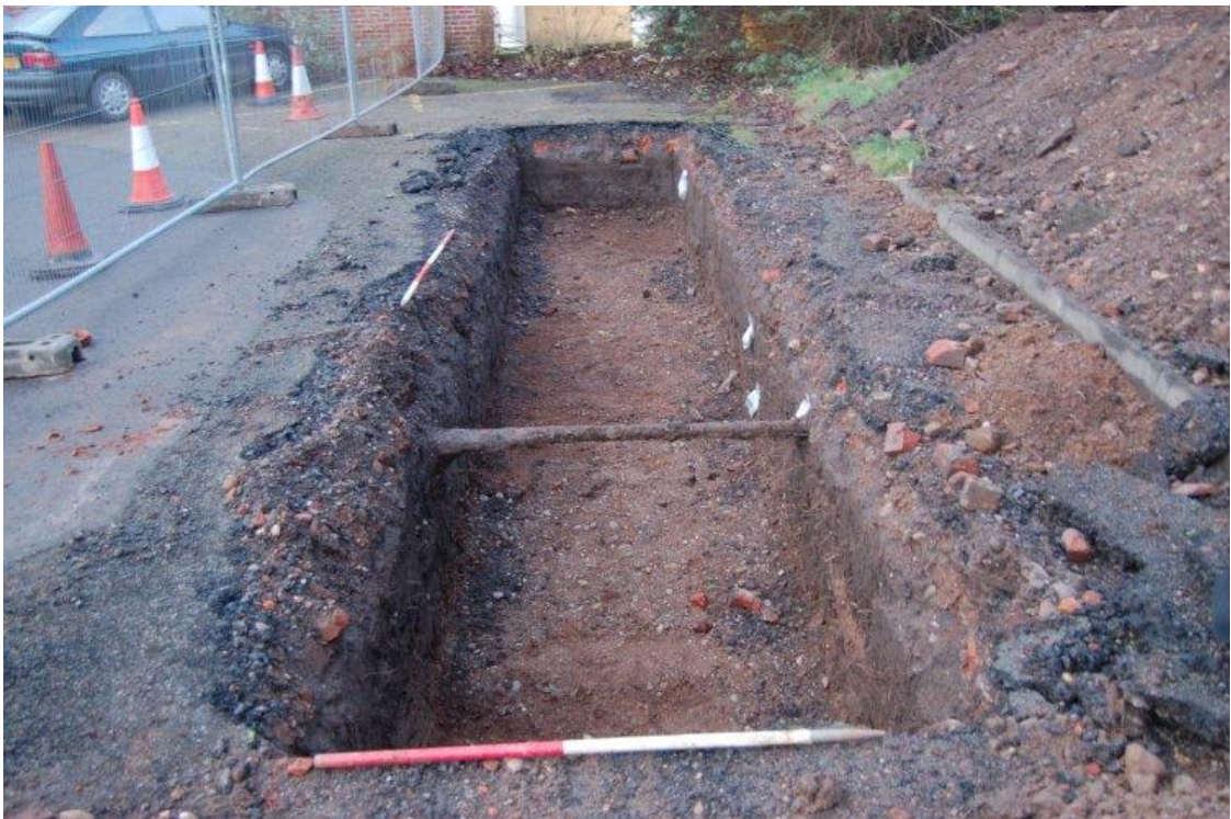
Plate 6: Trench 6, general view, scale at 1m. Facing west.