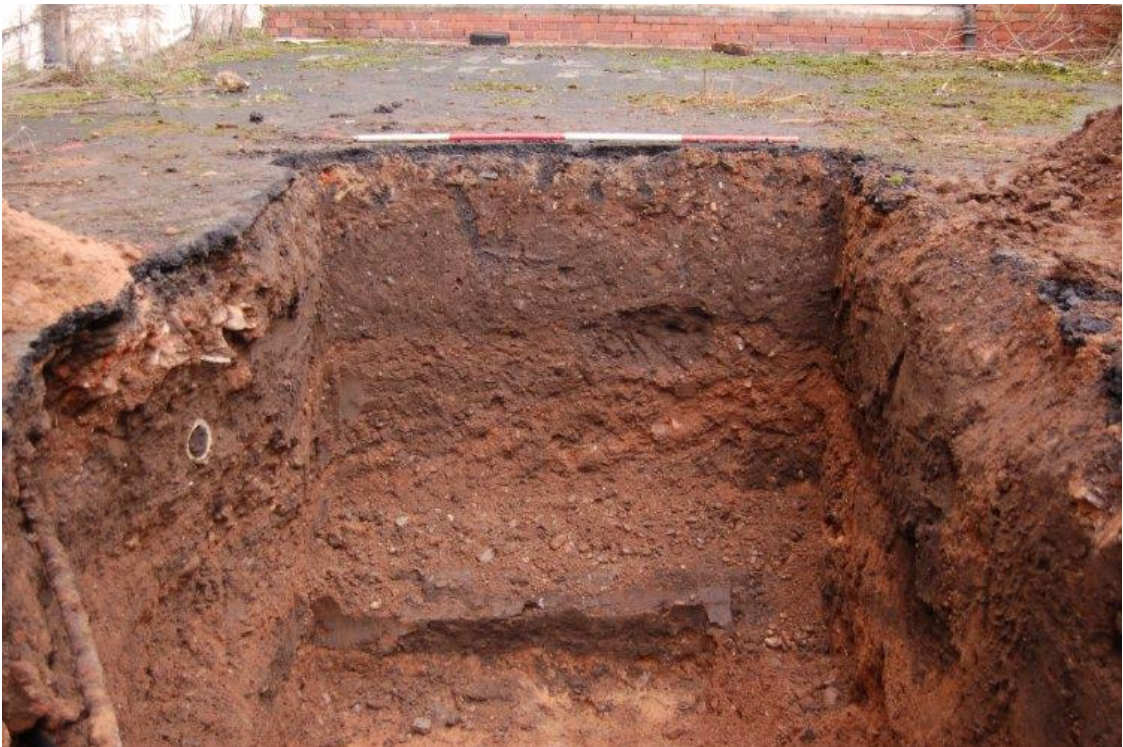
Plate 18: Eastern end of Trench 15, showing extensive modern made ground, directly overlying natural deposits, scale at 2m. Facing east.