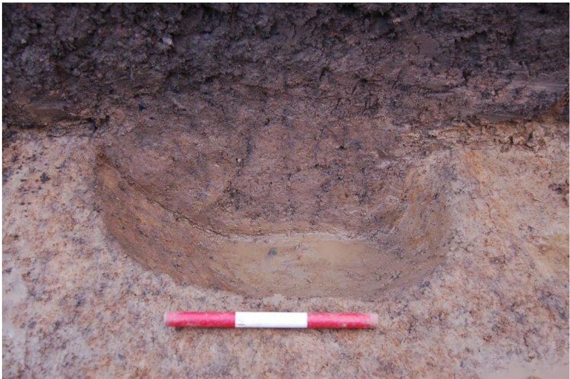
Plate 30: Trench 25, partially exposed pit cut (2517), scale at 0.3m. Facing west.