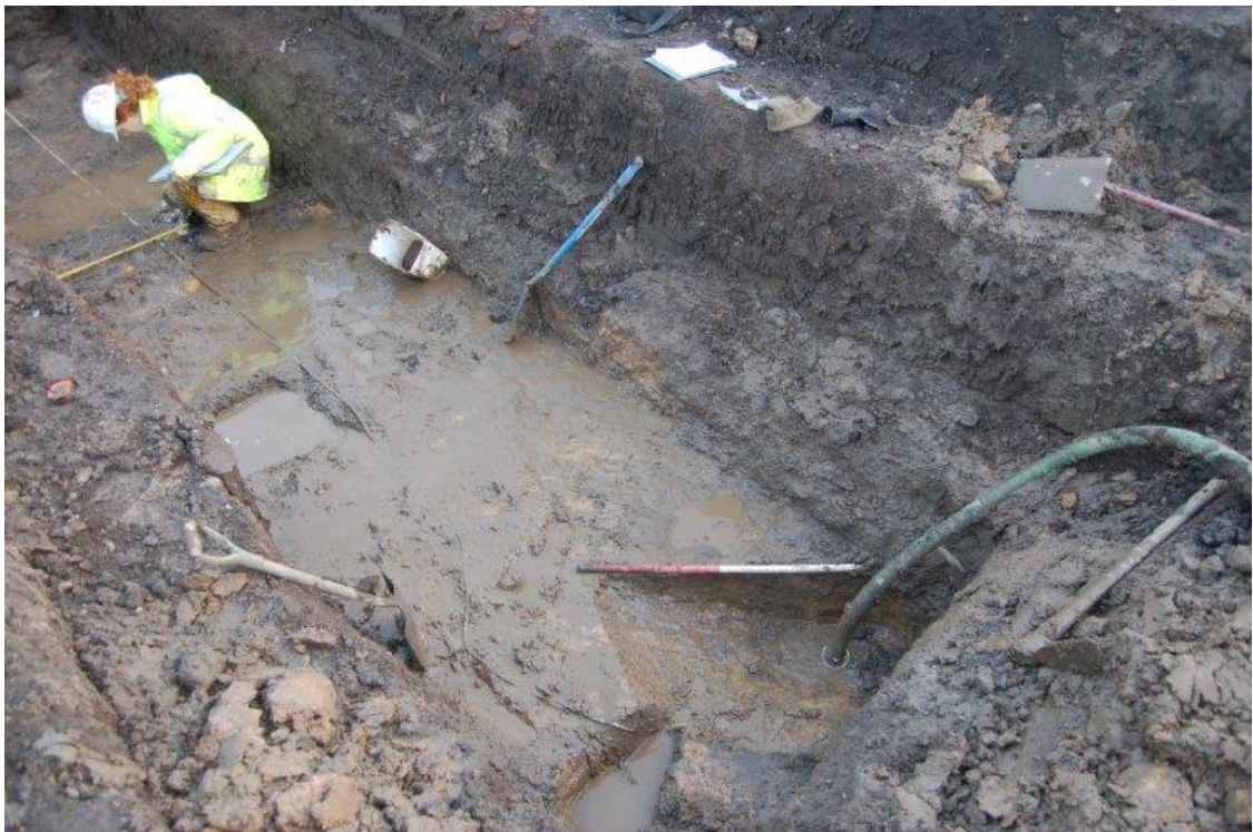
Plate 24: Trench 21, circular Roman pit (2112) below scale, pit (2109) in centre of trench being recorded, scale at 1m. Facing south-east.