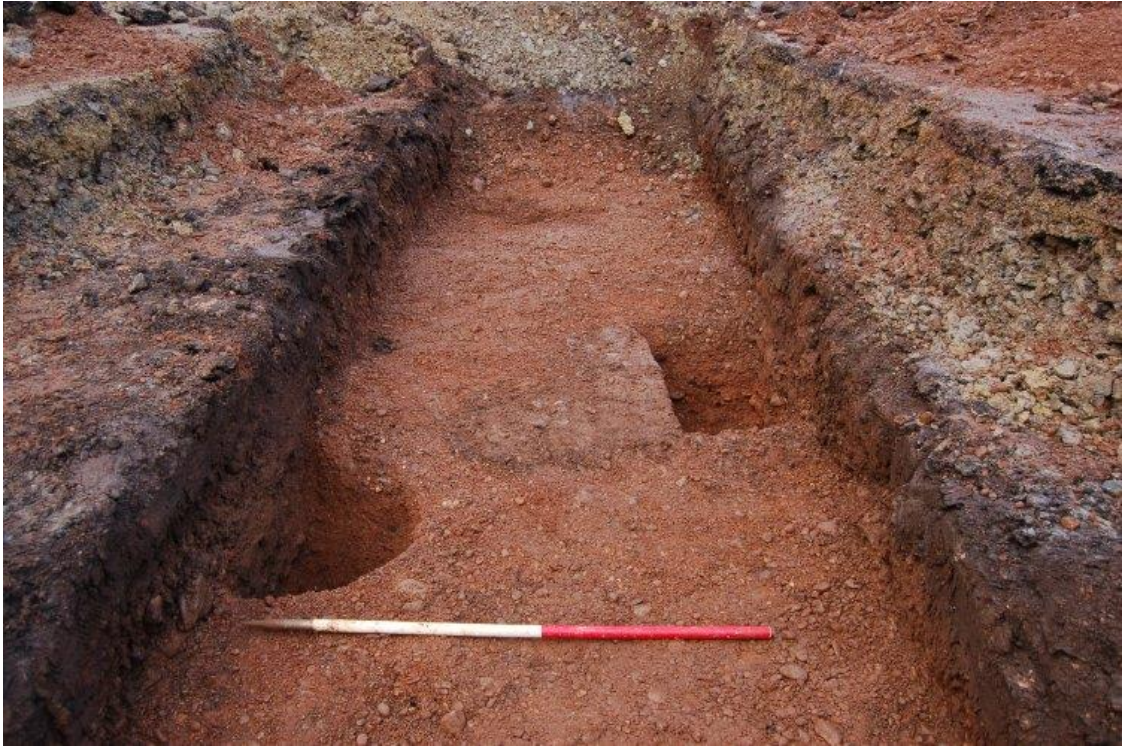
Plate 11: Trench 10, general view of features (1011, 1014) scale at 1m. Facing north.