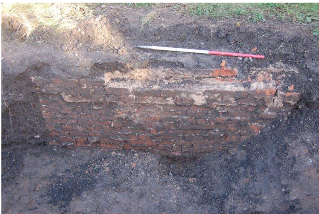
Plate 10: Brick structure (909) to the southeast end of Trench 9, scale at 1m. Facing east.