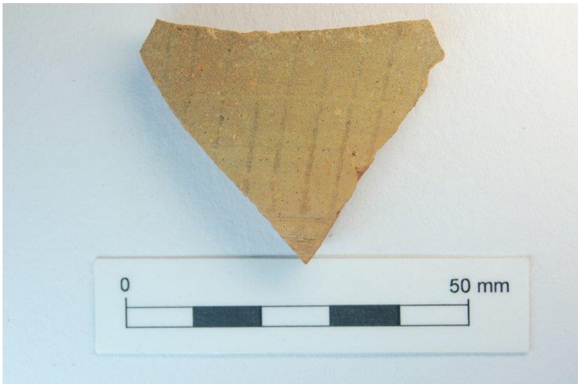
Plate 35: Roman Severn Valley Ware, with rare 'pencil' decoration (2305).