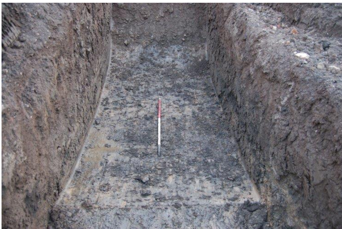
Plate 25: Eastern end of Trench 21 showing extensive mixed alluvial clay deposit (2113), scale at 1m. Facing east.