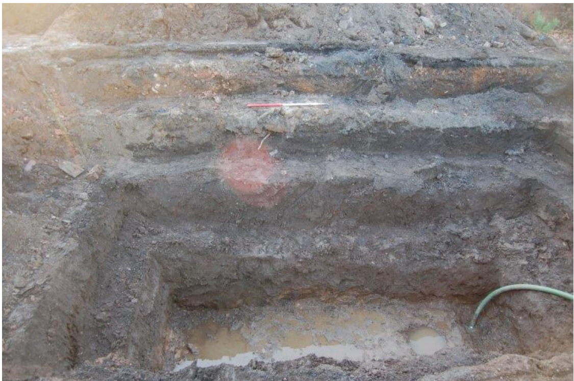
Plate 28: General view of Trench 24, mixed alluvial clay (2406) visible at base of trench, scale at 1m. Facing west.