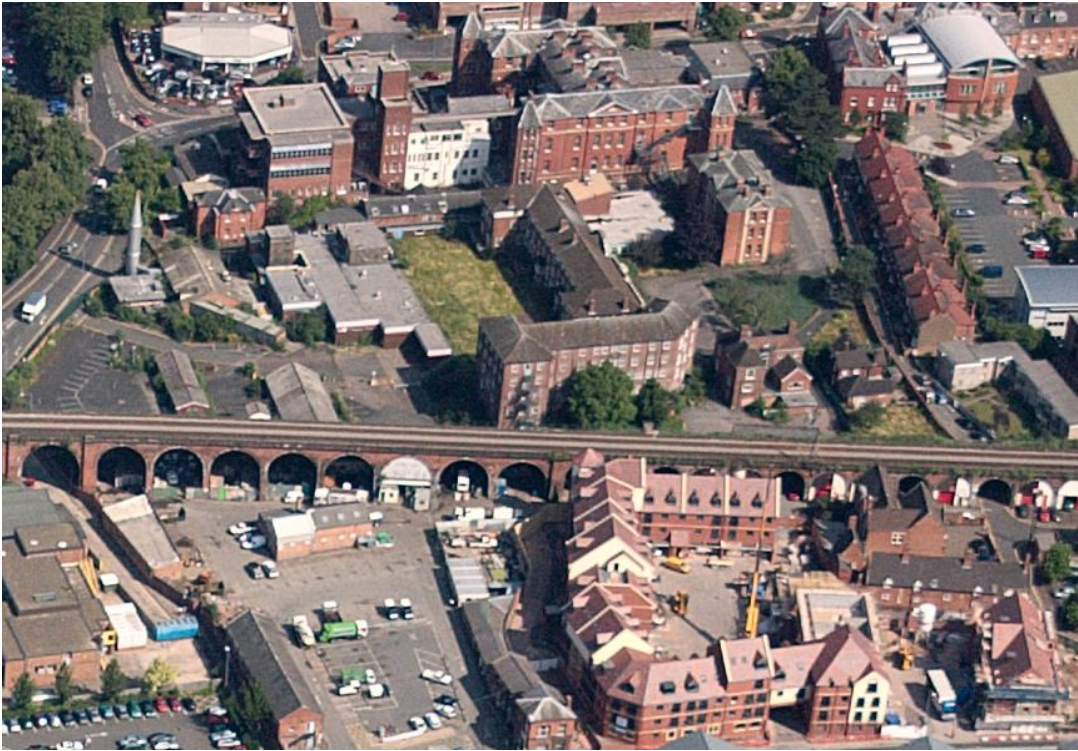
Plate 1: General view of the site, the former Royal Worcester Infirmary is to the top of the photograph, beyond the railway viaduct. Facing north.