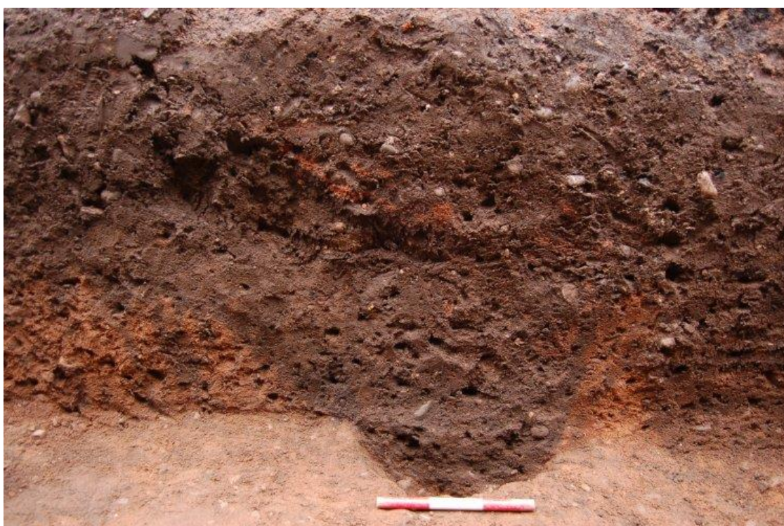
Plate 14: Trench 12, circular pit/post hole (1218), with secondary pit (1227) partially visible to left, scale at 0.3m. Facing north.