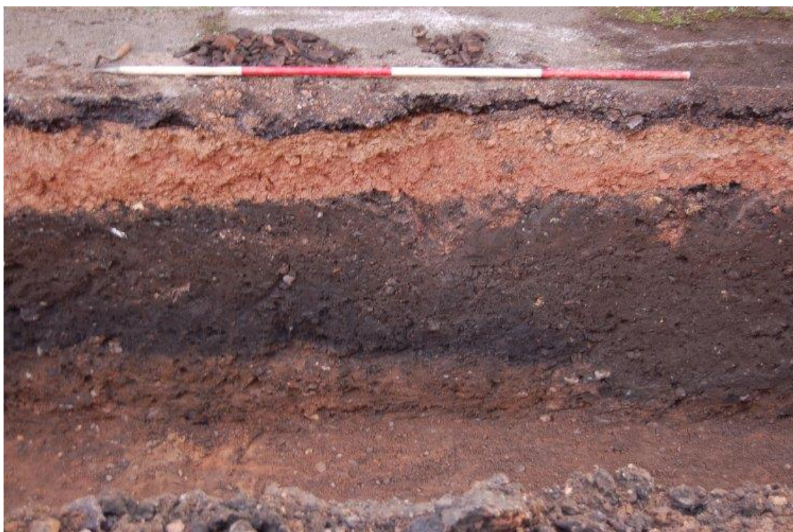
Plate 13: Trench 12, dark brown/black Roman deposit (1204/1208) visible in centre of section, to the right this deposit has been truncated by the later, medieval pit cut (1312), scale at 2m. Facing south.