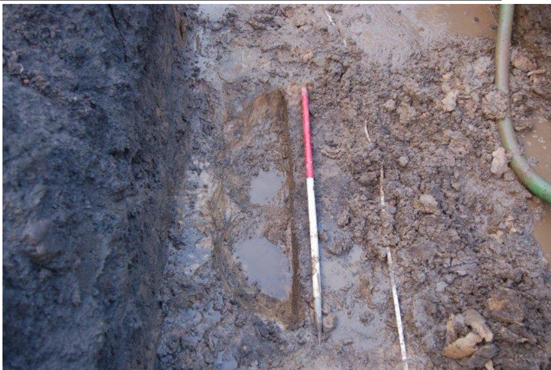
Plate 31: Trench 26, circular pit cut (2615) below north/south aligned linear ditch (2613), scale at 1m. Facing west.