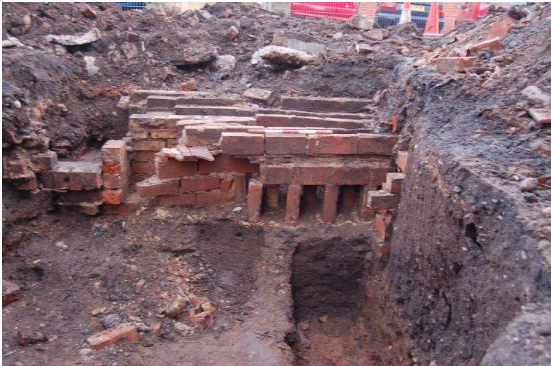
Plate 15: Trench 12, early Victorian brick structure (1320), northern elevation showing brick channels raised on brick tiers, scale at 0.5m. Facing south.