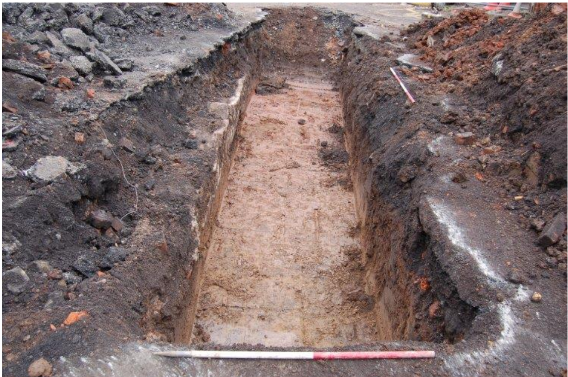
Plate 22: General view of Trench 20, scale at 1m. Facing south-east.