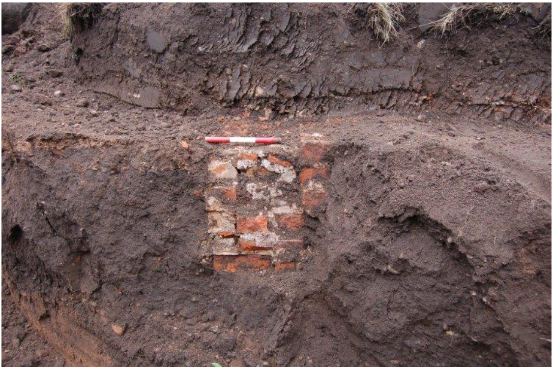
Plate 12: Trench 11, east/west aligned brick wall (1105), scale at 0.3m. Facing west.