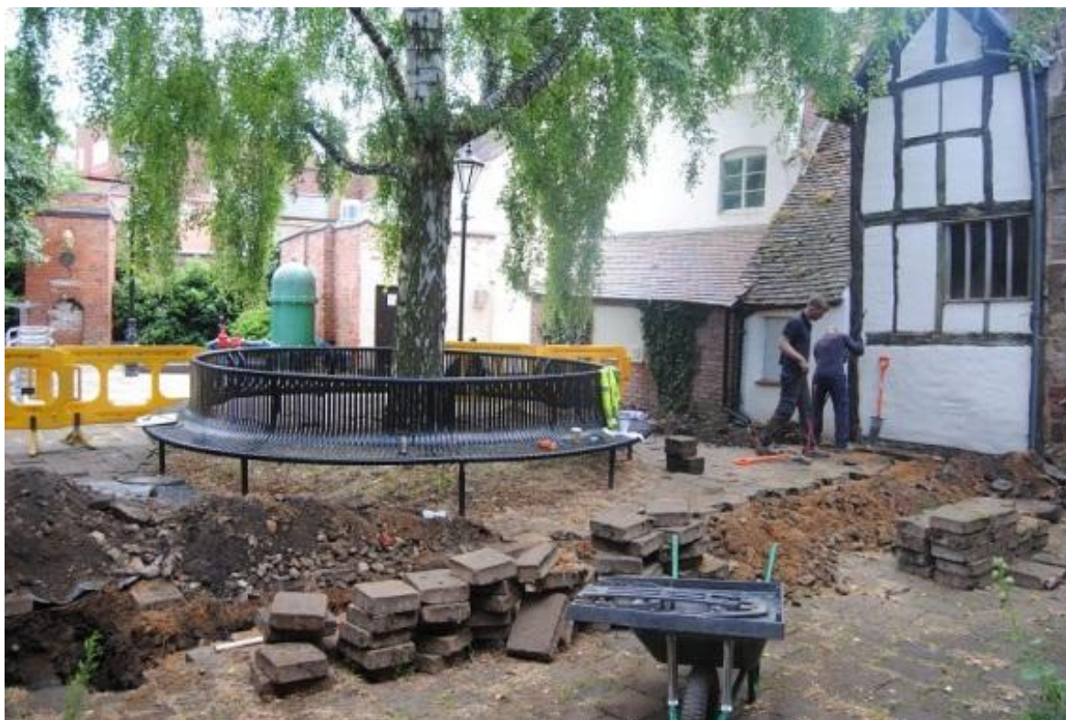
Plate 1 The site looking south-east