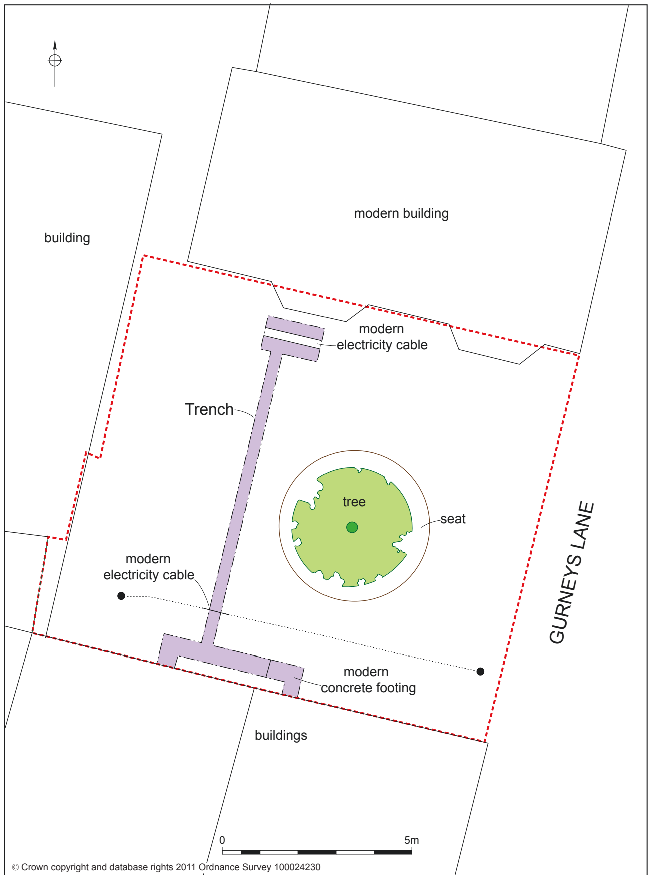
Trench location plan