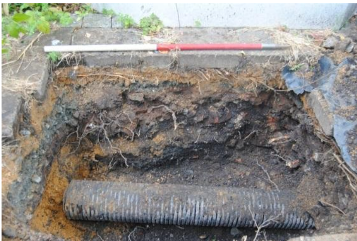
Plate 2 Deposits observed within the trench