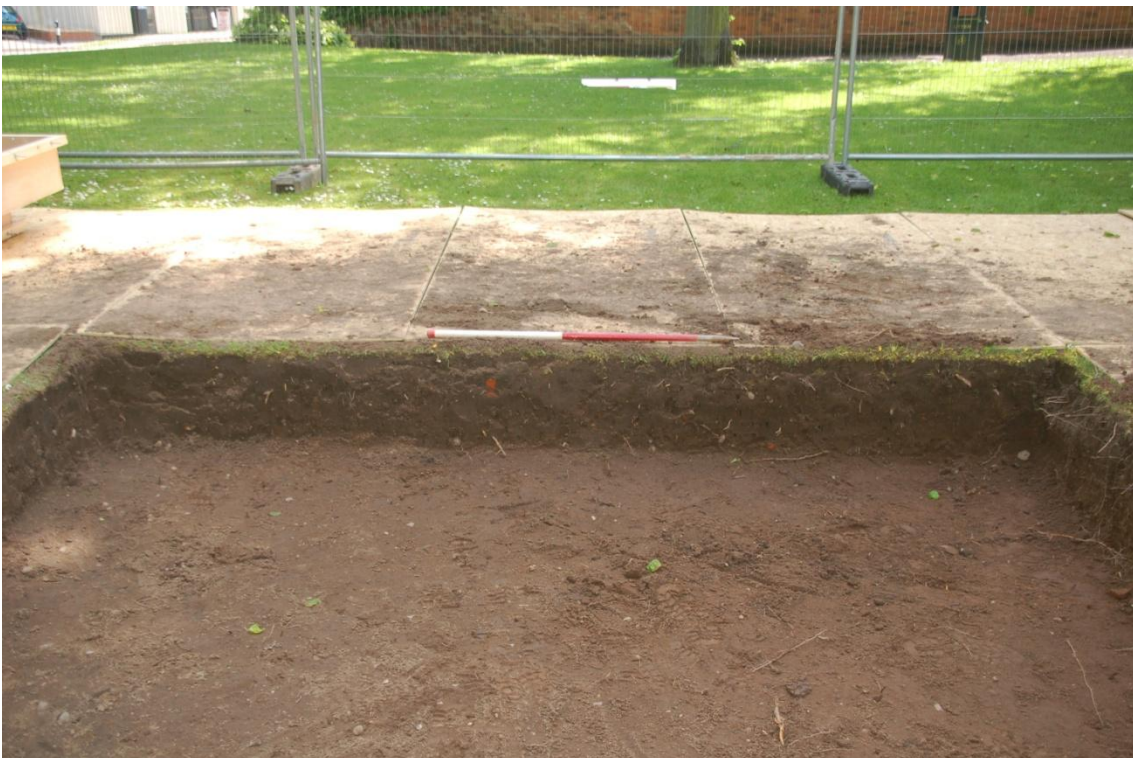
Plate 2. North facing section of the excavated trench.