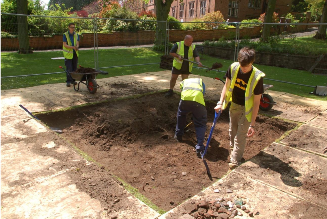
Plate 1. The trench under excavation, facing south-west.