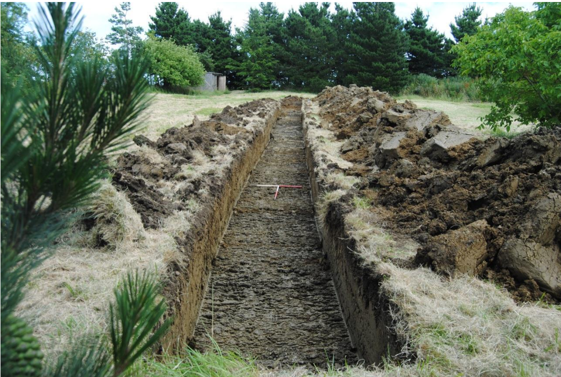
Plate 2: Trench 2, looking east