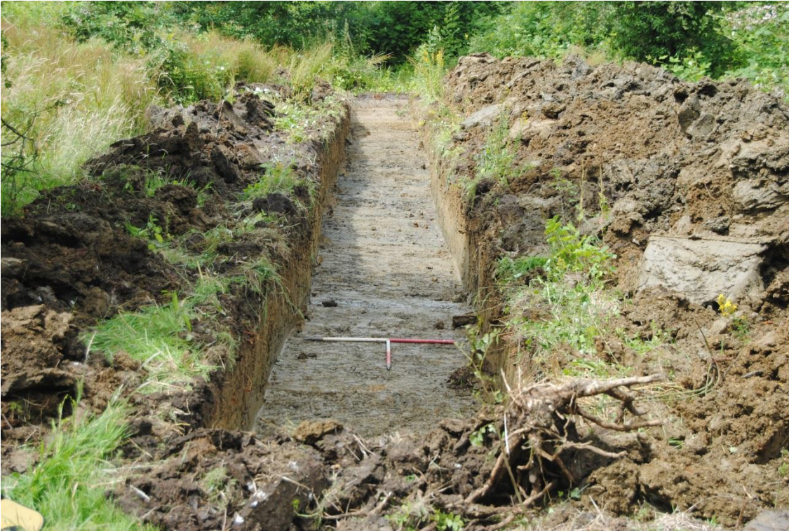
Plate 1: Trench 1, looking west