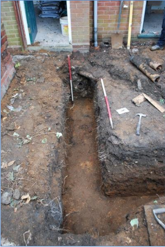
Plate 3: The north-west to south-east orientated footing showing modern ceramic pipe