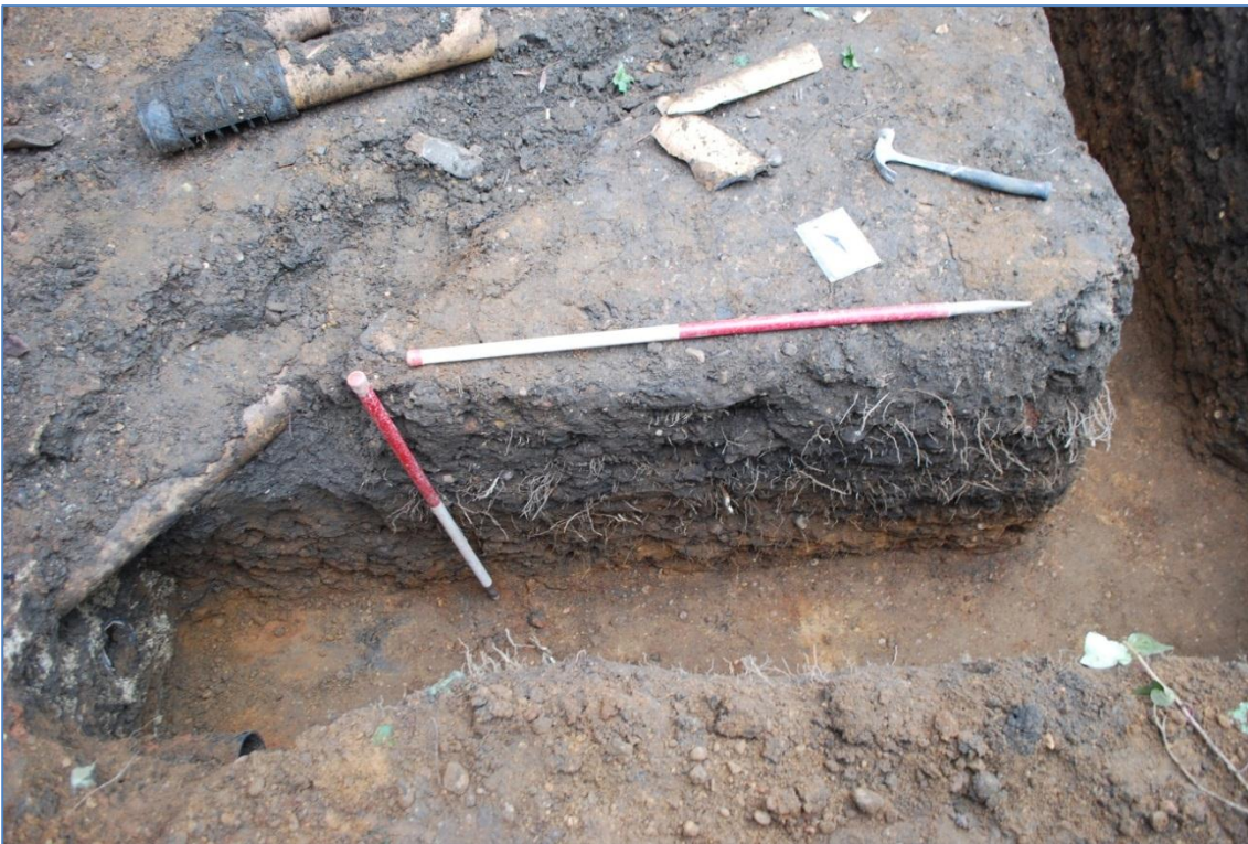
Plate 4: Trench 1, north-east facing section