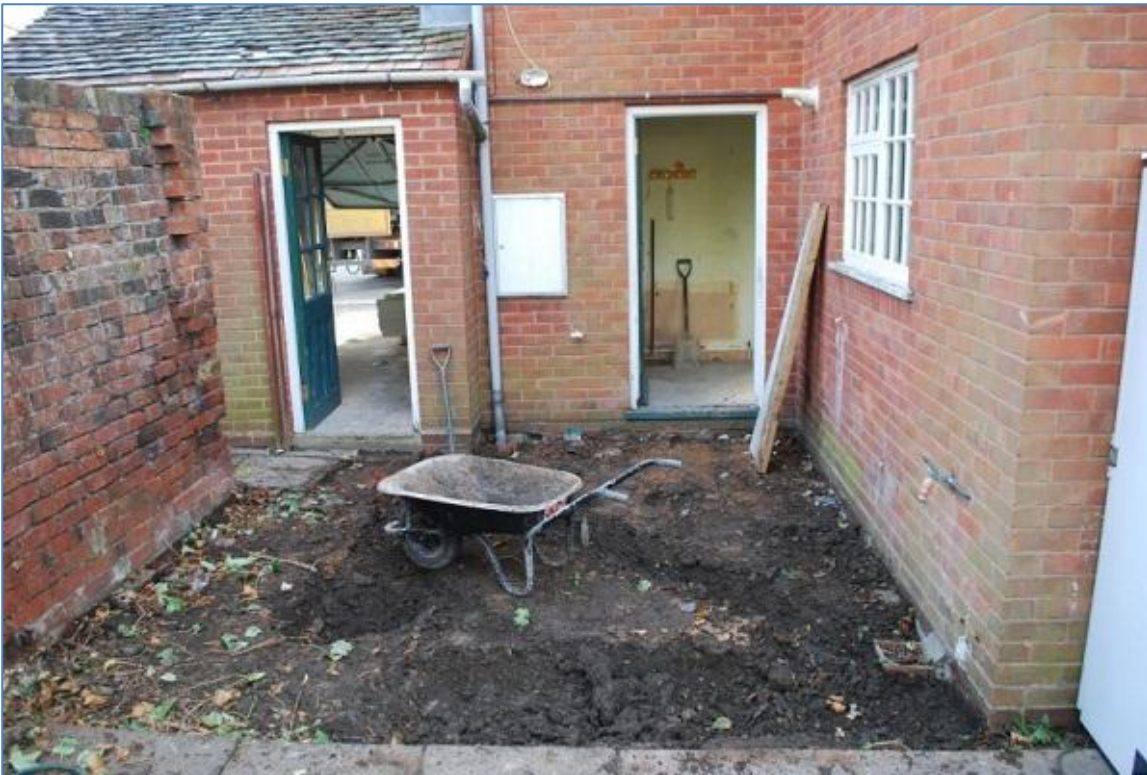
Plate 1: The site of the footings before excavation, view south-east