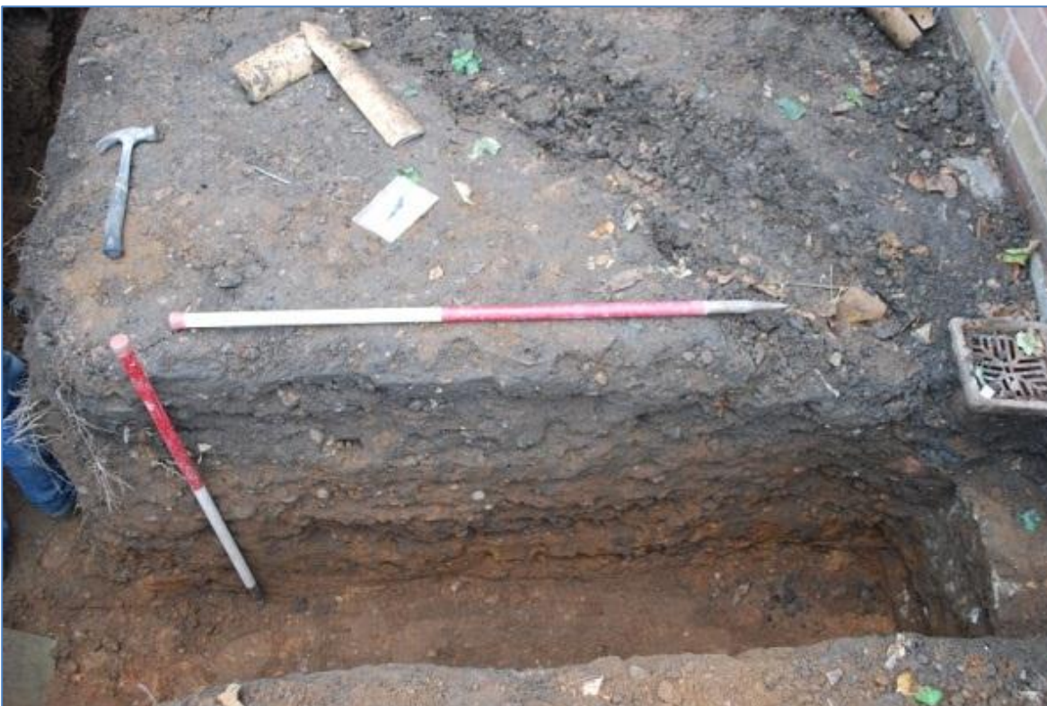
Plate 2: The north-west facing section of trench 1