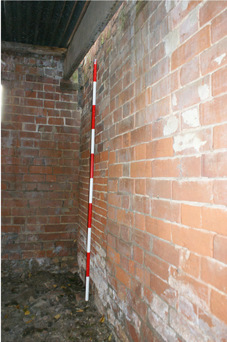
Photograph no. 22 on plan