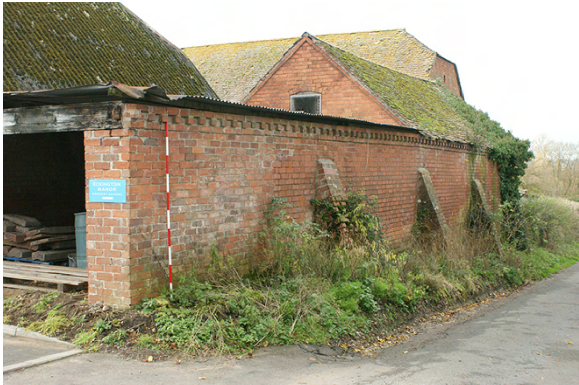
Photograph no. 9 on plan