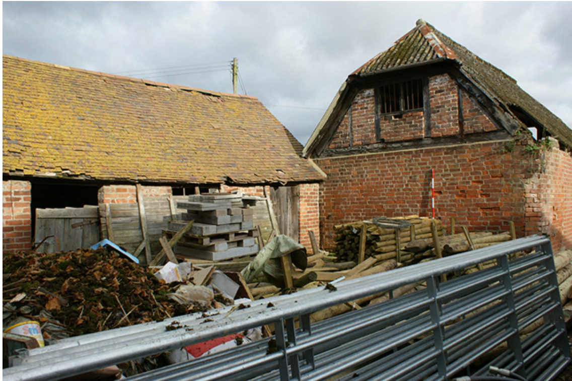
Photograph no. 41 on plan