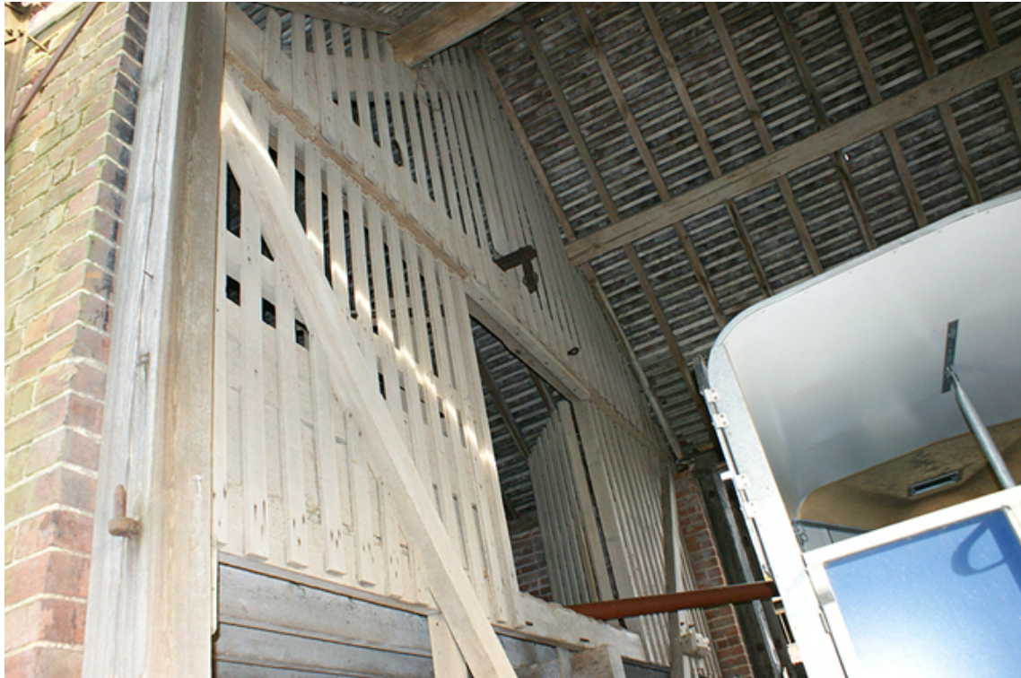
Photograph no. 78 on plan