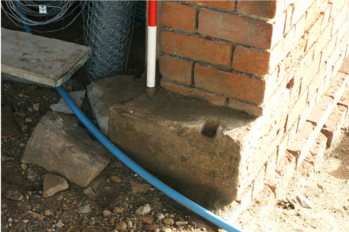
Photograph no. 67 on plan