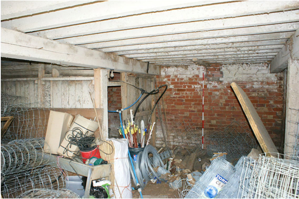
Photograph no. 72 on plan