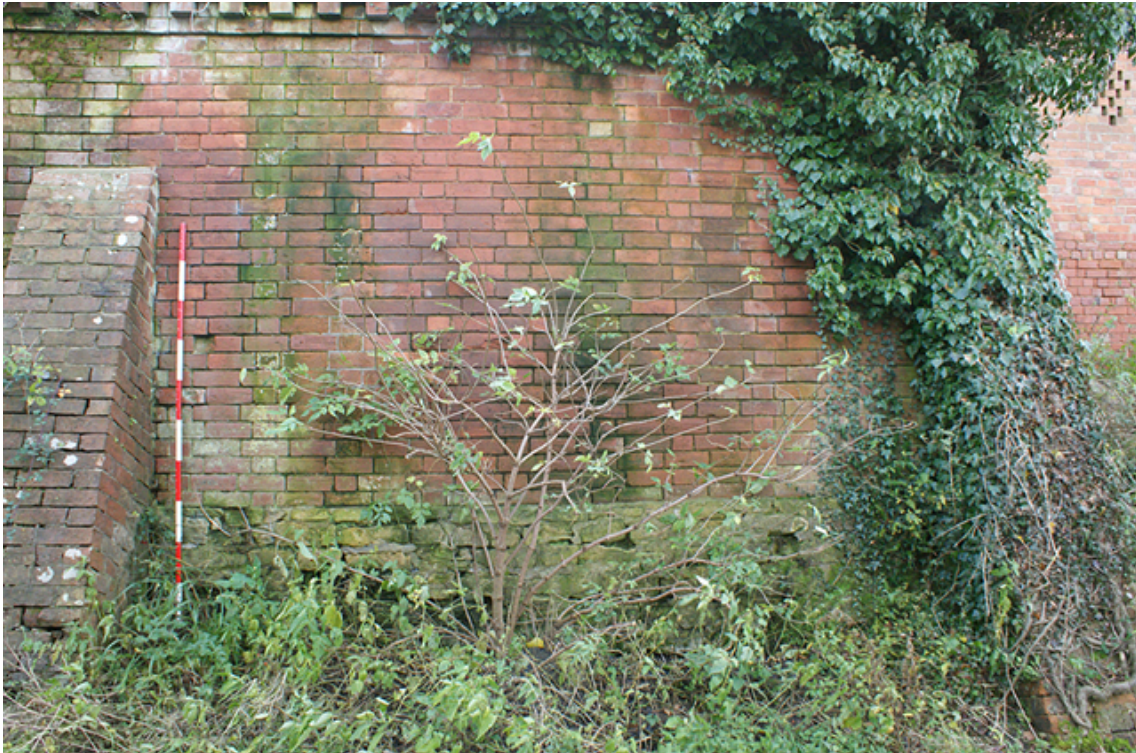
Photograph no. 13 on plan