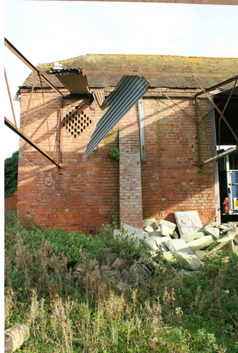
64 on plan