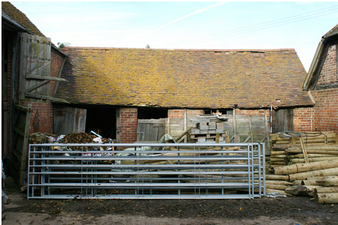
Photograph no. 42 on plan