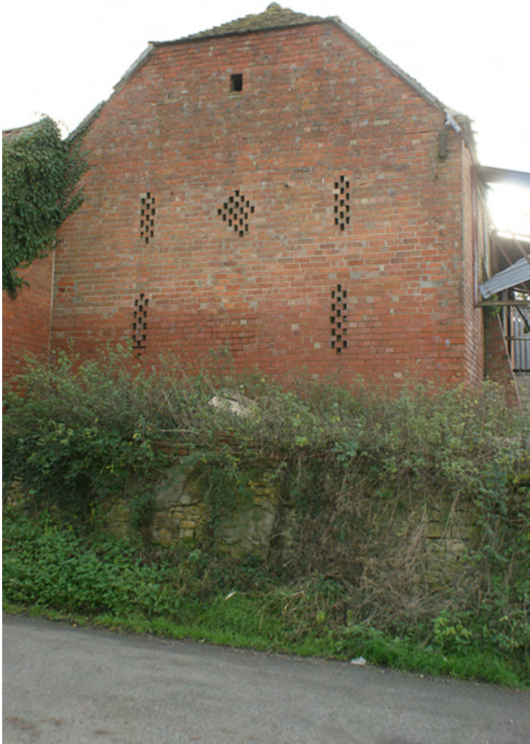
Photograph no. 11 on plan