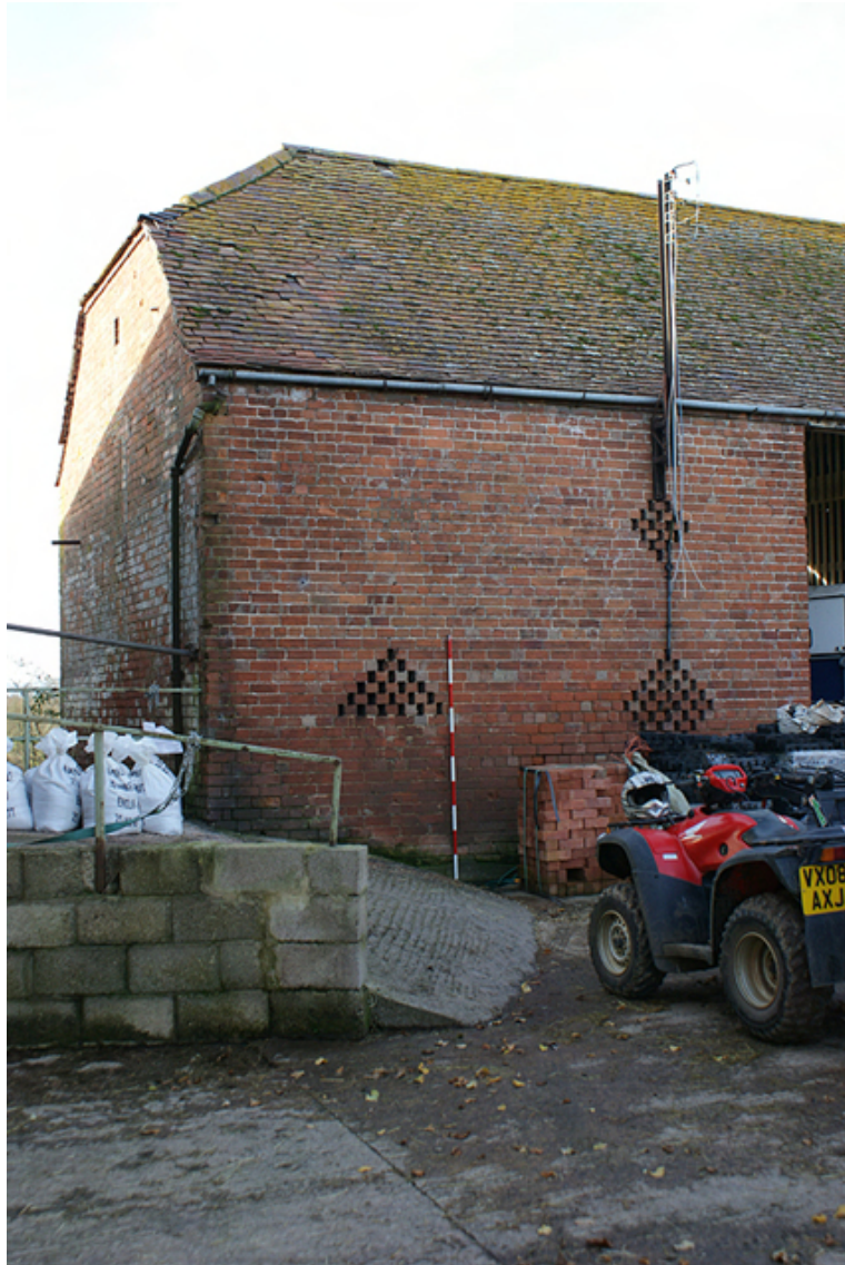
Photograph no. 57 on plan