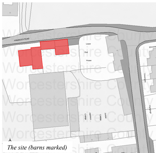
The site (barns marked)