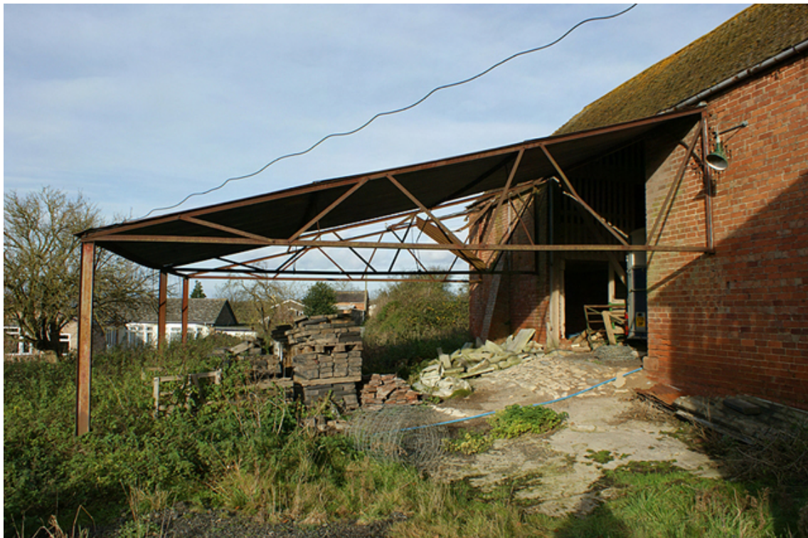
Photograph no. 62 on plan