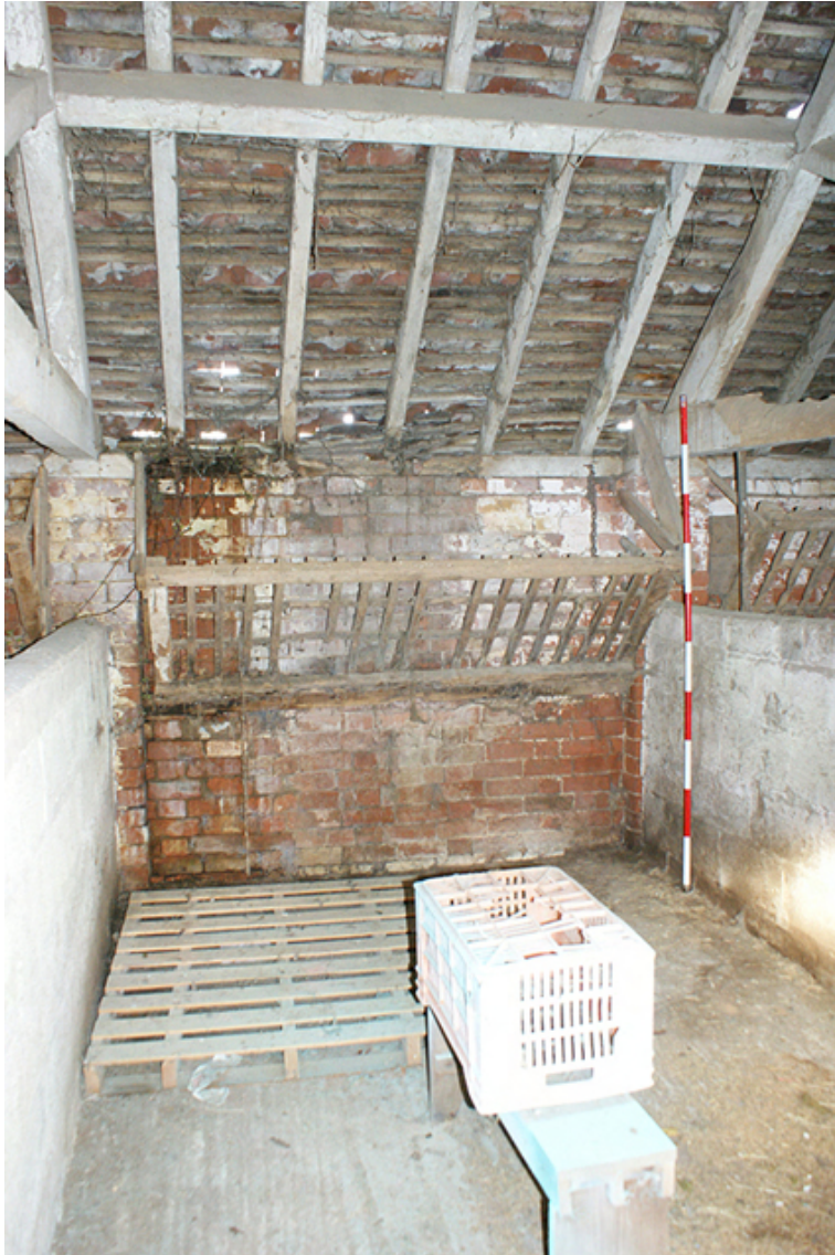
Photograph no. 47 on plan