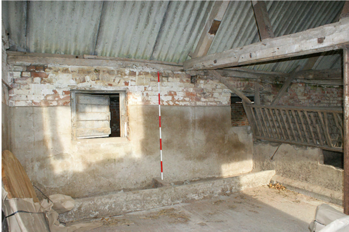
Photograph no. 32 on plan