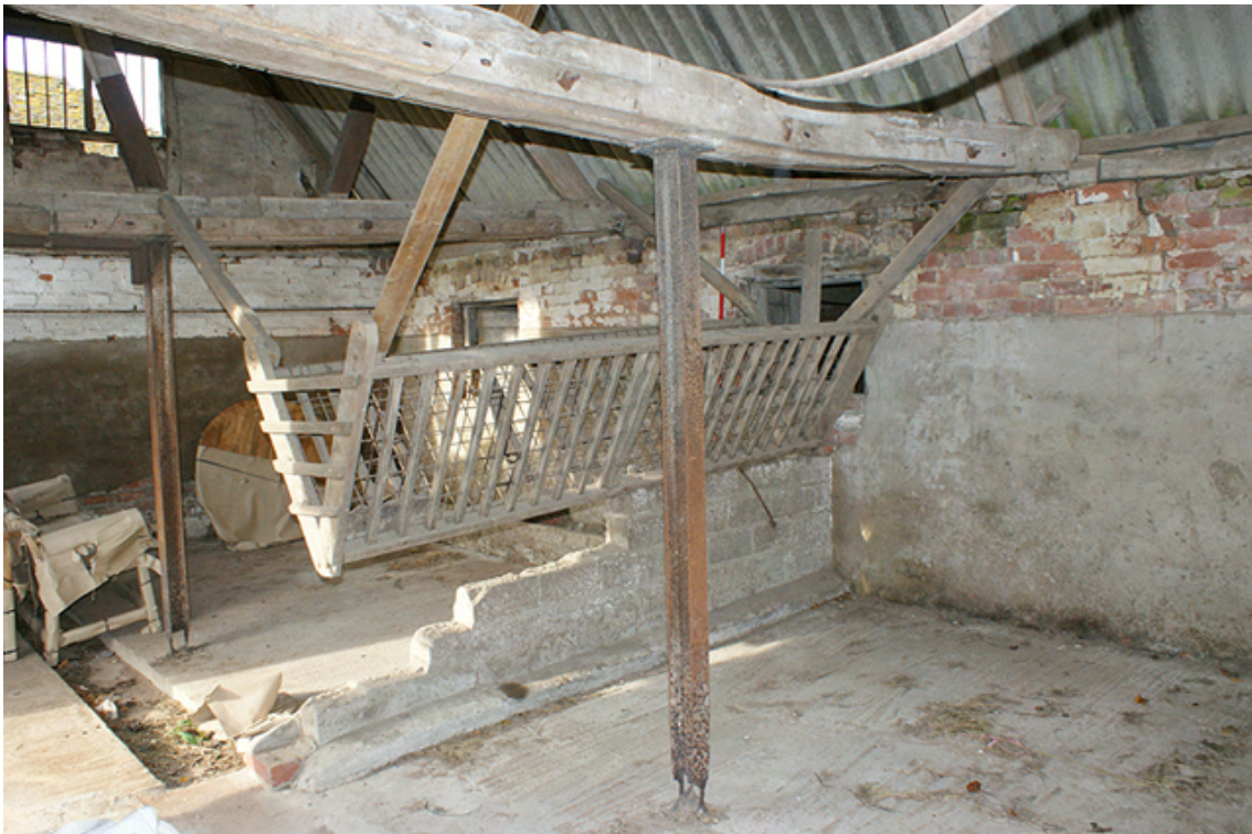
Photograph no. 35 on plan