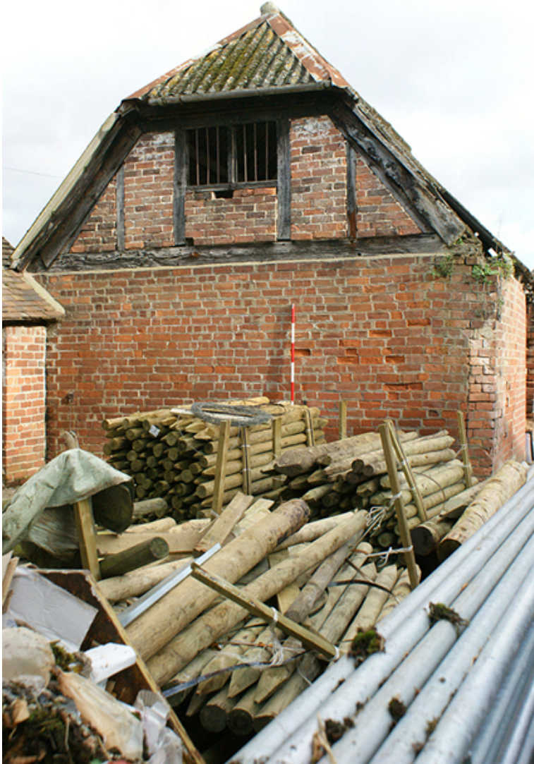
Photograph no. 40 on plan