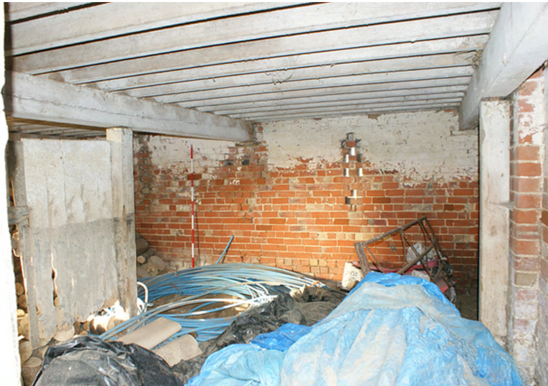
Photograph no. 75 on plan