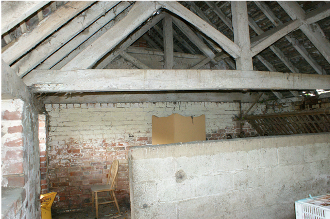
Photograph no. 45 on plan