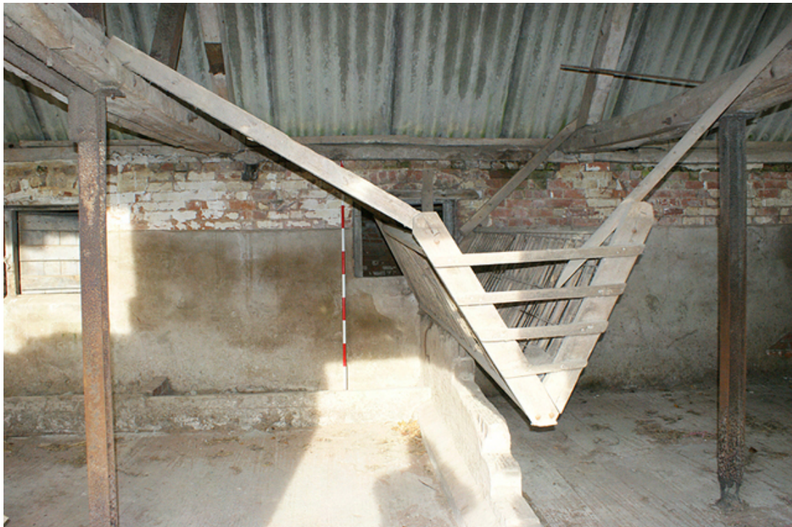
Photograph no. 33 on plan