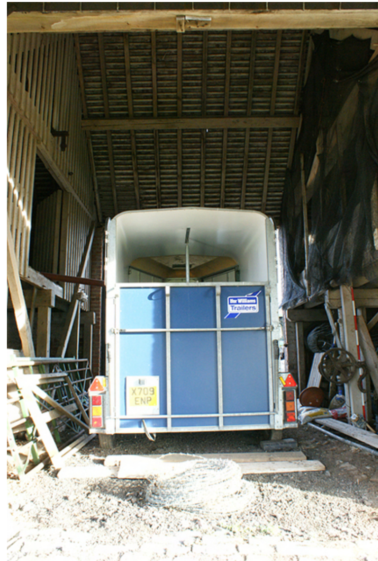
Photograph no. 69 on plan