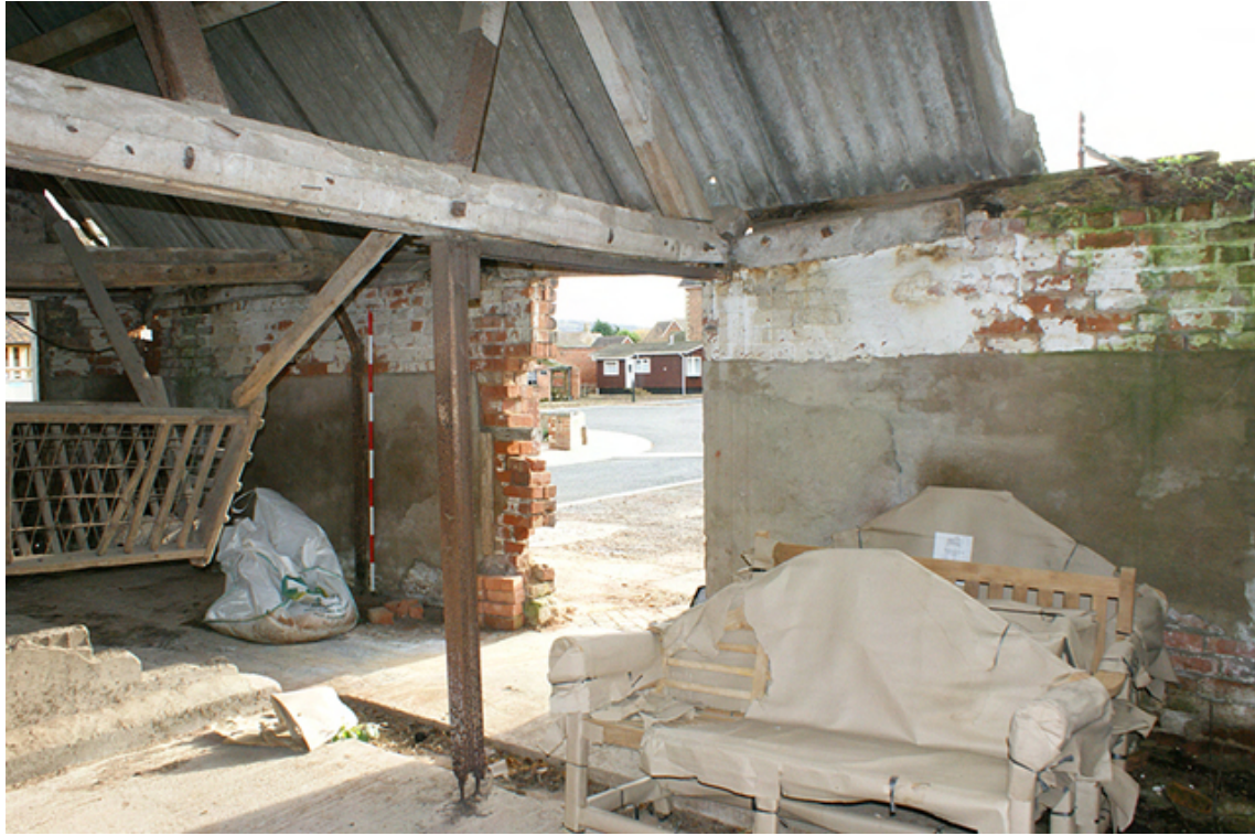
Photograph no. 36 on plan