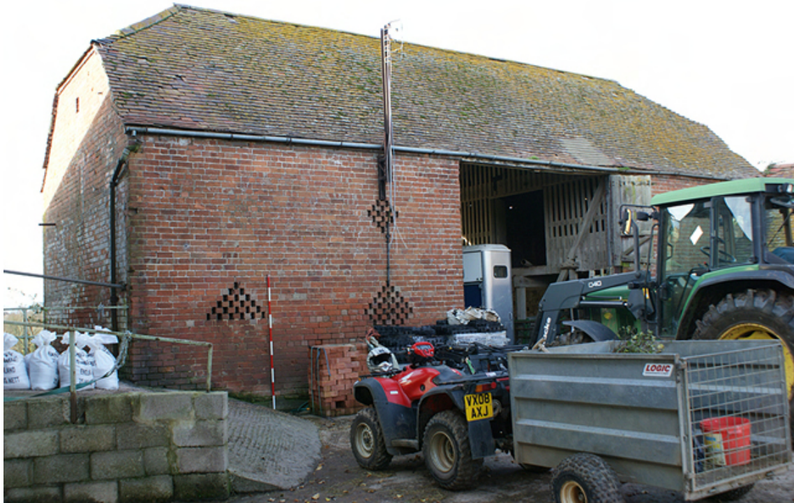
Photograph no. 56 on plan