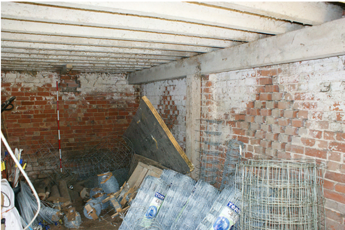
Photograph no. 73 on plan