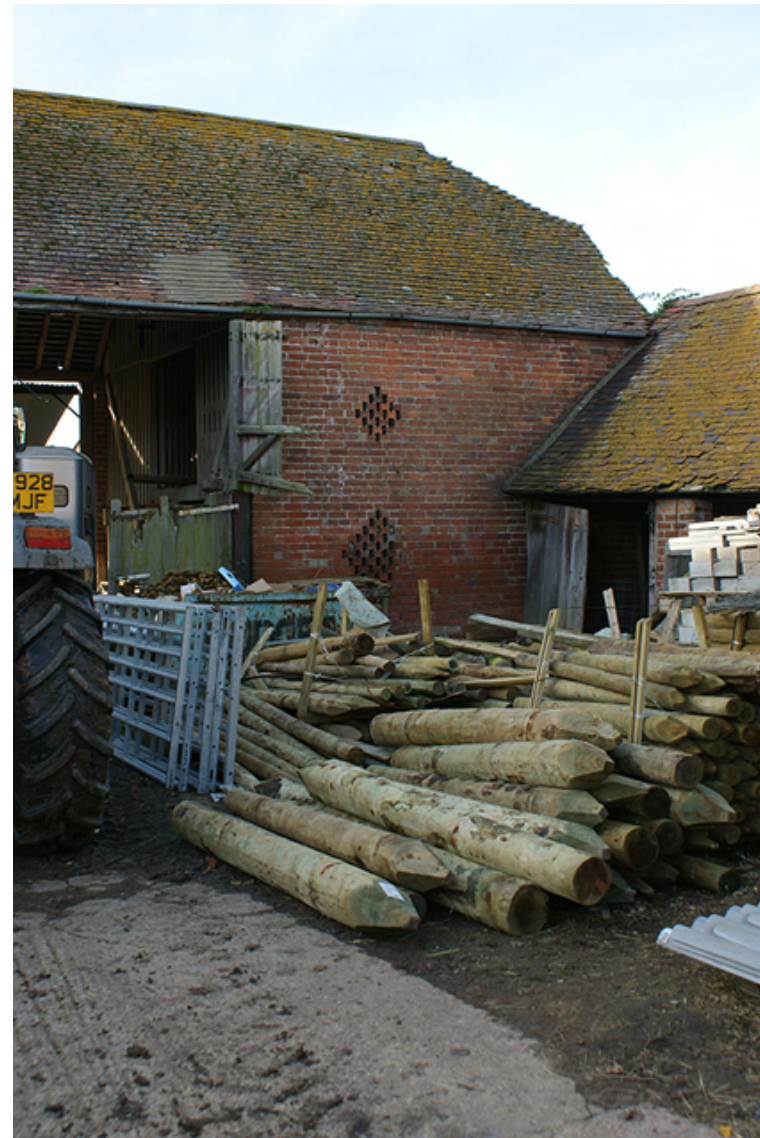
Photograph no. 58 on plan