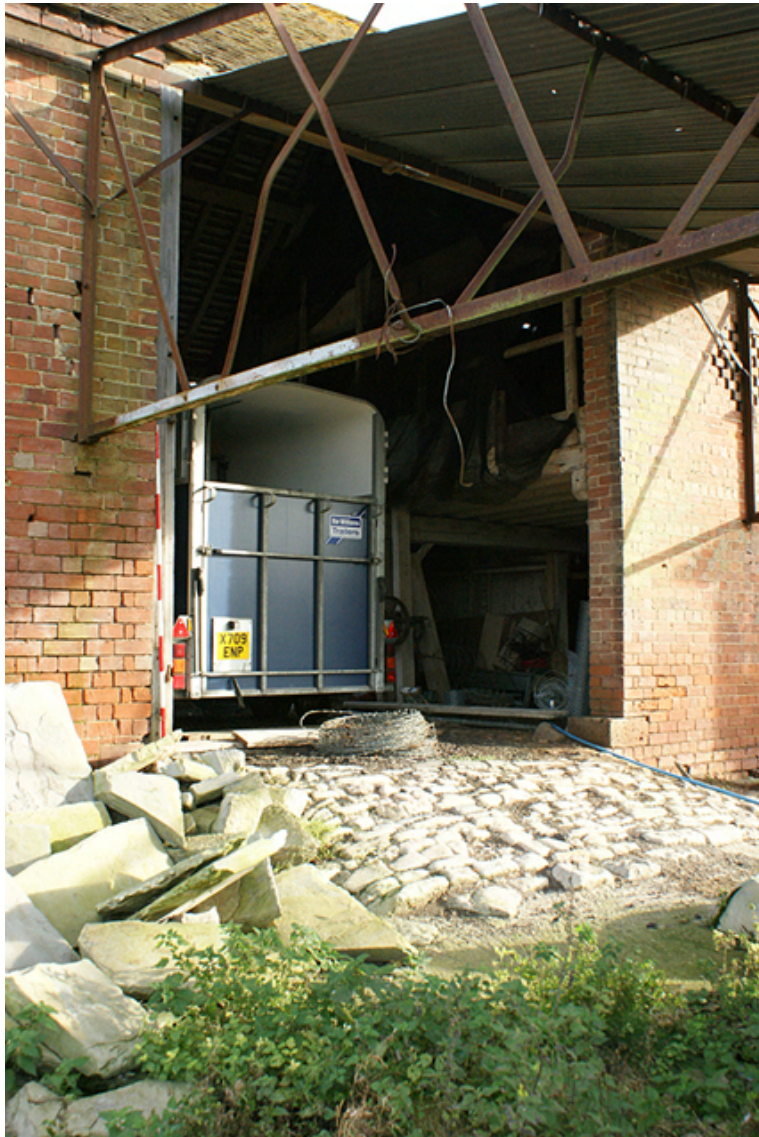
Photograph no. 66 on plan