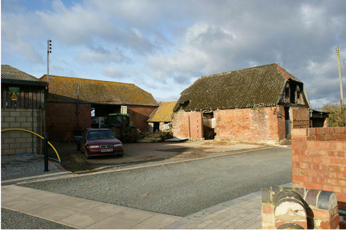
Photograph no. 1 on plan