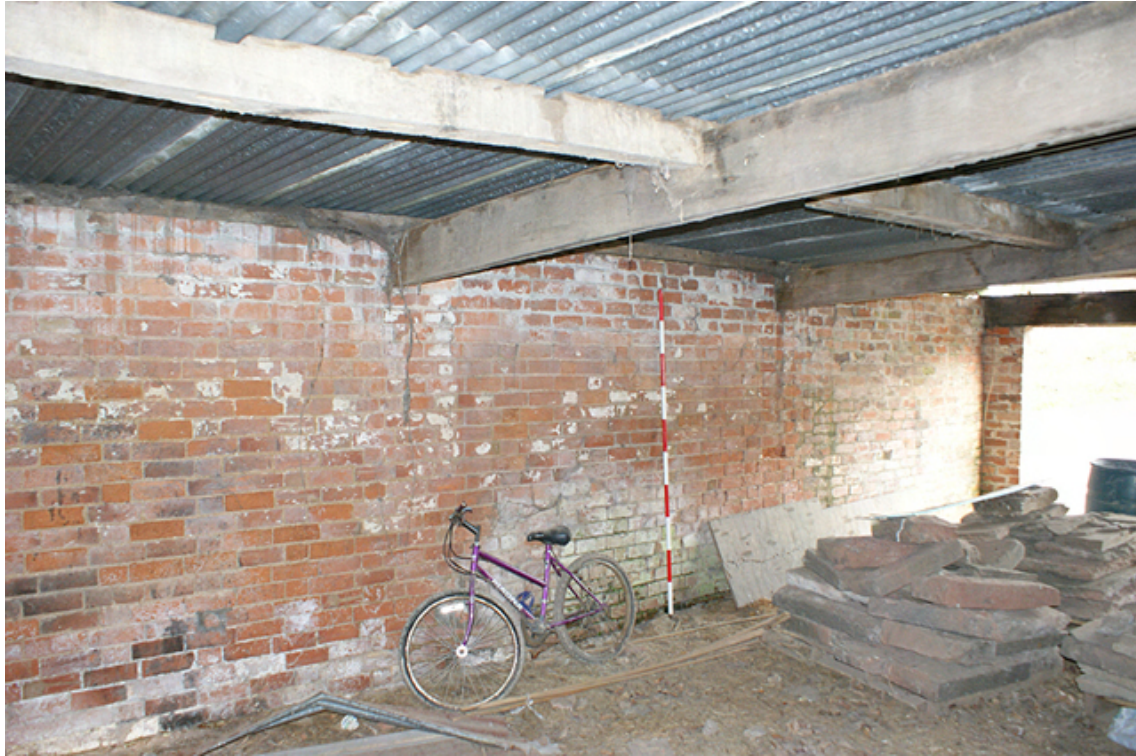
Photograph no. 25 on plan