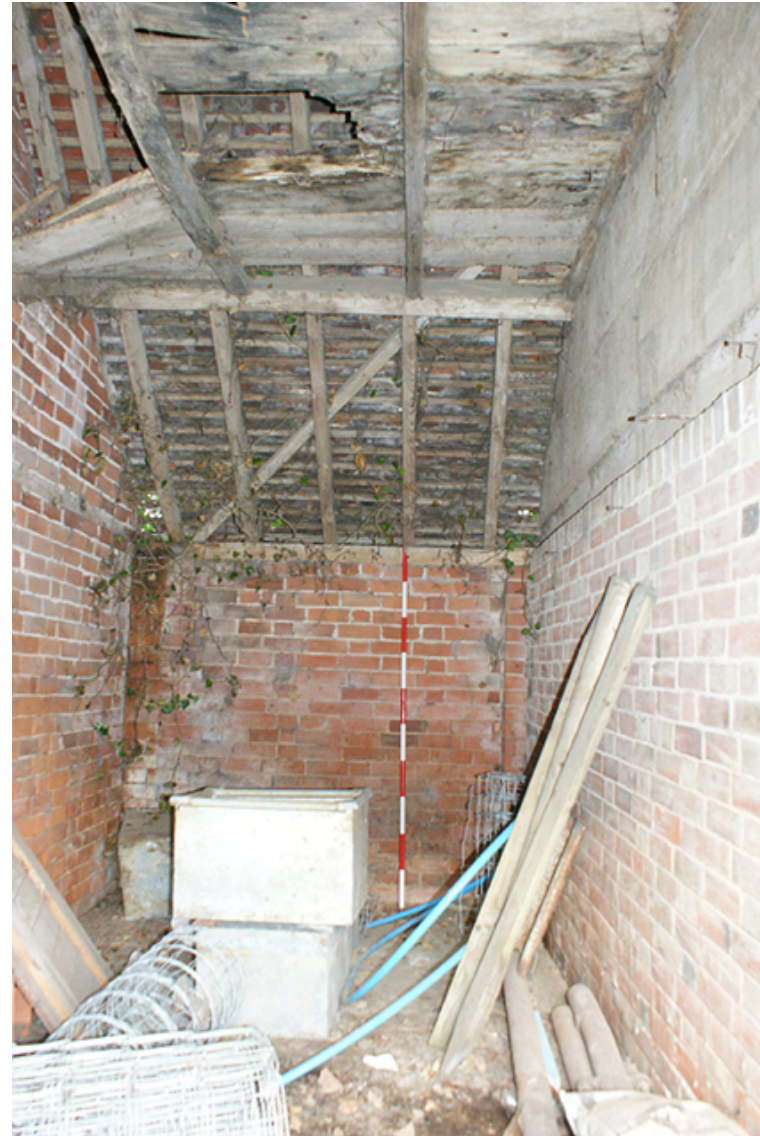
Photograph no. 53 on plan