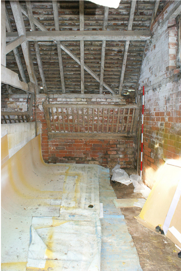
Photograph no. 43 on plan