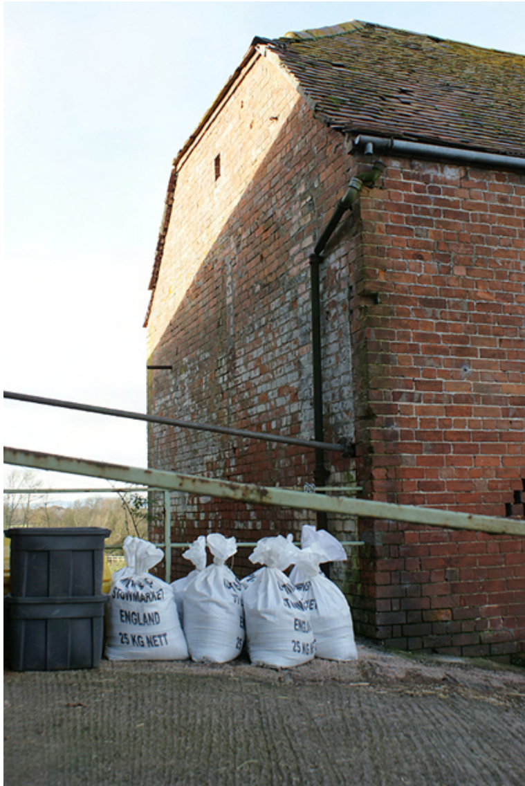
Photograph no. 60 on plan