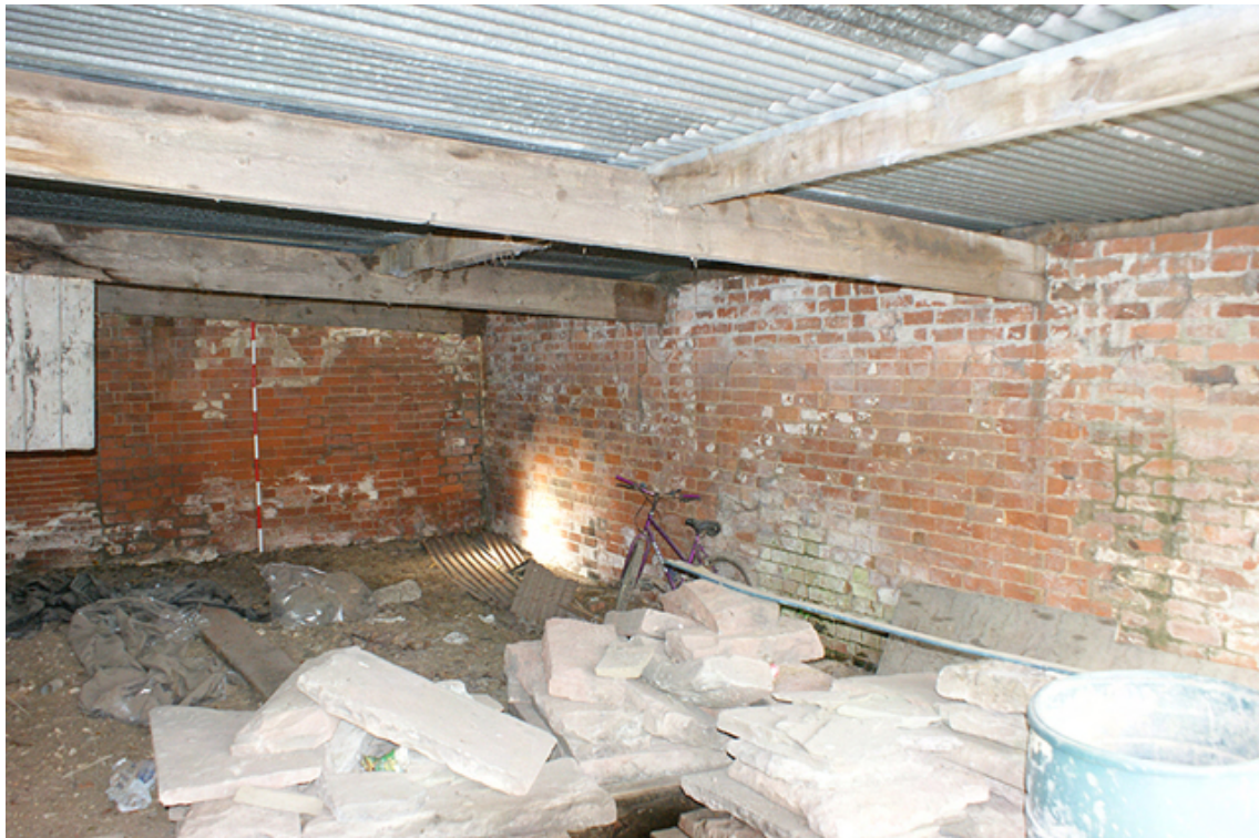
Photograph no. 19 on plan