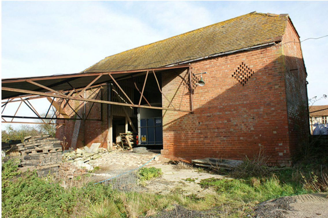
Photograph no. 61 on plan