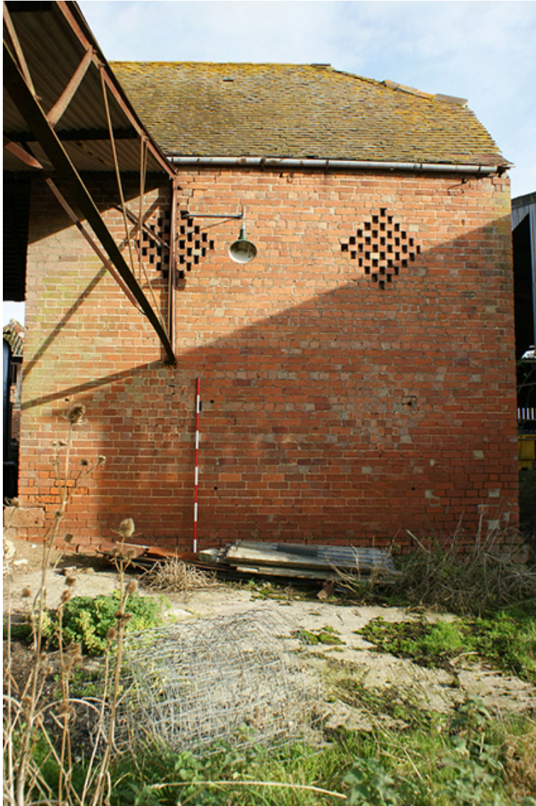
Photograph no. 63 on plan