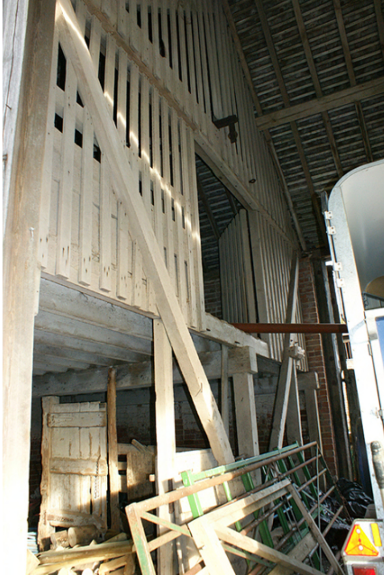
Photograph no. 77 on plan