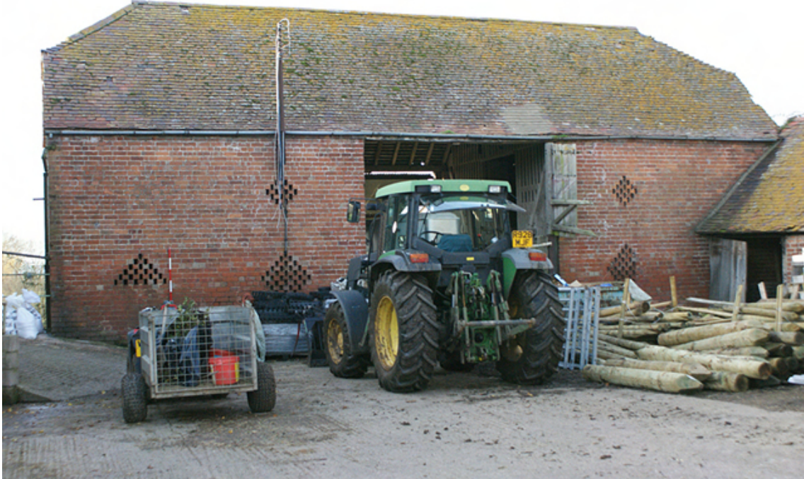
Photograph no. 59 on plan