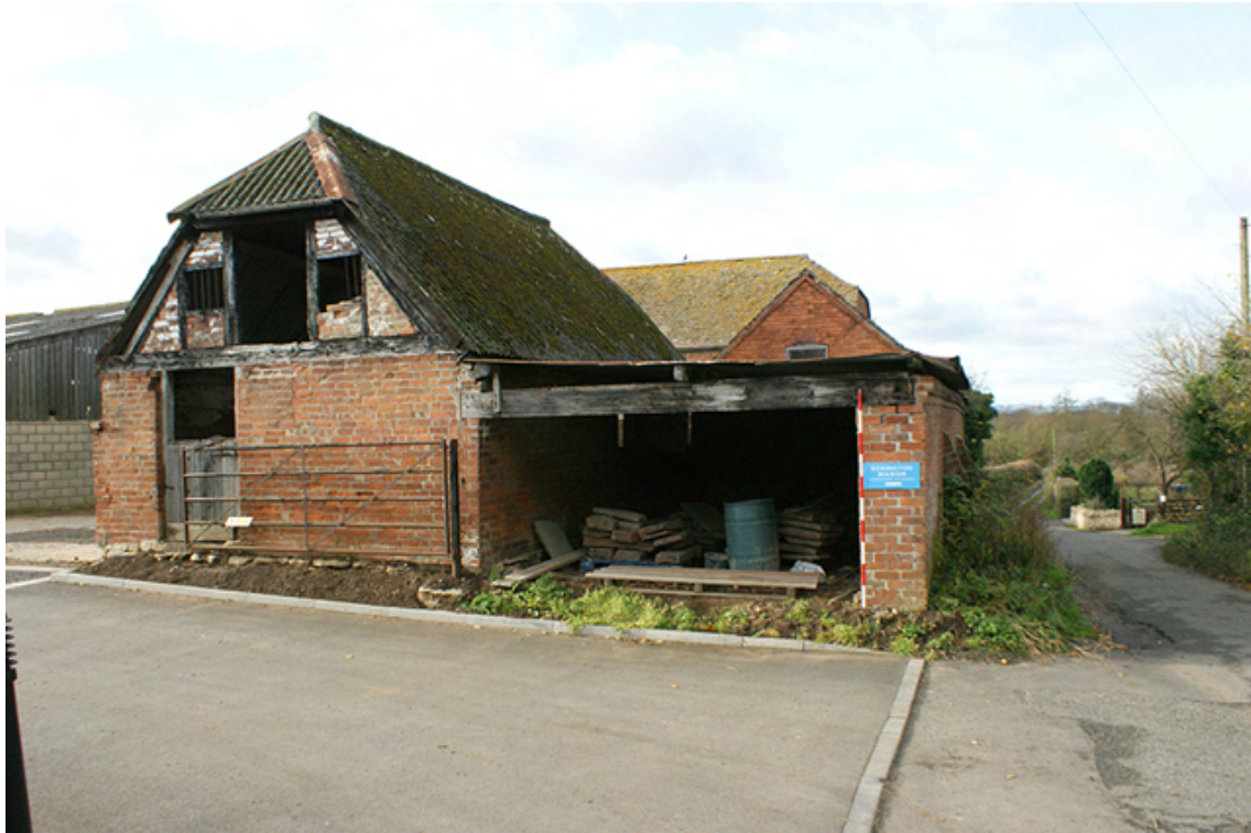
Photograph no. 6 on plan