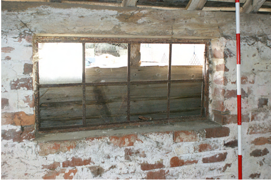
Photograph no. 49 on plan