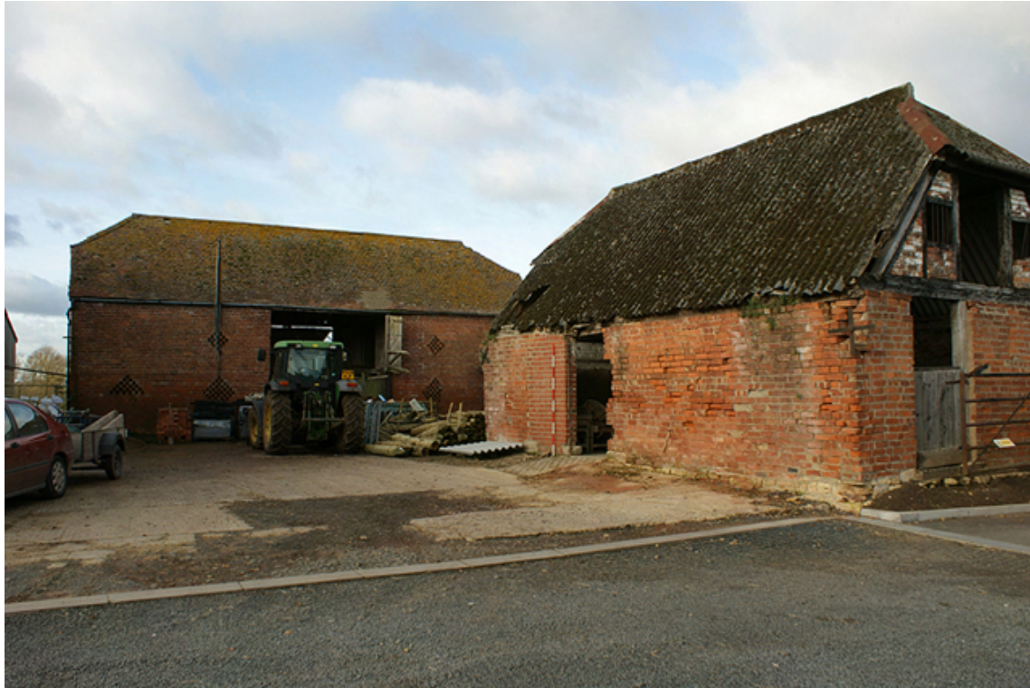
Photograph no. 3 on plan