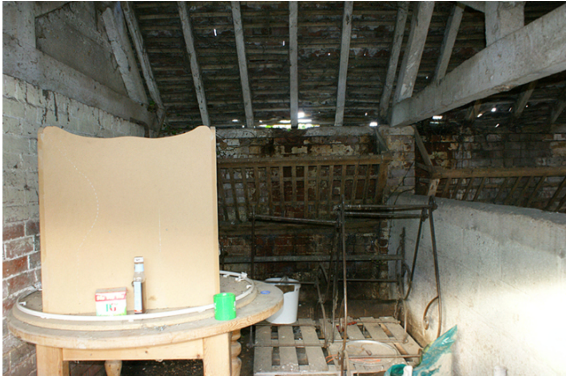
Photograph no. 51 on plan