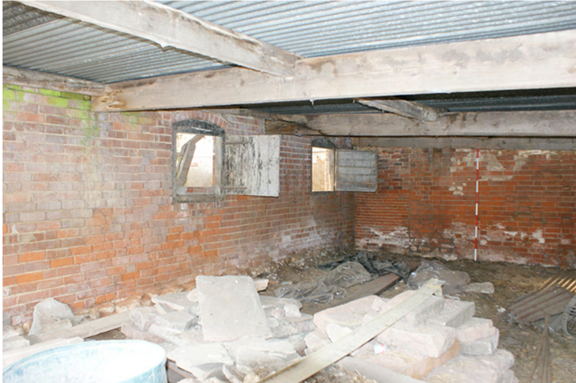
Photograph no. 18 on plan