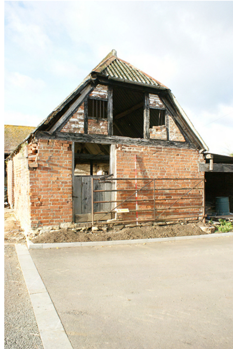
Photograph no. 5 on plan