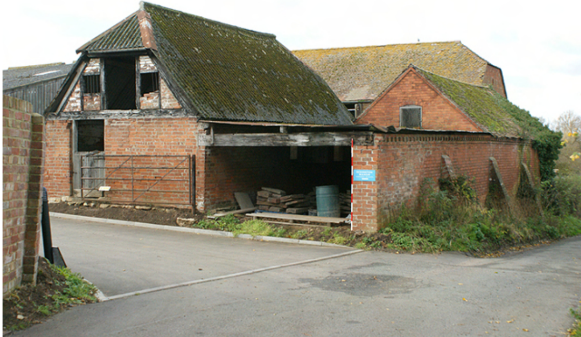
Photograph no. 8 on plan