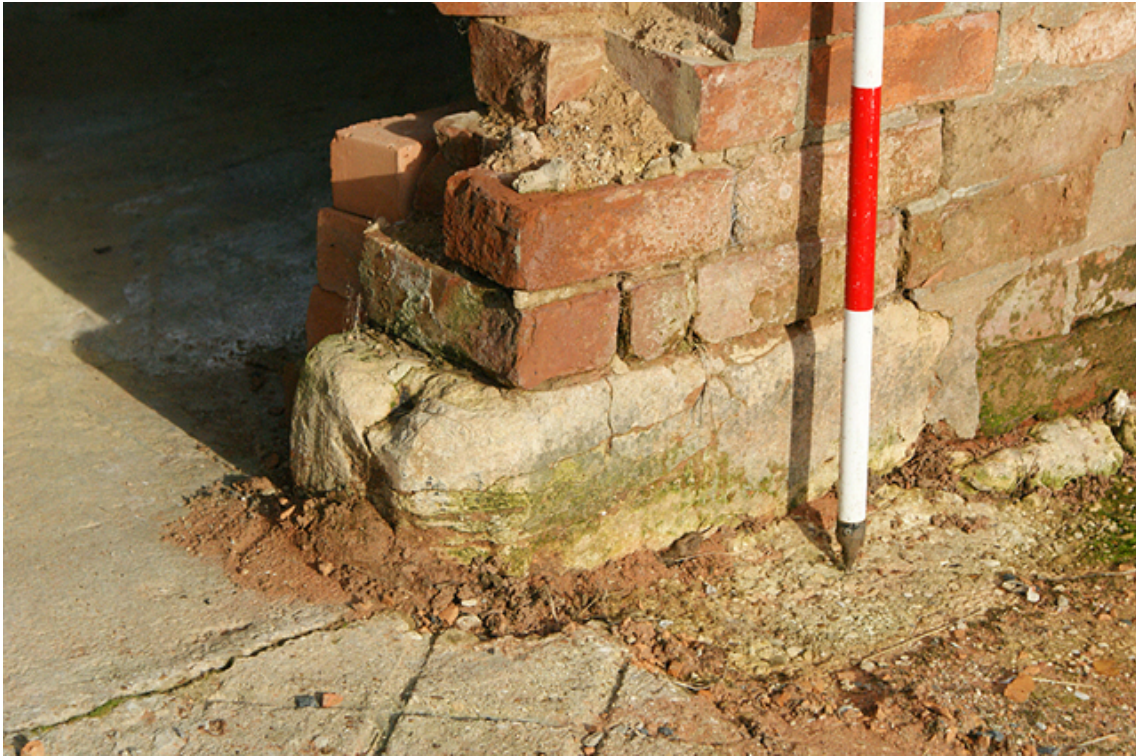
Photograph no. 39 on plan