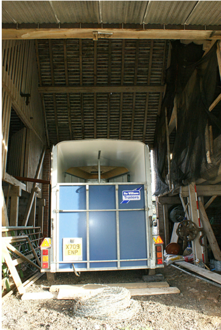
Photograph no. 68 on plan