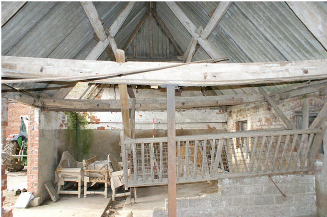
Photograph no. 31 on plan