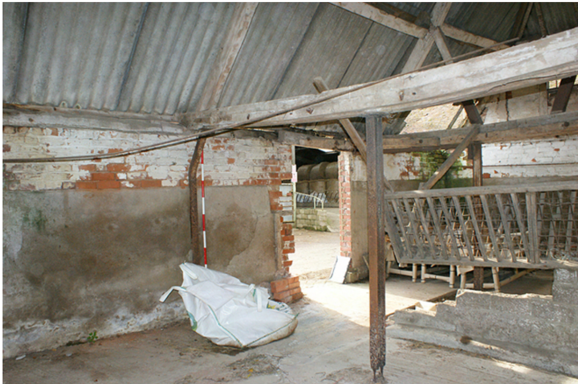
Photograph no. 37 on plan