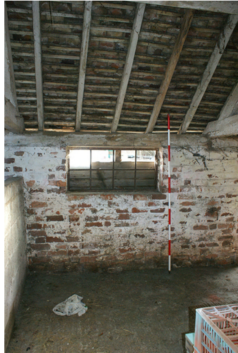
Photograph no. 48 on plan