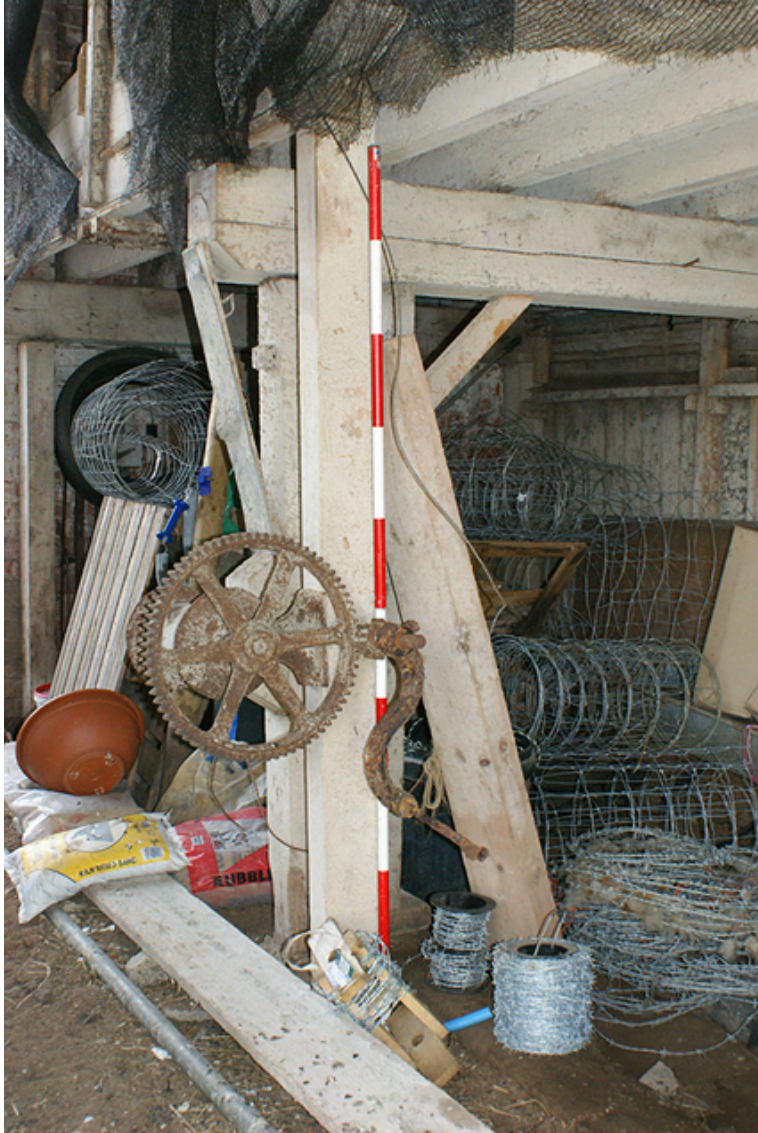
Photograph no. 70 on plan