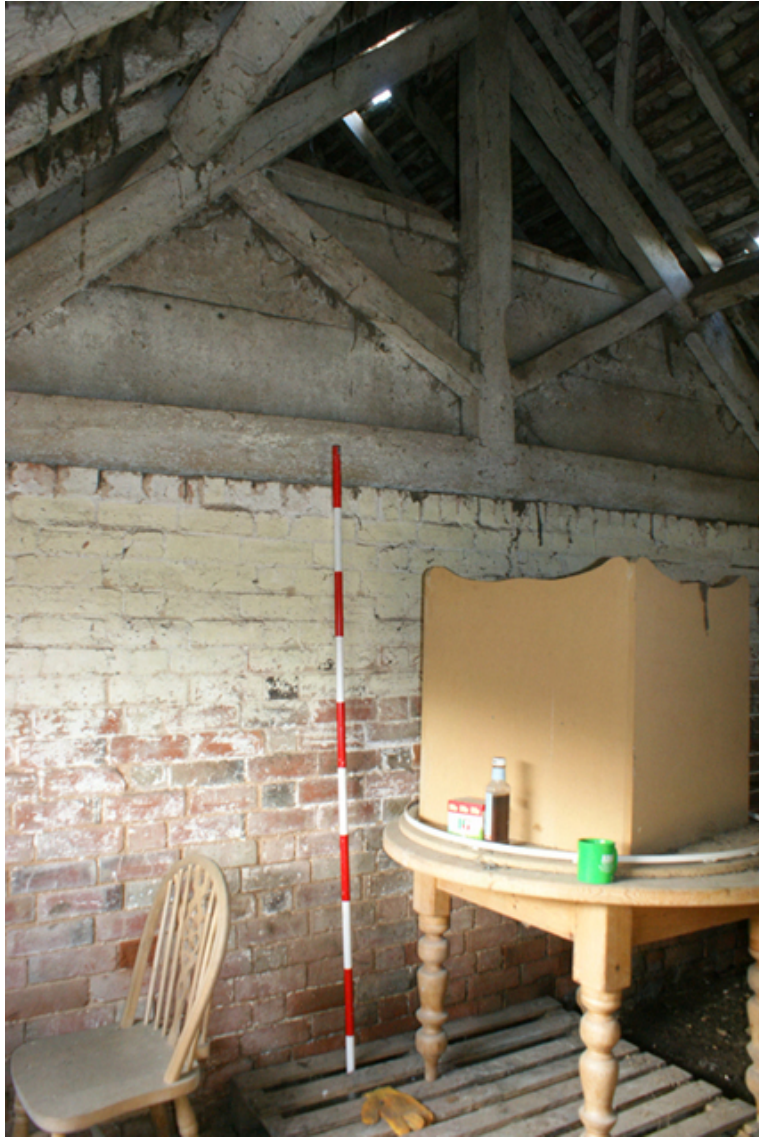
Photograph no. 50 on plan