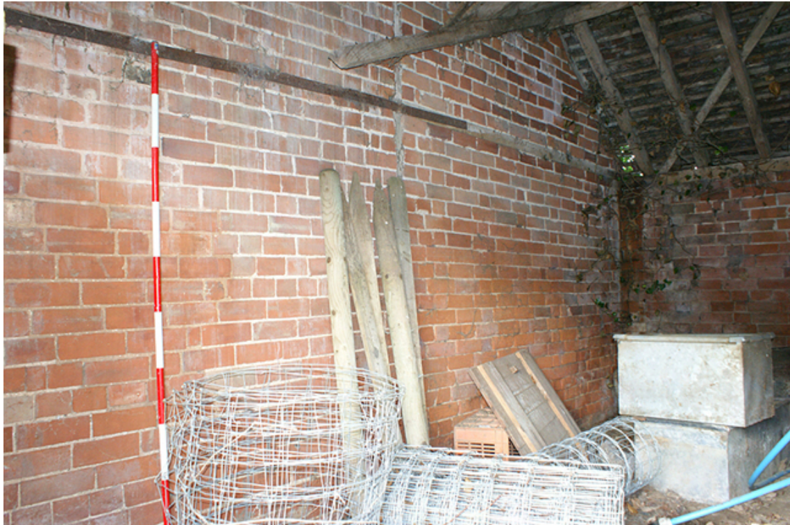
Photograph no. 54 on plan