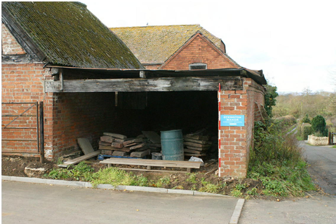
Photograph no. 7 on plan