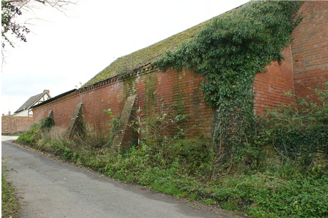
Photograph no. 10 on plan