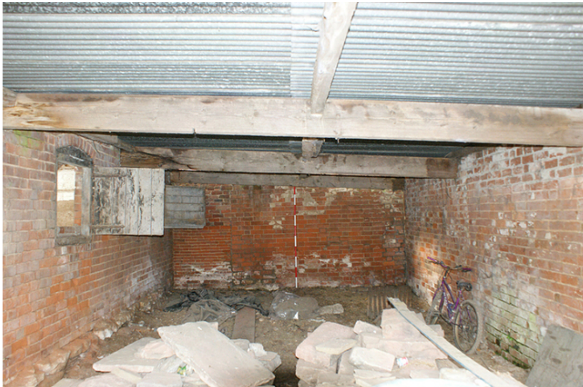
Photograph no. 17 on plan