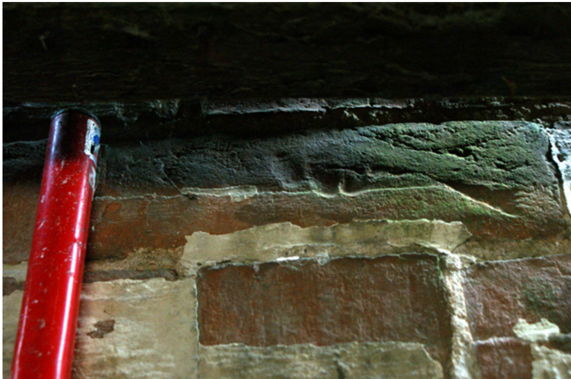
Photograph no. 21 on plan