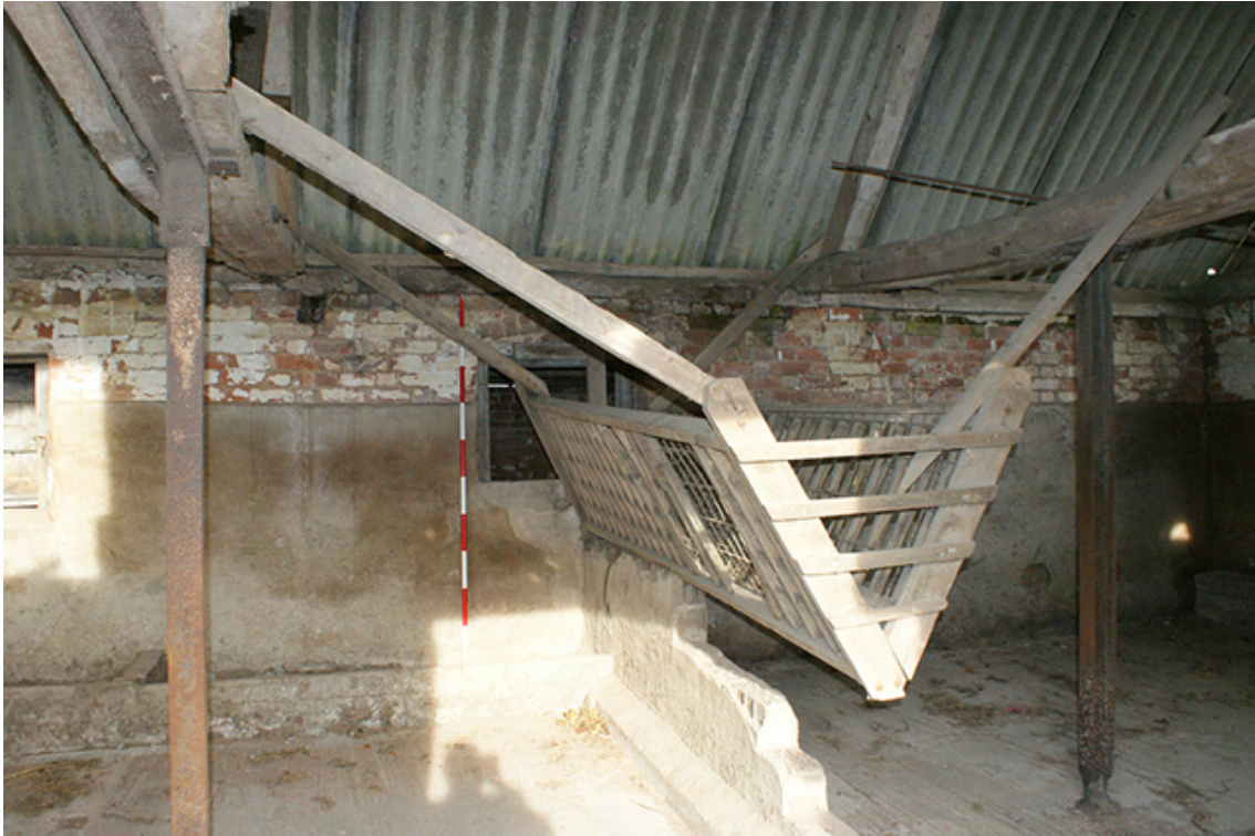
Photograph no. 34 on plan