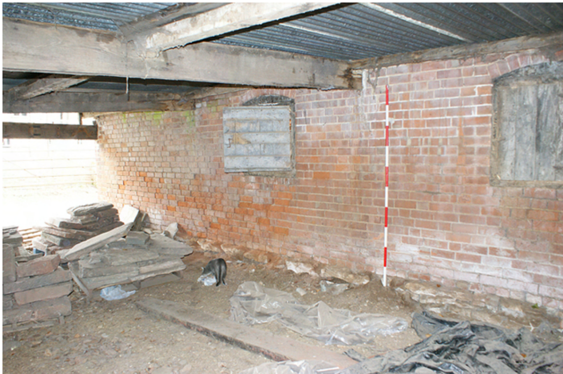
Photograph no. 24 on plan