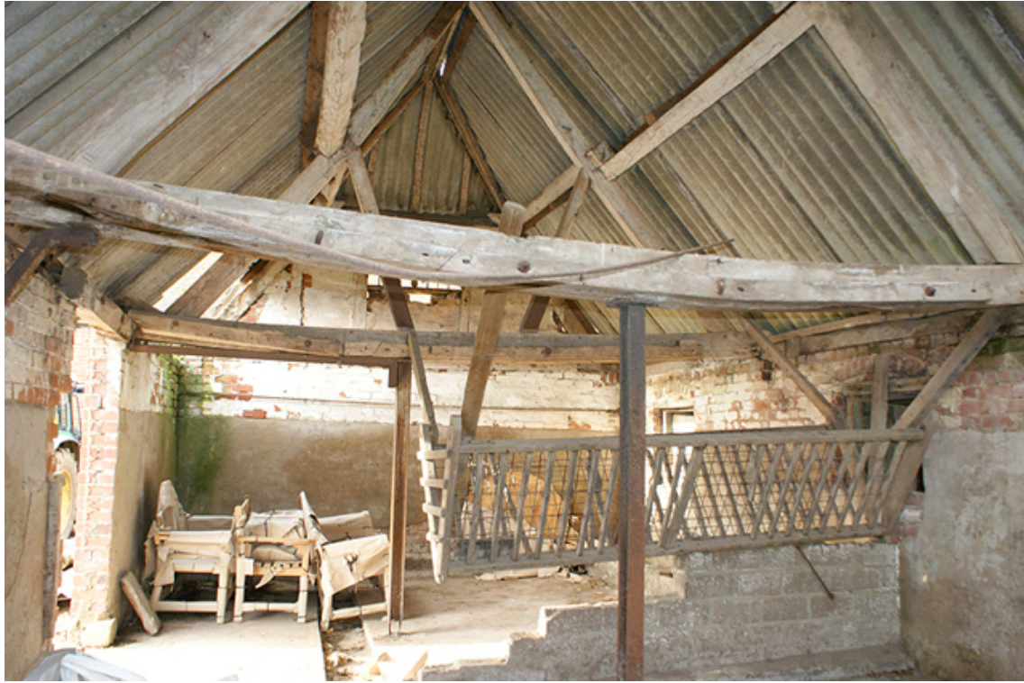
Photograph no. 27 on plan