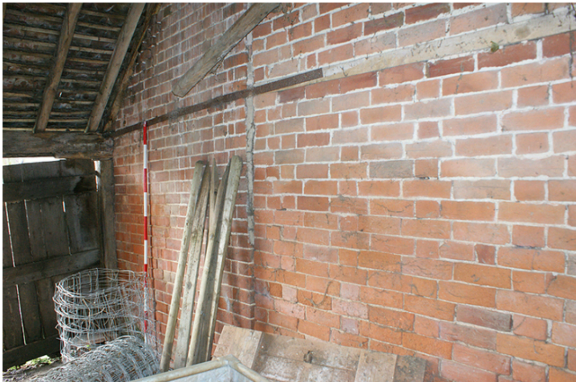
Photograph no. 55 on plan