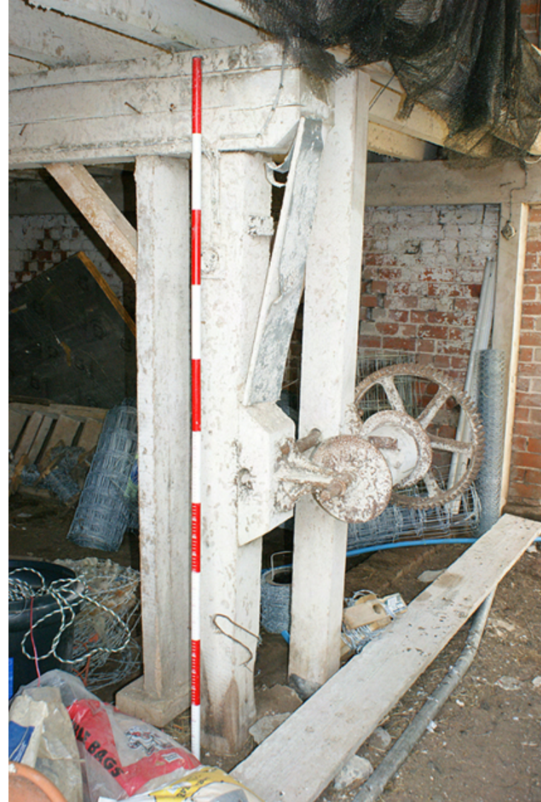
Photograph no. 71 on plan