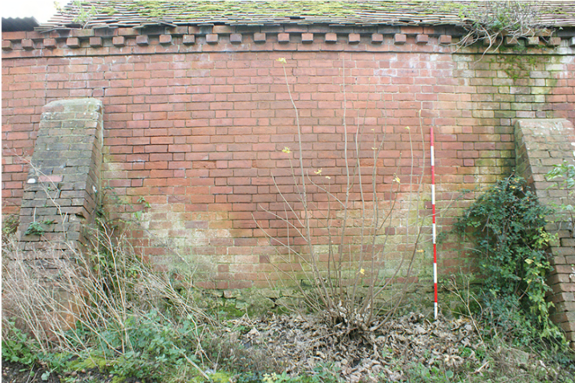
Photograph no. 14 on plan