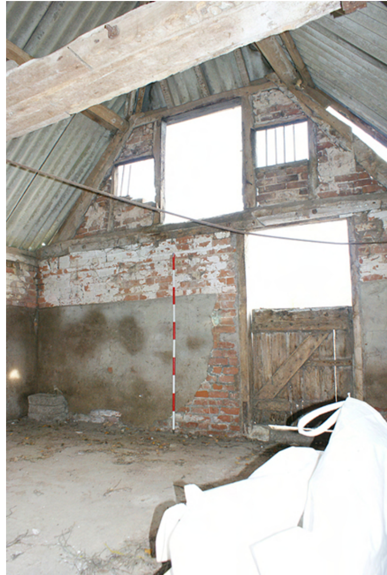
Photograph no. 29 on plan