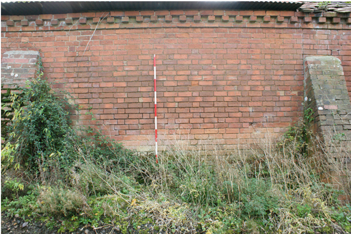
Photograph no. 15 on plan