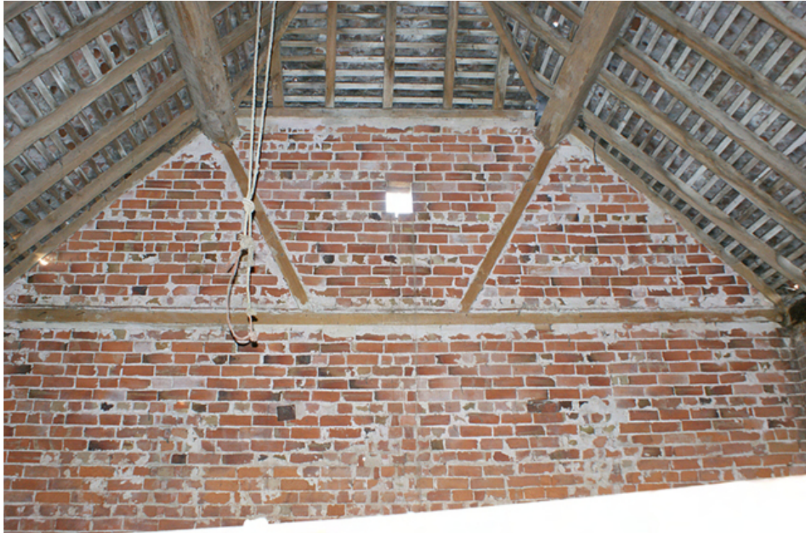
Photograph no. 76 on plan