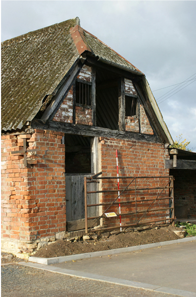
Photograph no. 4 on plan