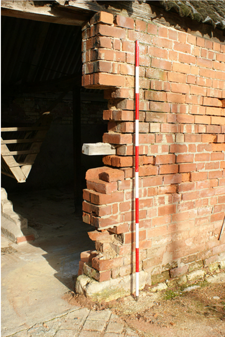
Photograph no. 38 on plan