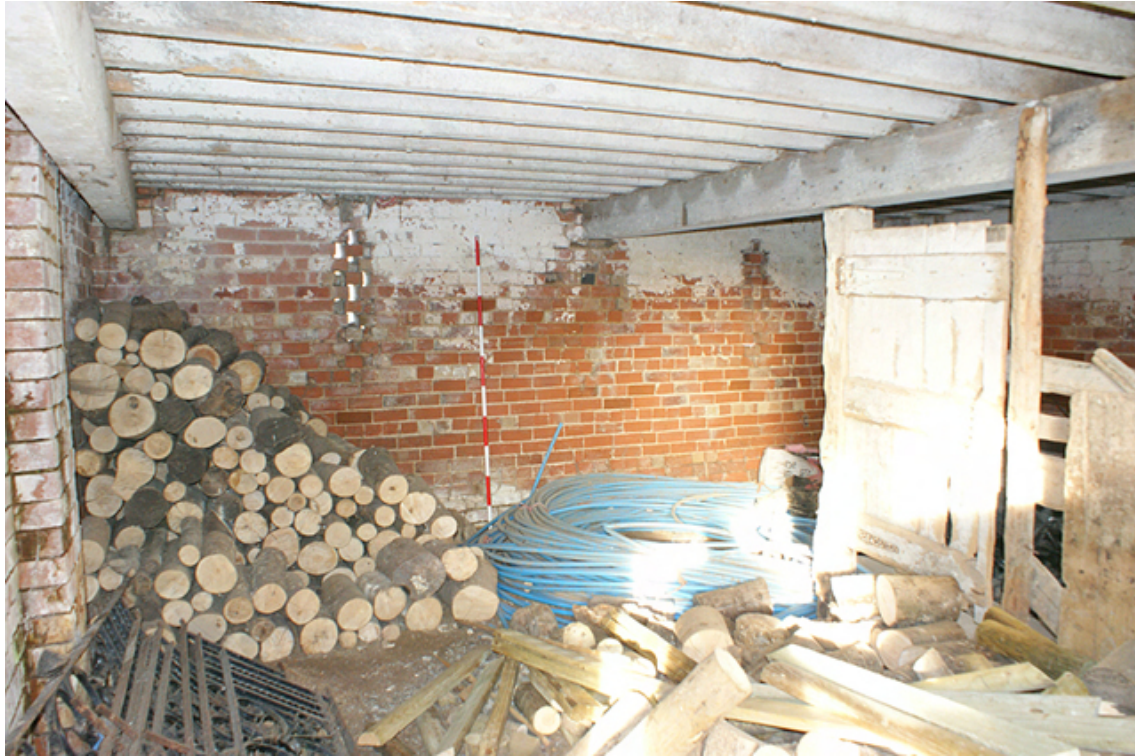
Photograph no. 74 on plan