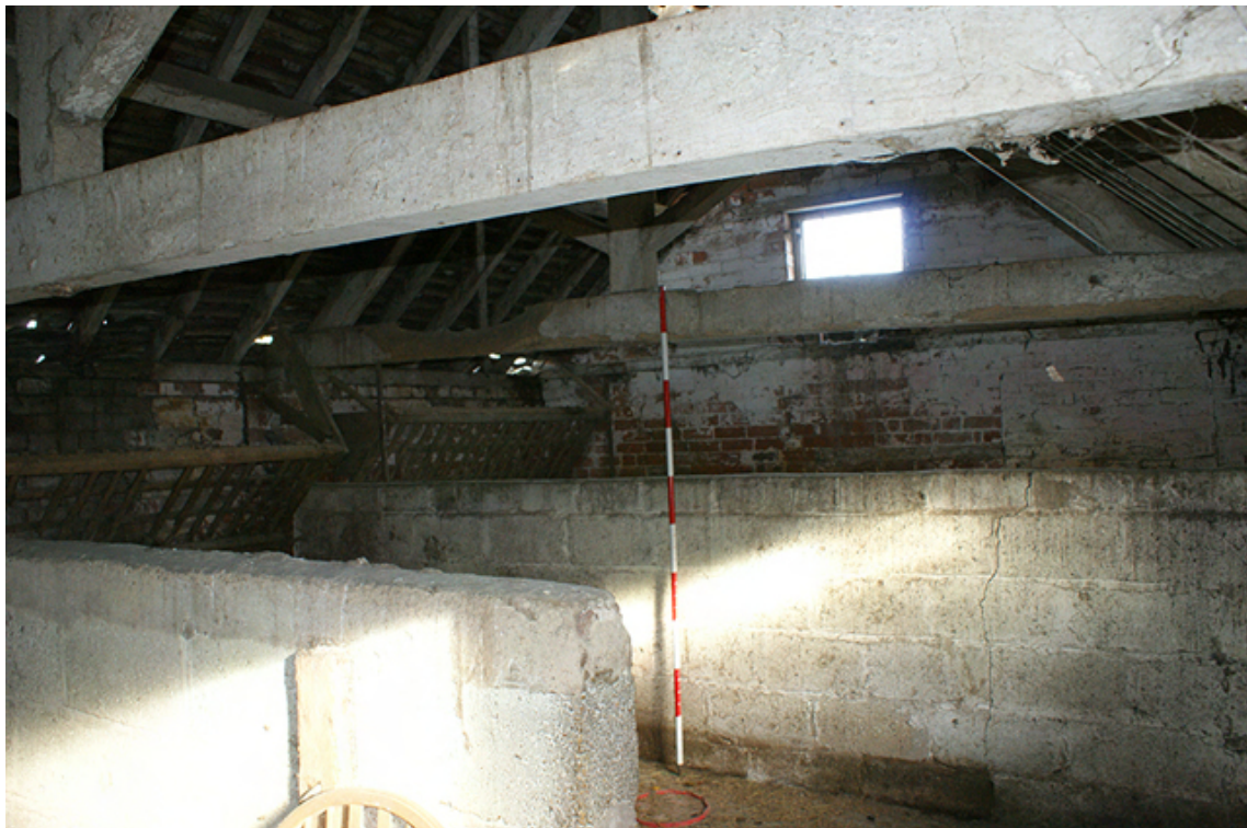
Photograph no. 46 on plan