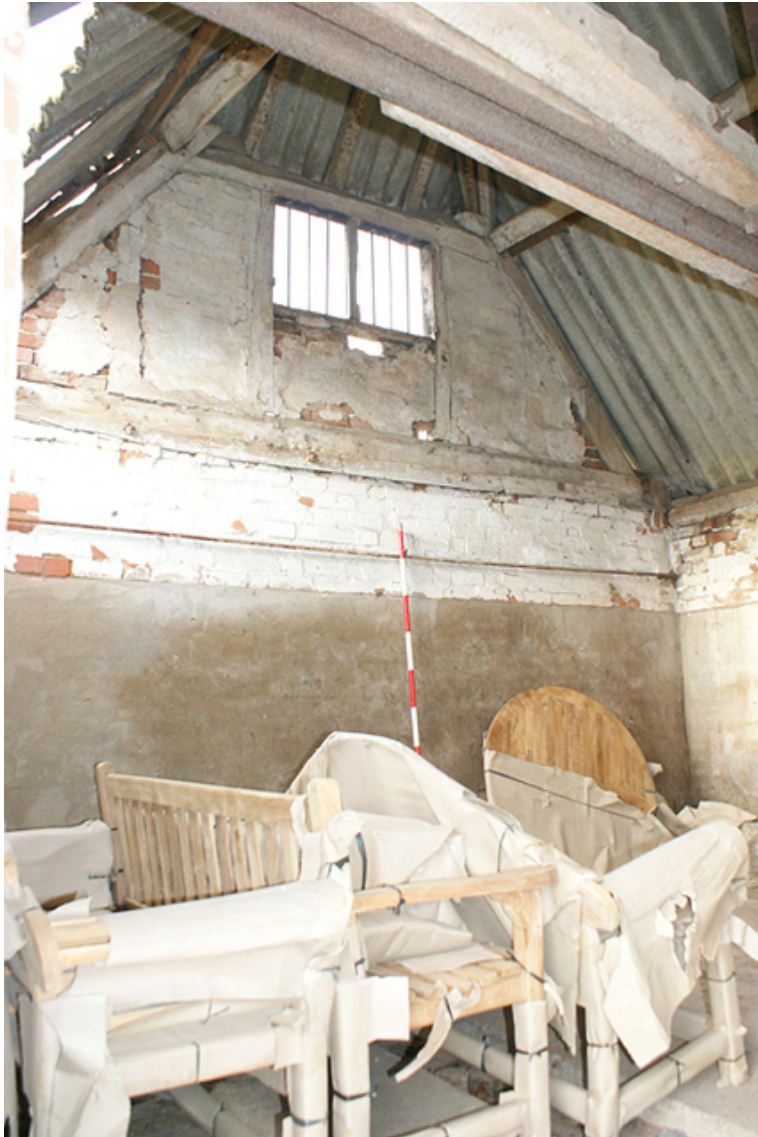
Photograph no. 28 on plan