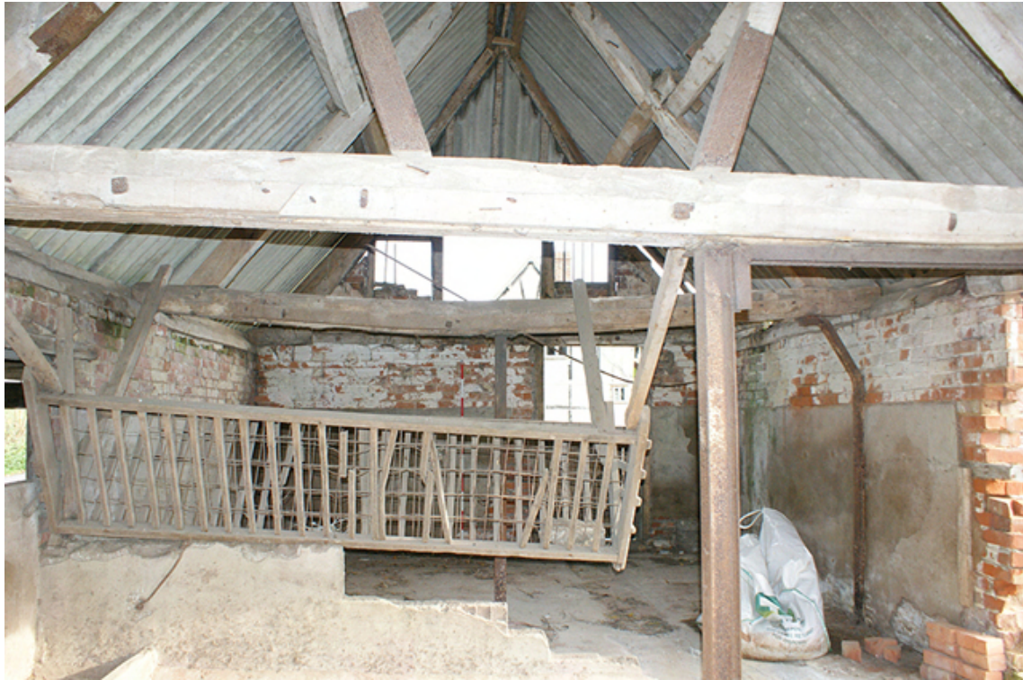
Photograph no. 30 on plan