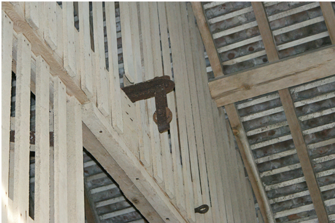
Photograph no. 79 on plan