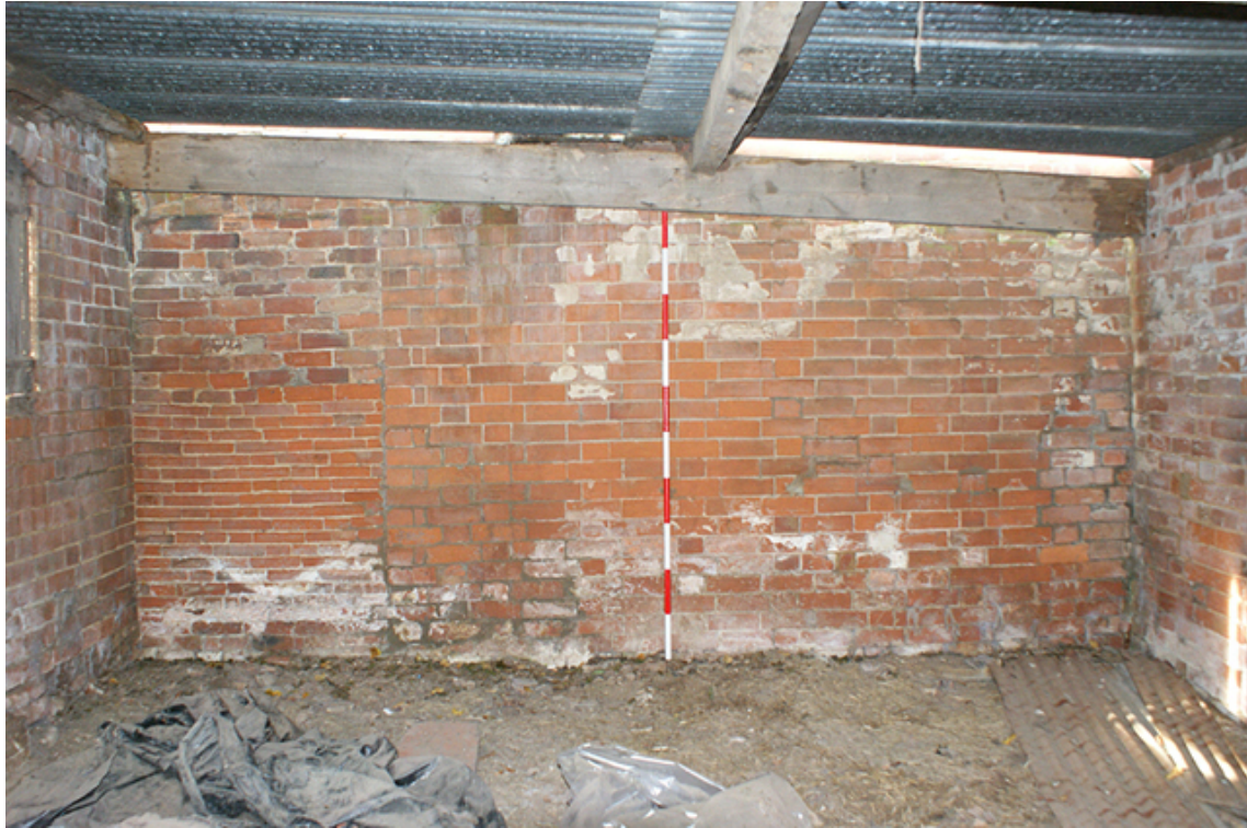
Photograph no. 20 on plan