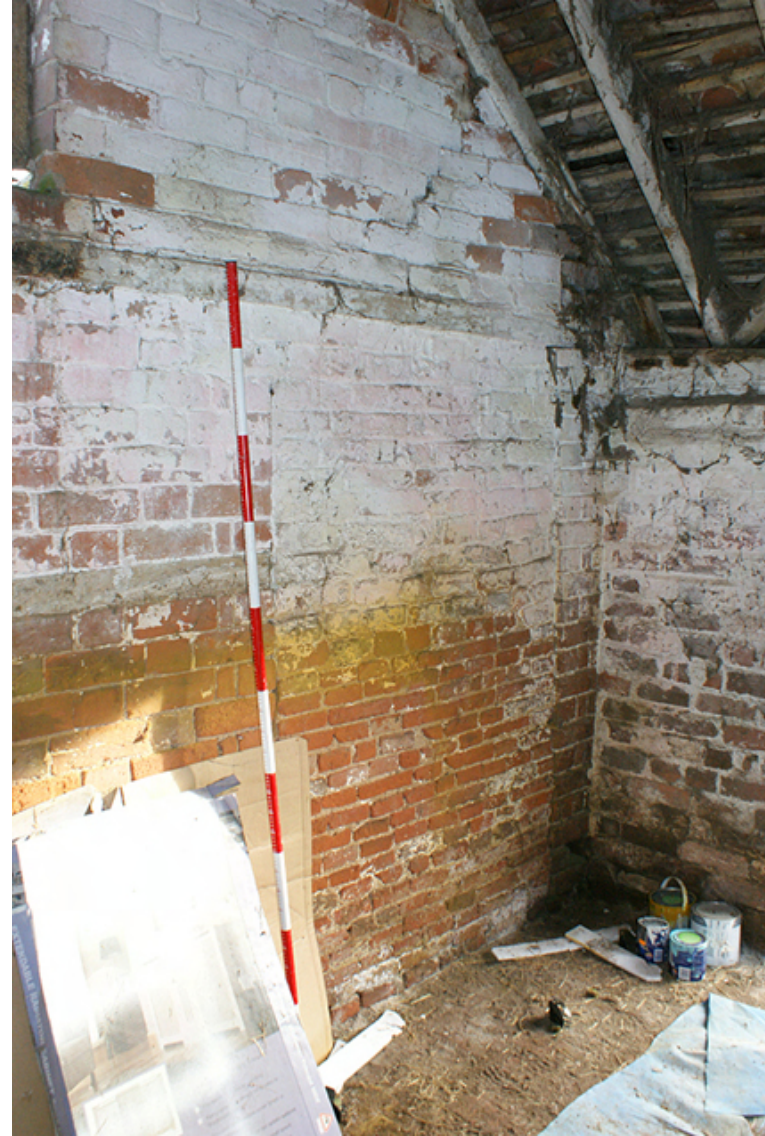
Photograph no. 44 on plan