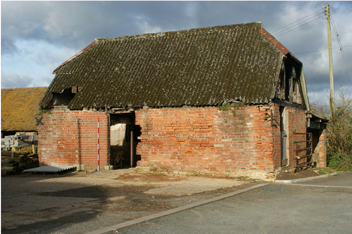
Photograph no. 2 on plan