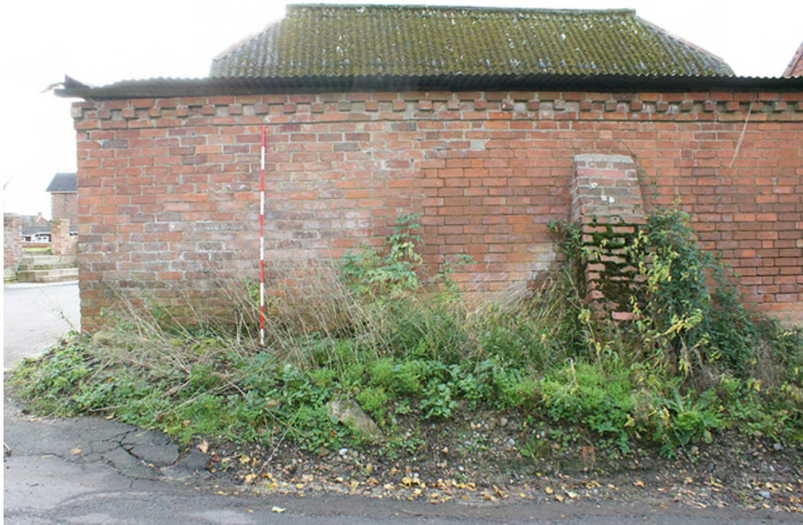
Photograph no. 16 on plan