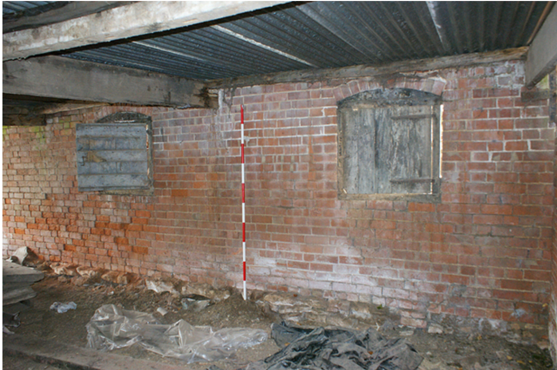
Photograph no. 23 on plan