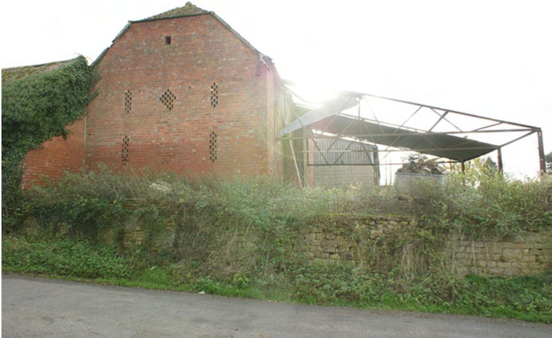
Photograph no. 12 on plan