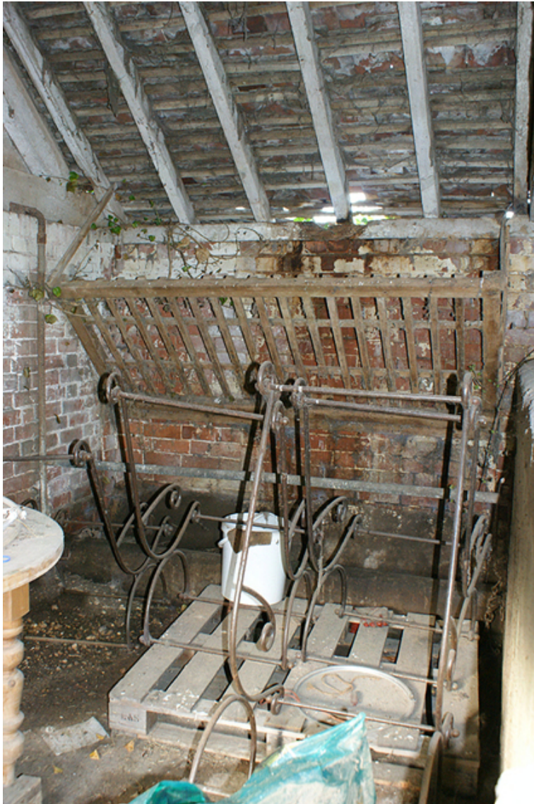
Photograph no. 52 on plan