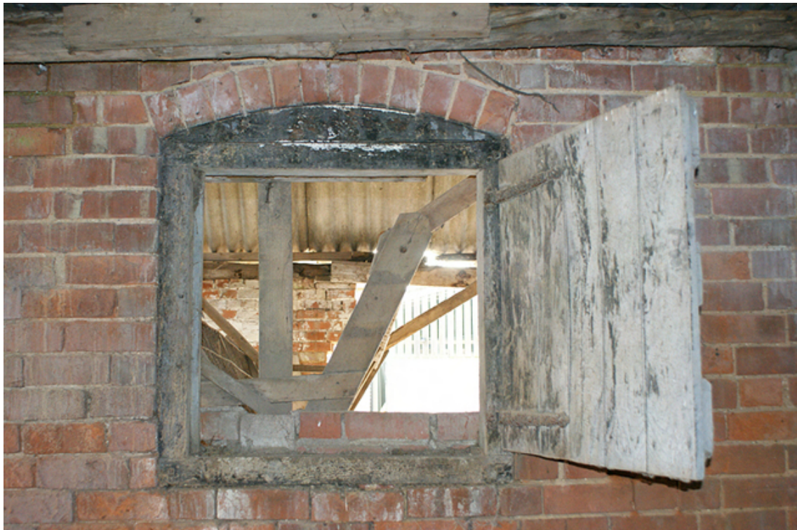
Photograph no. 26 on plan