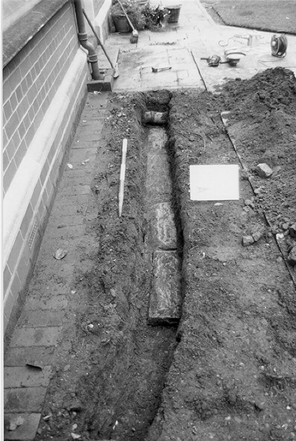
Plate 6: Stone flagged surface, 102.