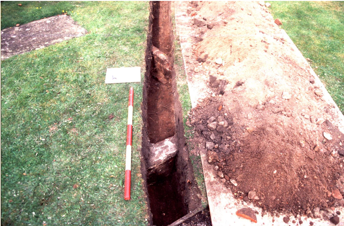
Plate 2: Walls 10 and 11.