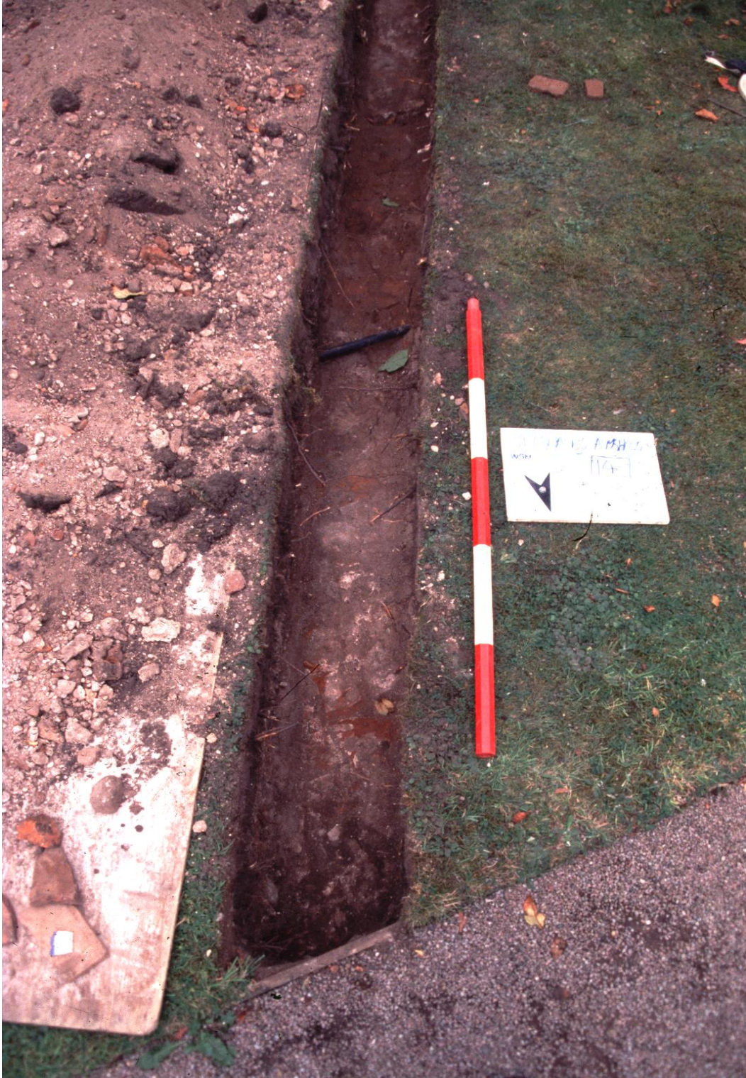
Plate 4: Brick floor.