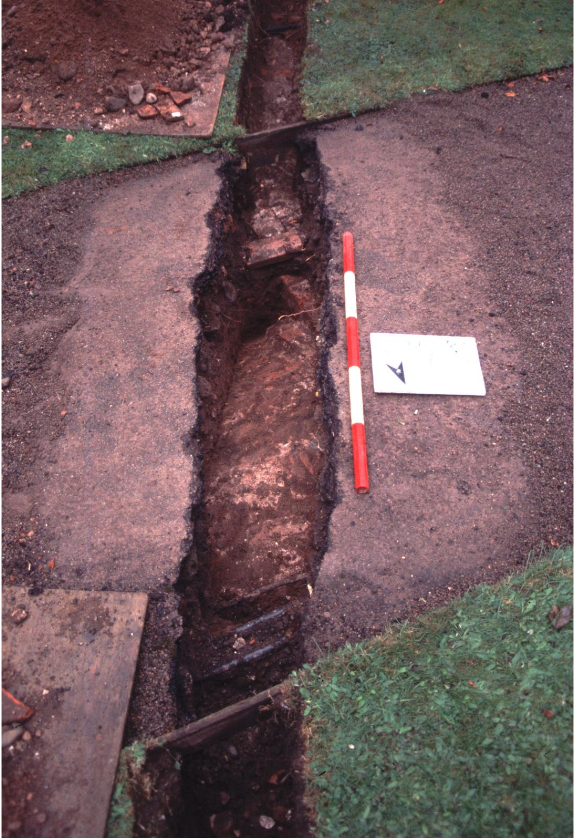
Plate 3: Brick vault.