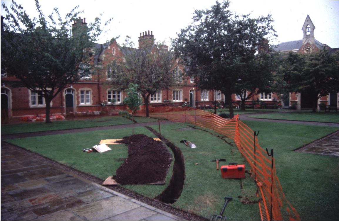
Plate 1: Route of cable trench through courtyard.