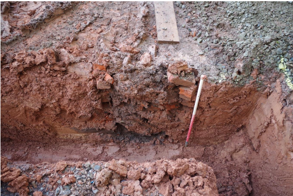
Plate 2: Sample section through footing trench, with brick lined well 101, cutting the natural clay, scale 1m, view west