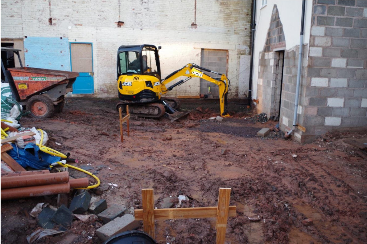
Plate 1: The area of the footing trench, reduced to natural clay prior to monitoring, view north