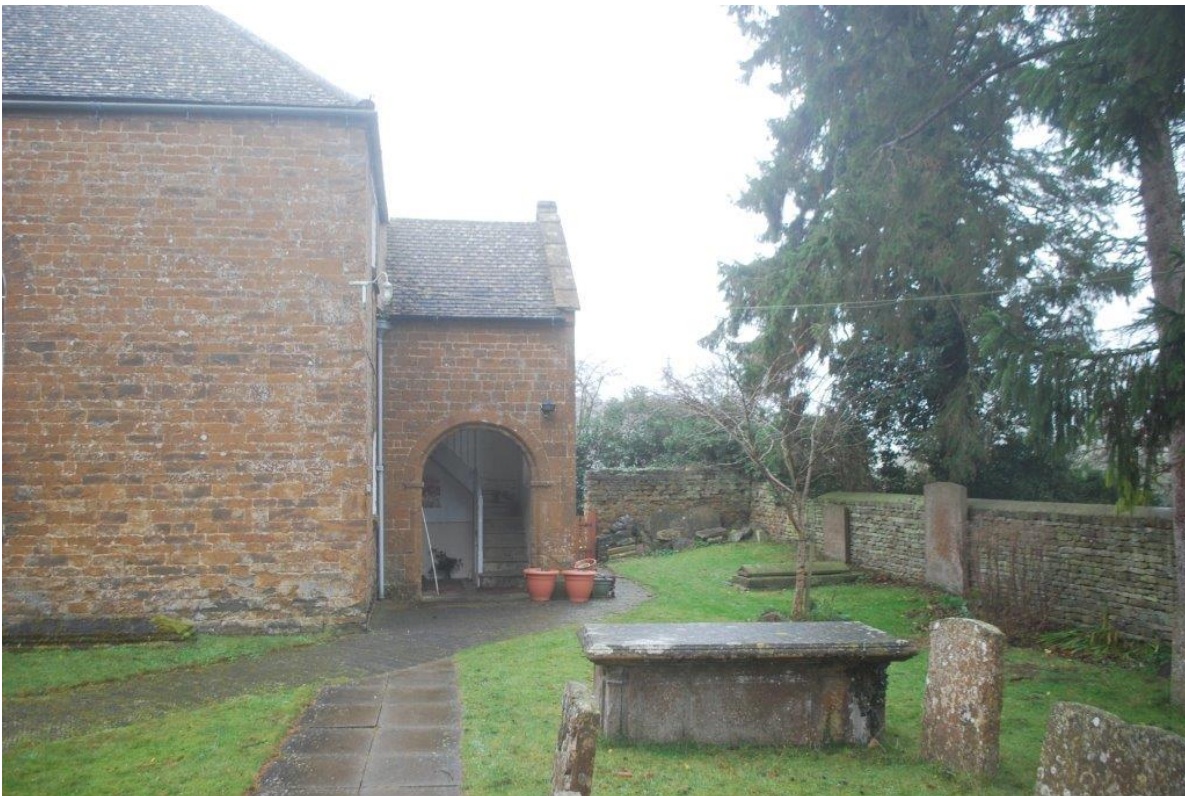
Plate 2 The Baptist chapel porch and listed chest tomb, view south