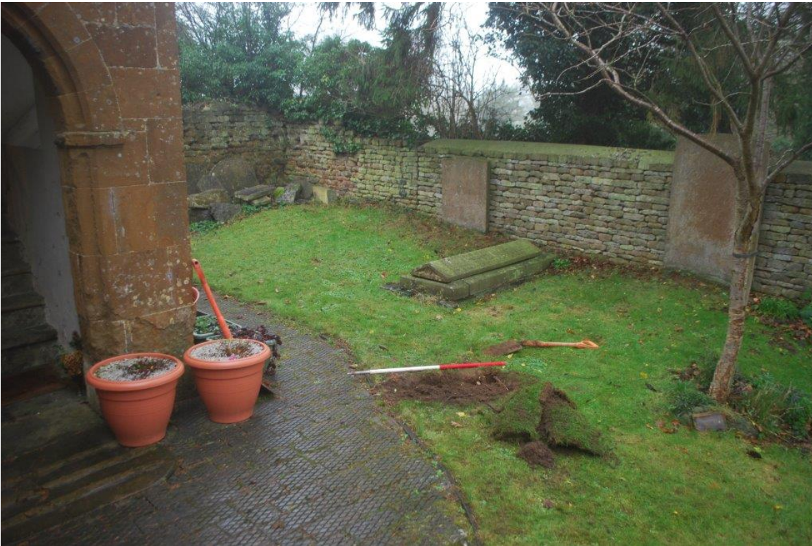
Plate 3 Trench 1 location with turf removed, view south-west, 1m scale