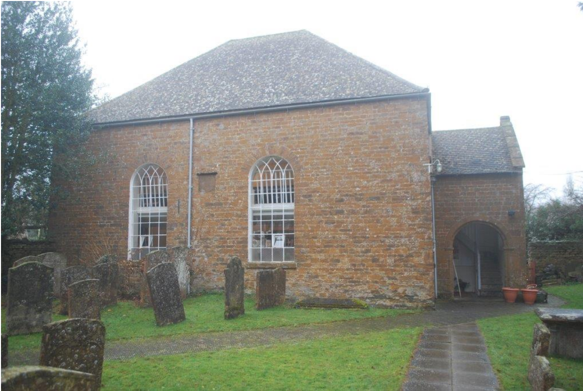
Plate 1 The Baptist chapel and porch, view south