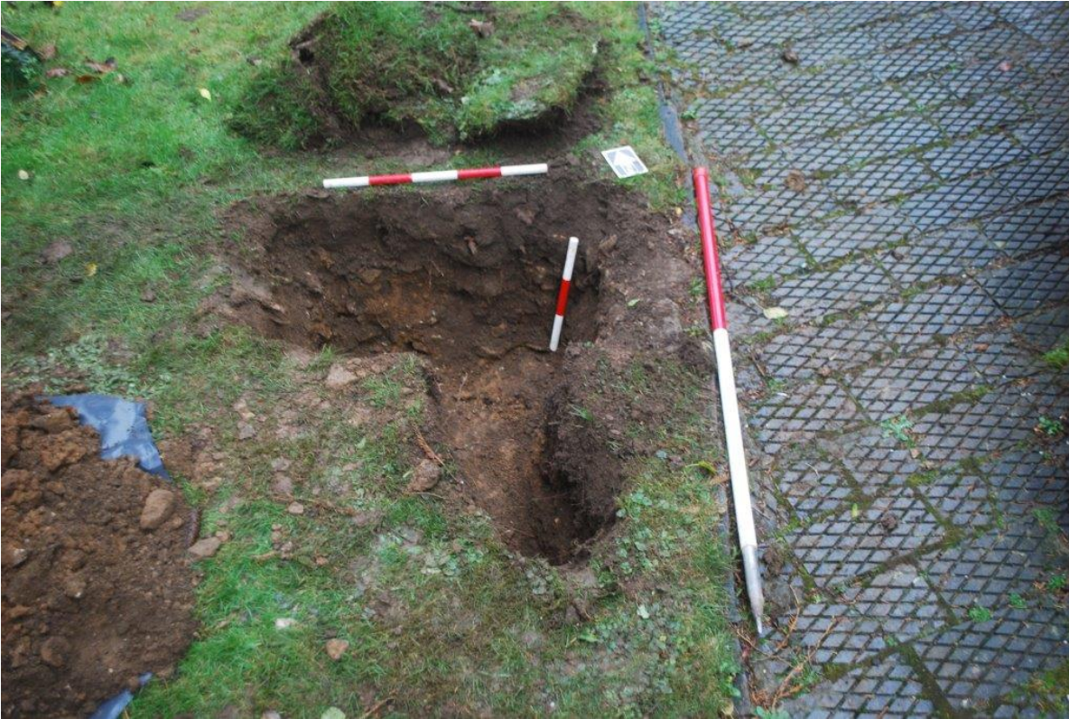
Plate 5 Trench 1 close up of sections looking north-east. 1m, 0.50m and 0.30m scales