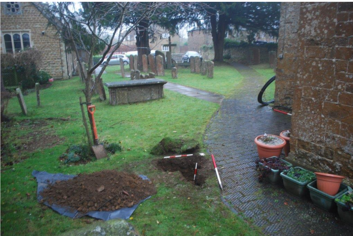
Plate 4 Trench 1 following excavation, with listed chest tomb in background, view north-east, 1m, 0.50m and 0.30m scales