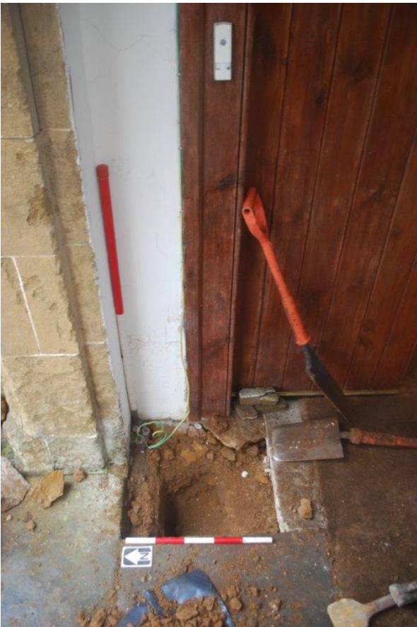
Plate 6 Trench 2 within the porch; floor slab broken out onto natural ground, view east, 1m and 0.50m scales