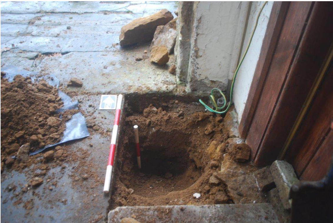
Plate 7 Trench 2 excavated, view north, 0.50m and 0.30m scales