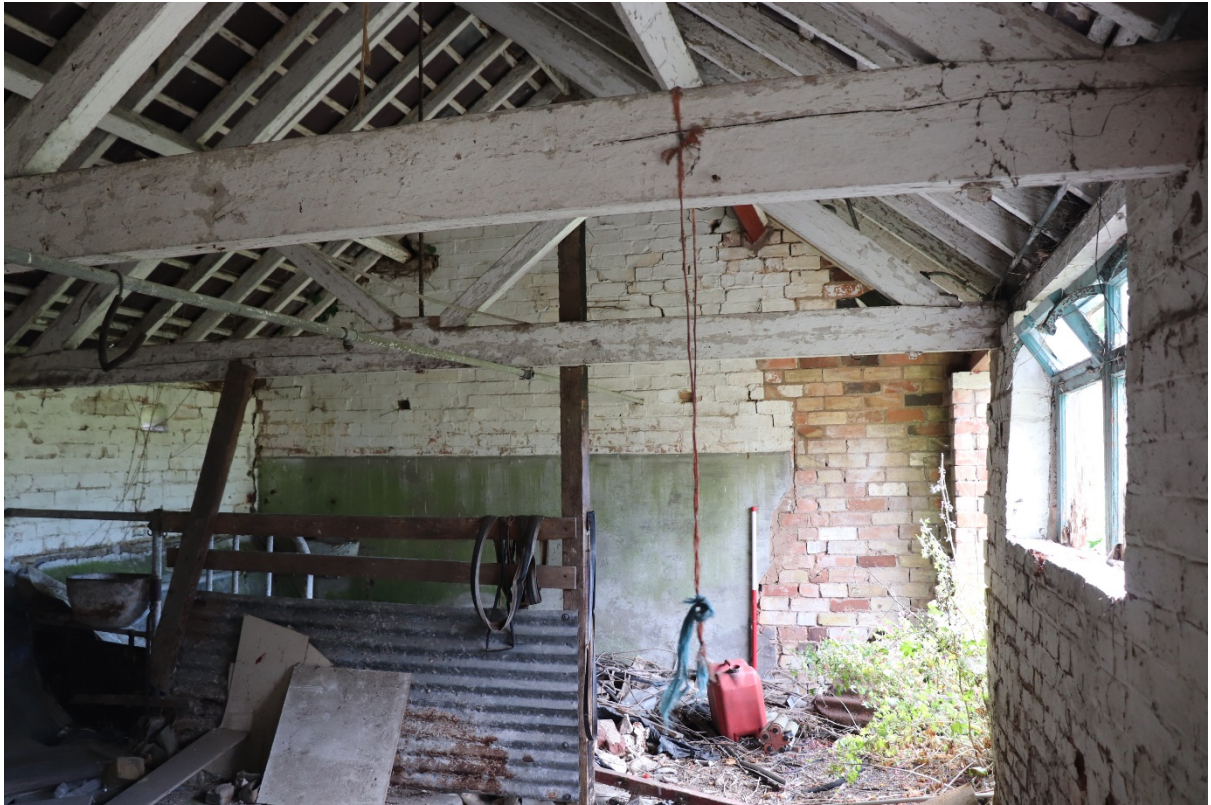
Plate 13 The building interior, looking east, scale 1m