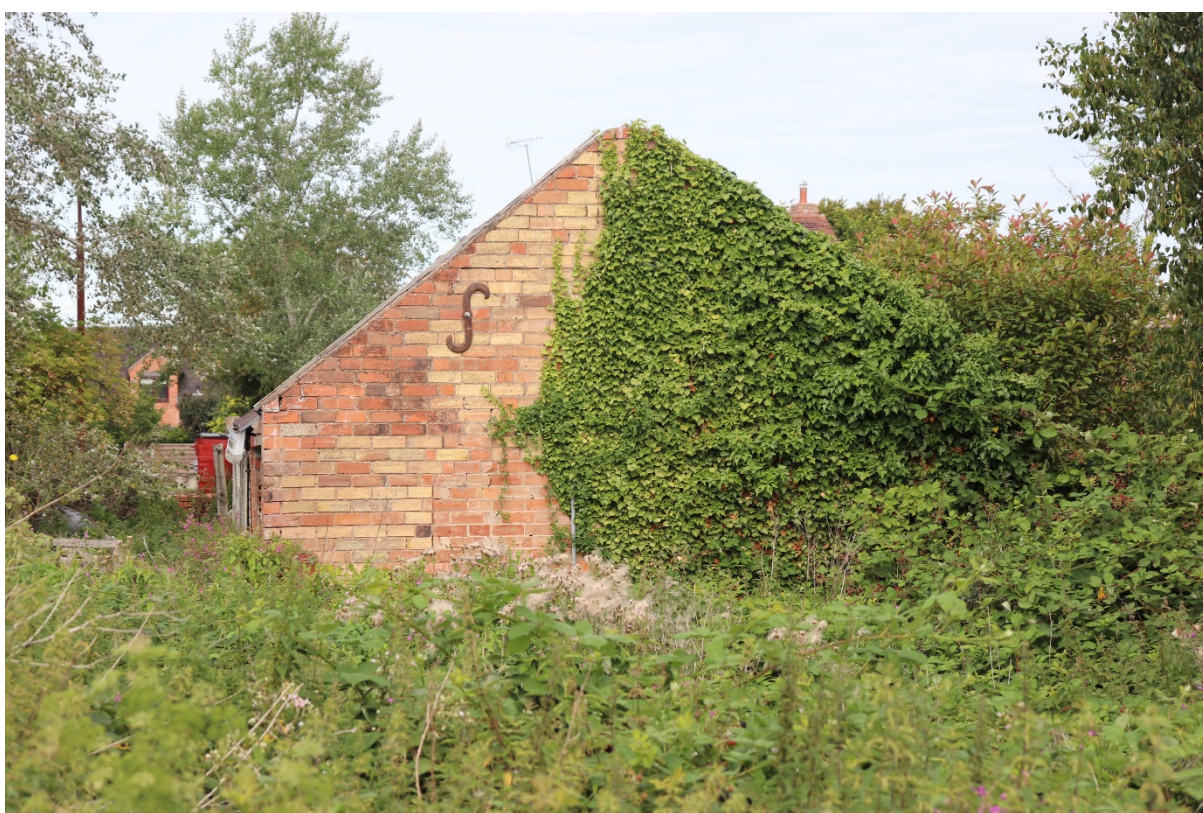
Plate 6 The building, looking north-west, scale 1m