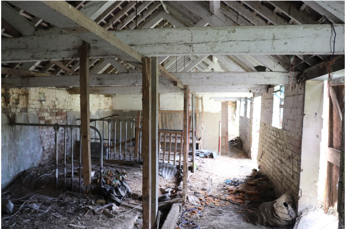
Plate 11 The building interior, looking east, scale 1m