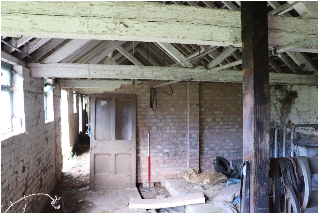
Plate 12 The building interior, looking west, scale 1m