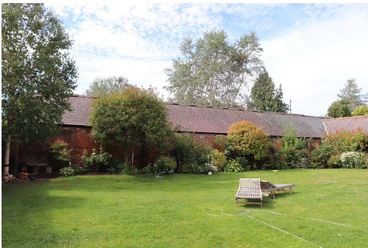
Plate 4 The building, looking south, scale 1m