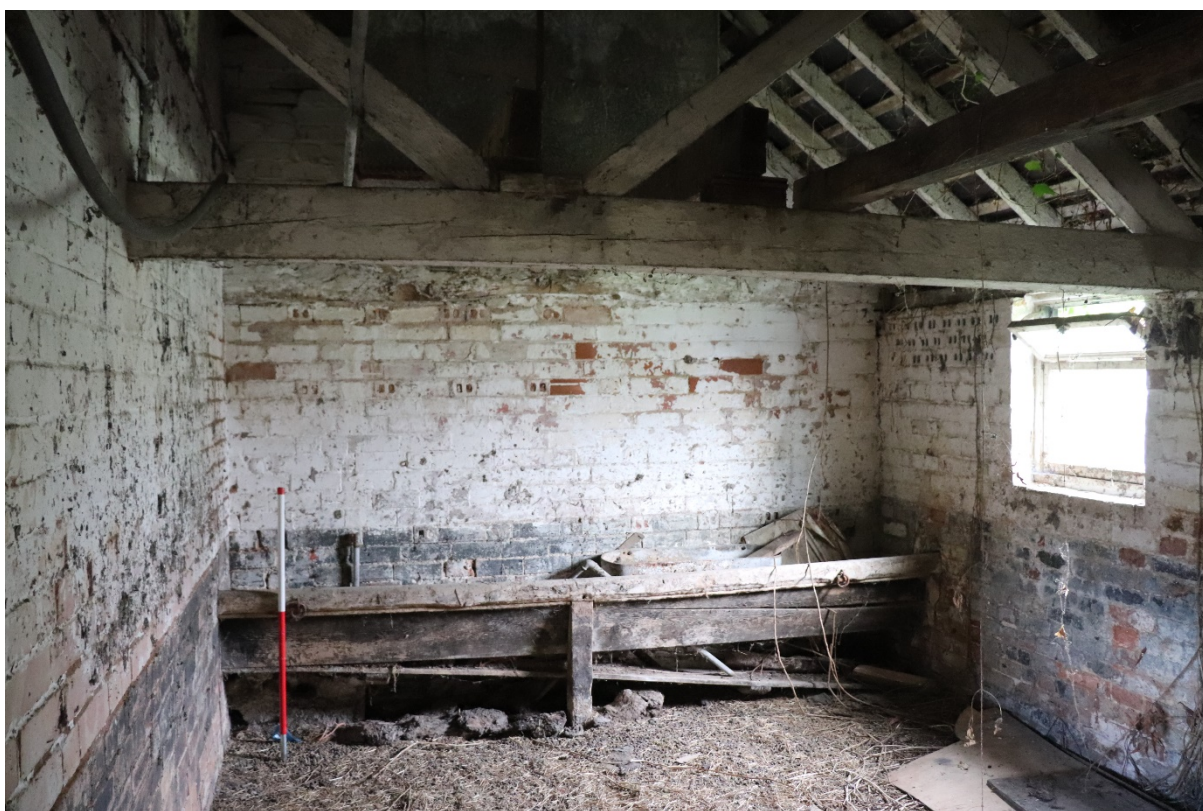
Plate 8 The building interior, looking west, scale 1m