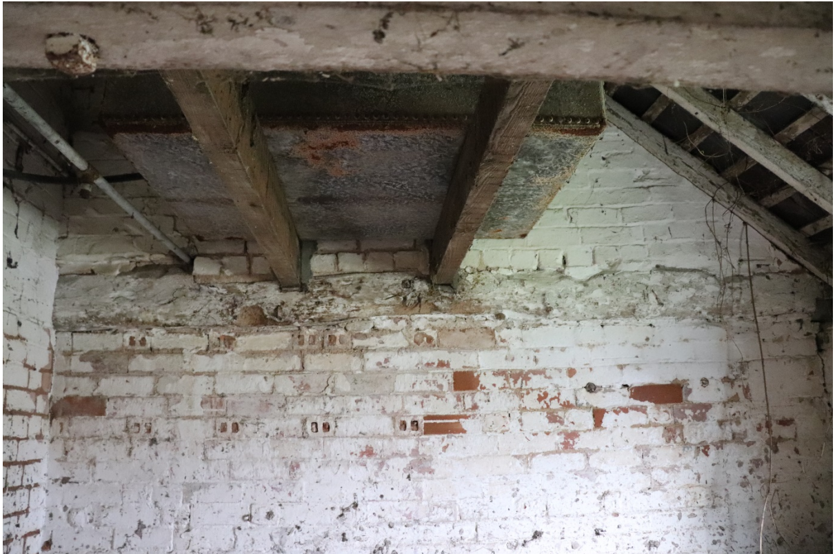
Plate 9 The building interior re-used timber, utilised as a tie beam, looking west, scale 1m