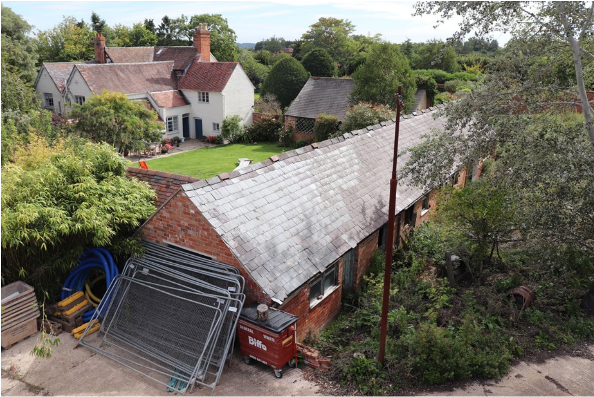
Plate 1 The building with Ashmore House behind, looking north-east