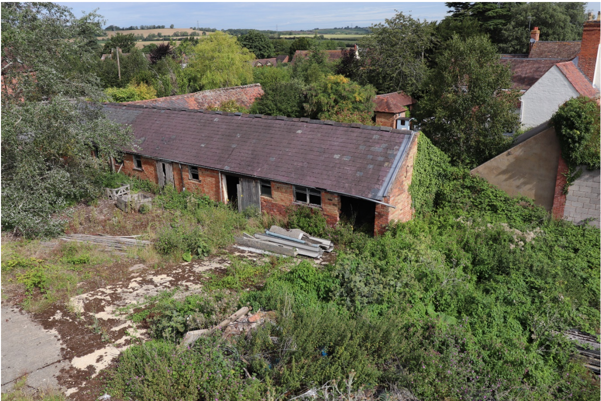
Plate 2 The building with Ashmore House behind, looking north-west