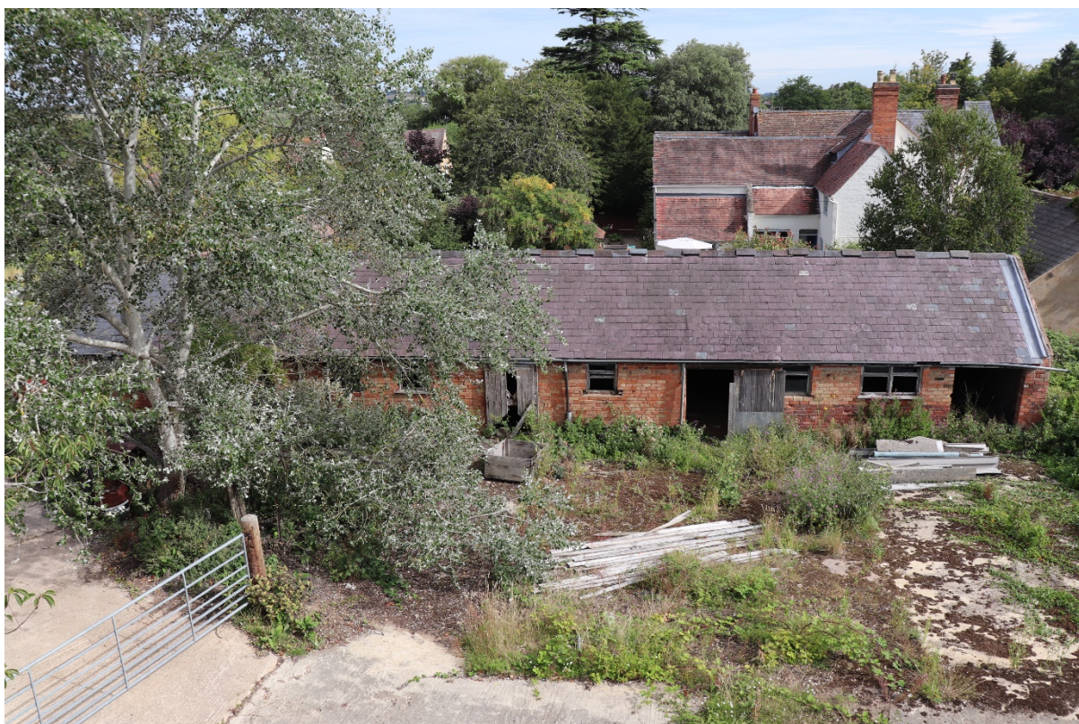
Plate 3 The building with Ashmore House behind, looking north