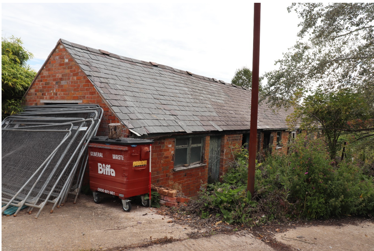
Plate 7 The building, looking north-east, scale 1m