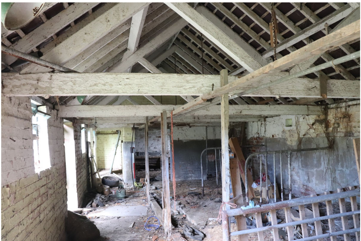
Plate 10 The building interior, looking west, scale 1m