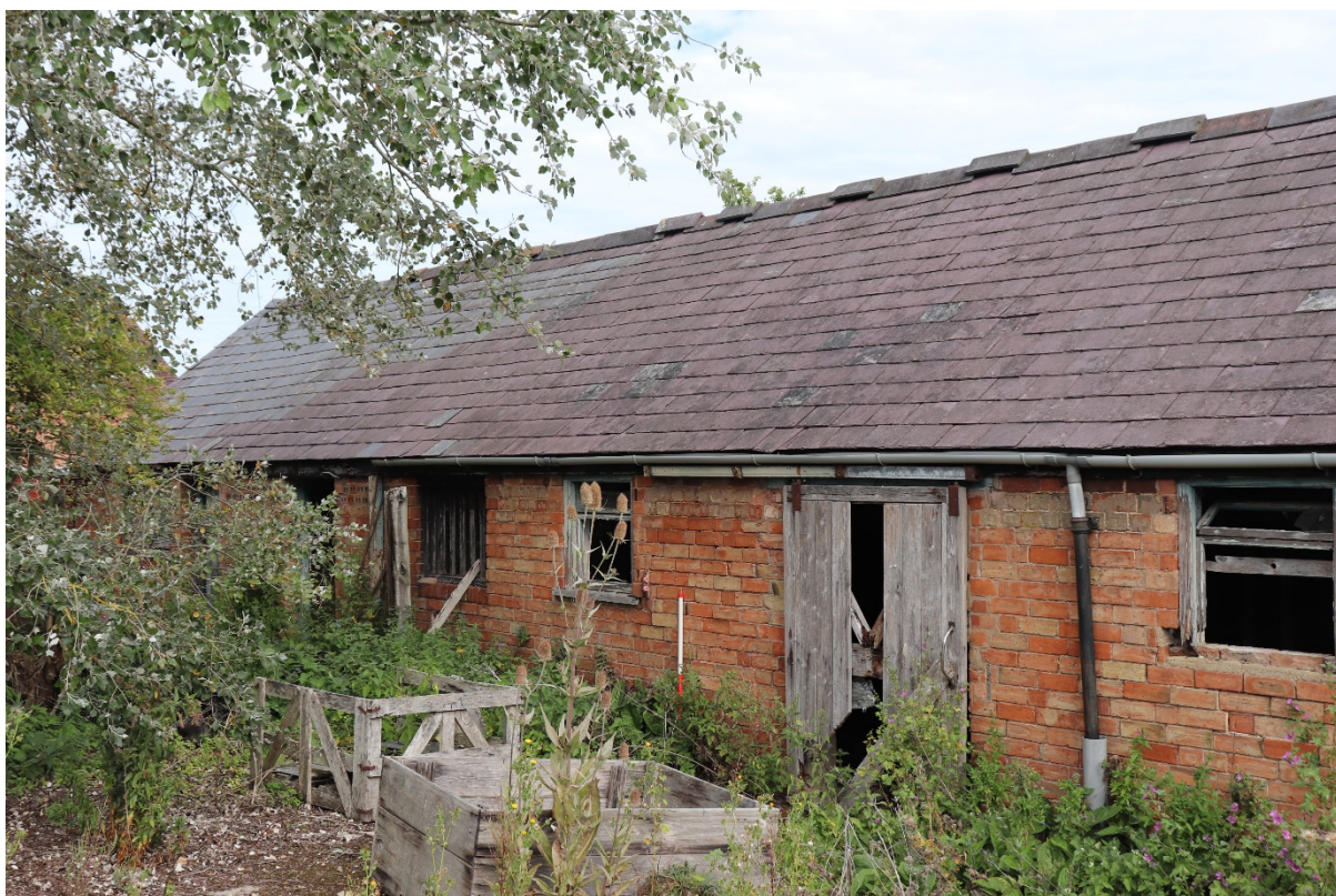
Plate 5 The building, looking north-west, scale 1m